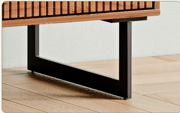
Solid metal legs

Important Notice: This device must be installed; otherwise, you will bear all consequences.