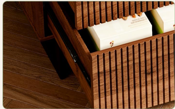
Smooth drawer slides

Image: Close-up showing the wall-mounted anti-tipping device, solid metal legs, and a drawer with smooth slides.