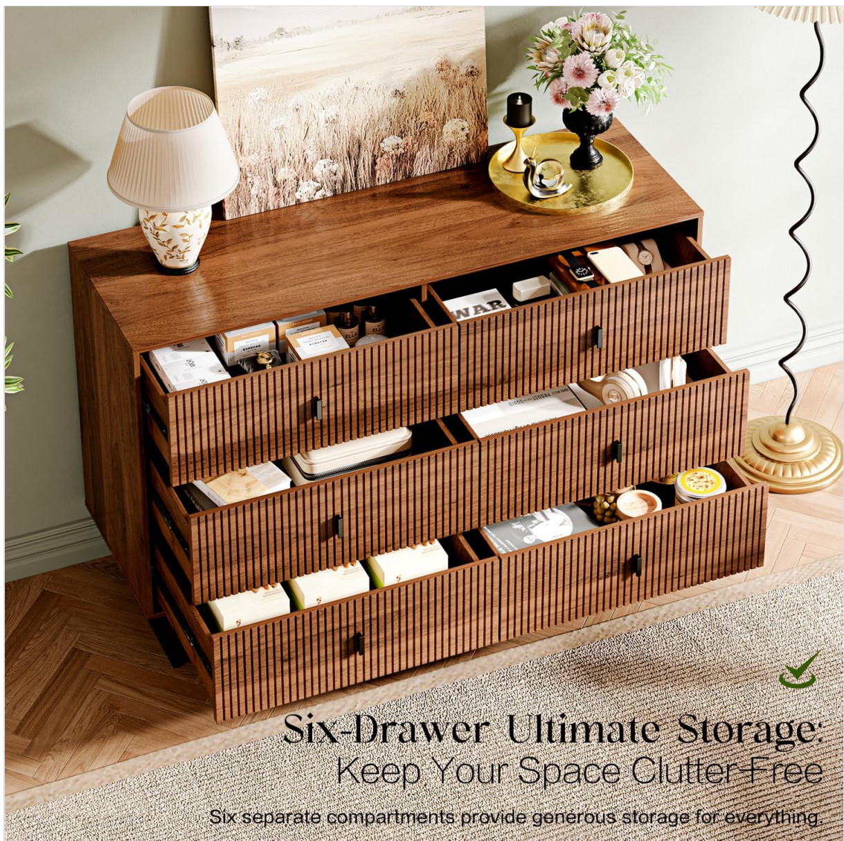
Image: Top-down view of the chest with all six drawers open, revealing neatly organized contents like clothes, books, and small boxes.

The six drawers are equipped with smooth metal ball-bearing slides, allowing for effortless pushing and pulling. This design ensures easy access to your stored items and a longer service life. The deep drawers provide ample space for organizing clothes, accessories, or other household items.