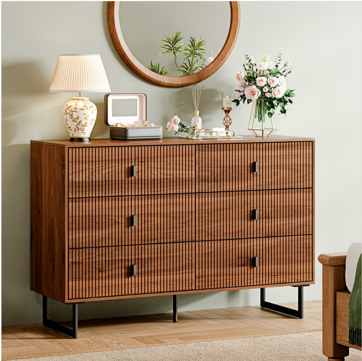
Image: Front view of the assembled Chrangmay Modern 6-Drawer Chest in brown.