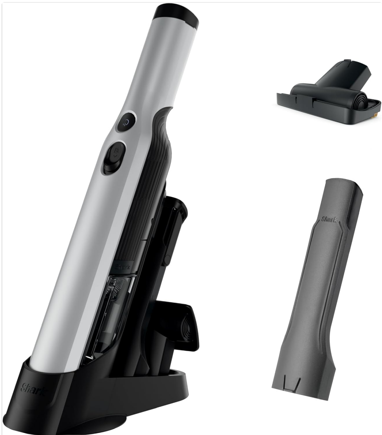
Image: The Shark WANDVAC handheld vacuum is shown with its charging dock and both the Crevice Tool and FurFins Tool.