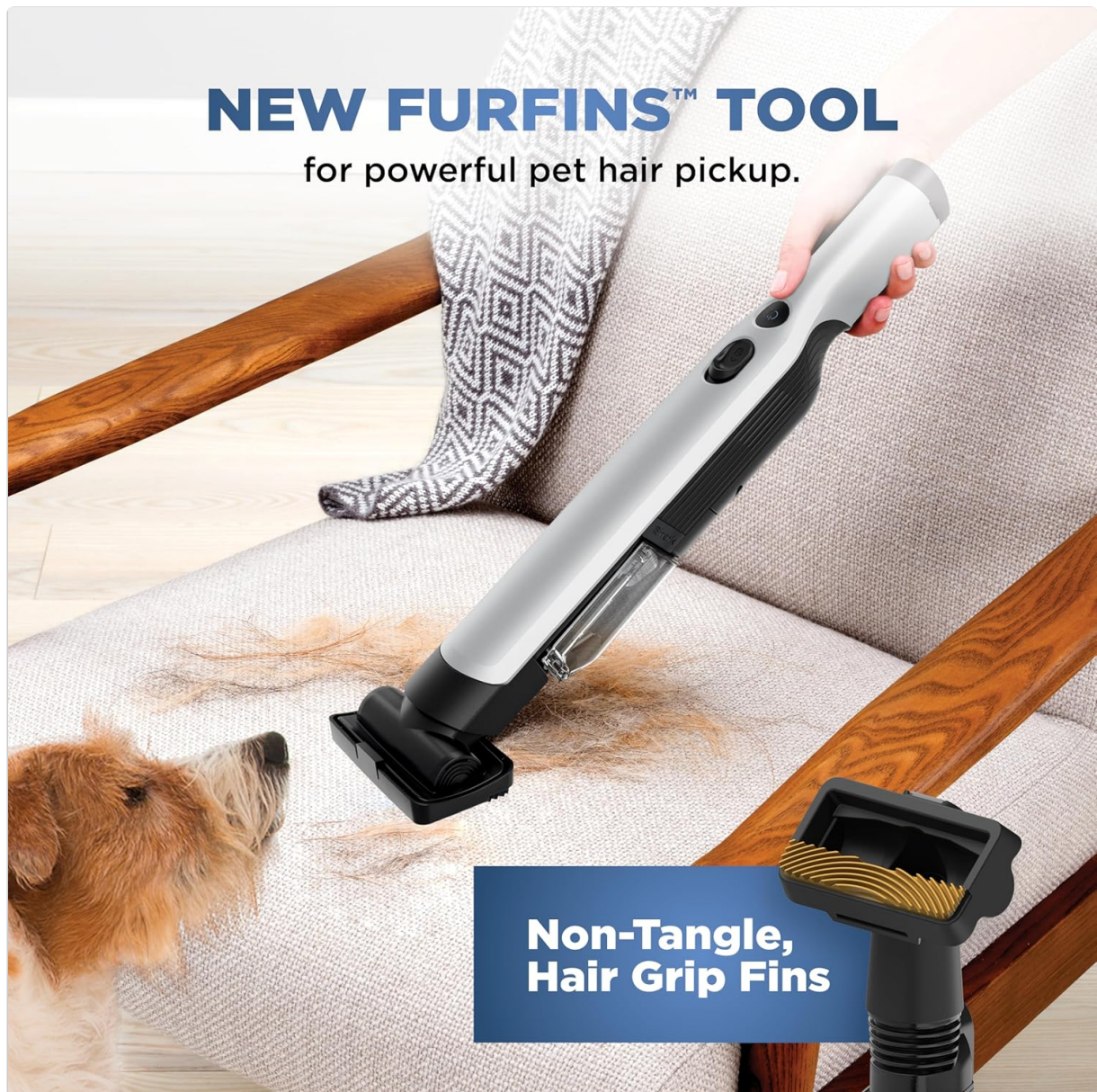
Image: The Shark WANDVAC with the FurFins tool effectively removing pet hair from a fabric chair.