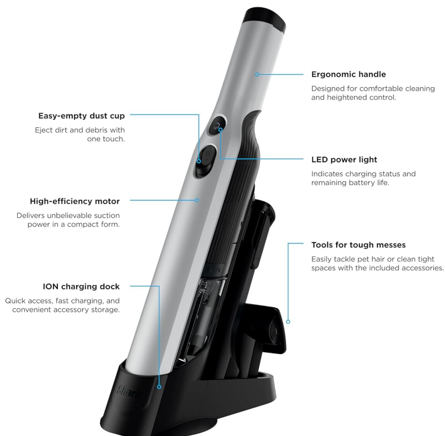
Image: All components of the Shark WANDVAC system, including the main vacuum unit, charging dock, crevice tool, and FurFins tool.