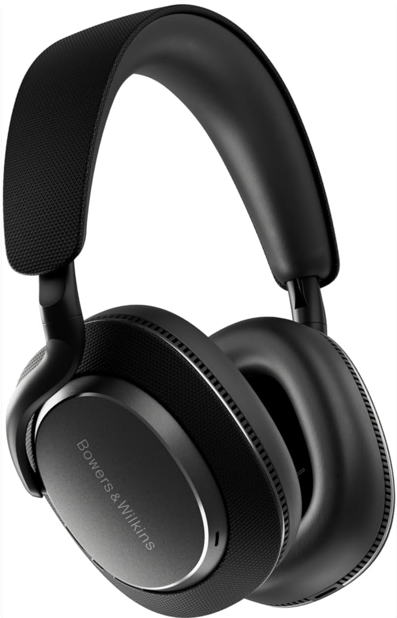
Figure 1 : Bowers & Wilkins Px7 S3 Over-Ear Headphones in Anthracite Black.