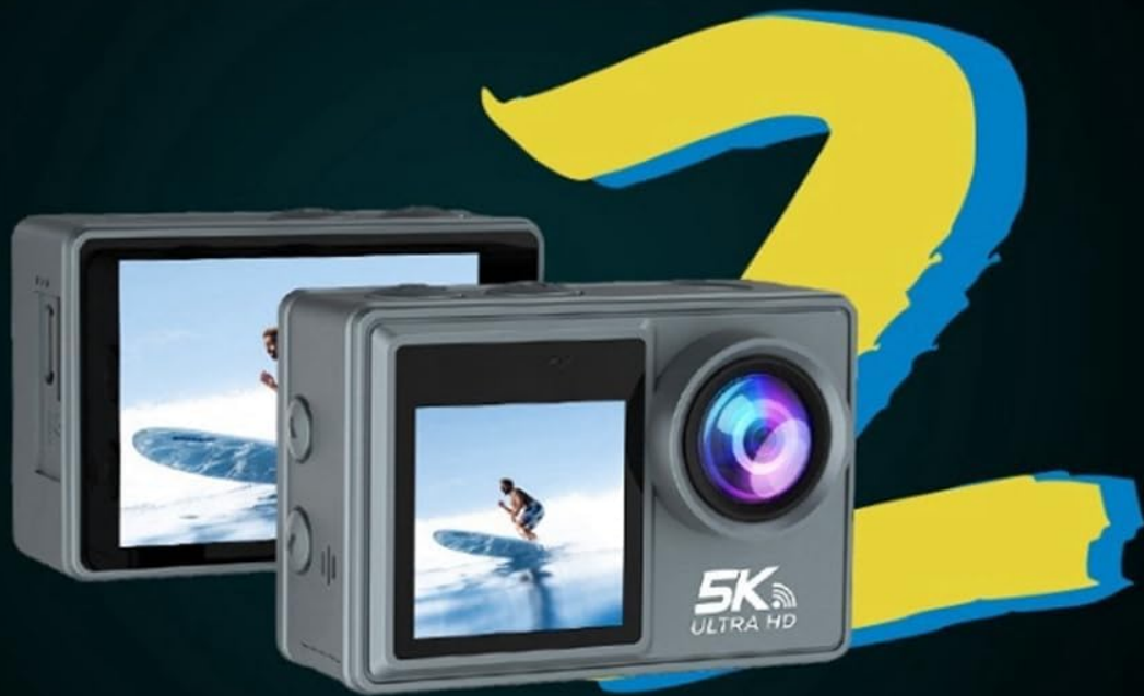
Image 6.3: Depicts the dual-screen design, showcasing both the main rear screen and the smaller front screen for versatile viewing and framing.

A new front screen is added to the traditional rear screen, providing a live preview for selfies, so you can take selfies with ease