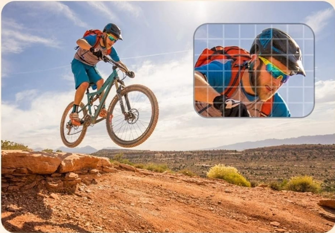
Image 6.1: Demonstrates the 5K/30fps 170° ultra-wide angle capability of the camera, capturing a broad scene with high detail.

5K ultra-high definition picture quality, ultra-high frame rate, making dynamic moments more fluid, and an ultra-wide field of view creating a strong sense of spatial depth, making the picture more eye-catching