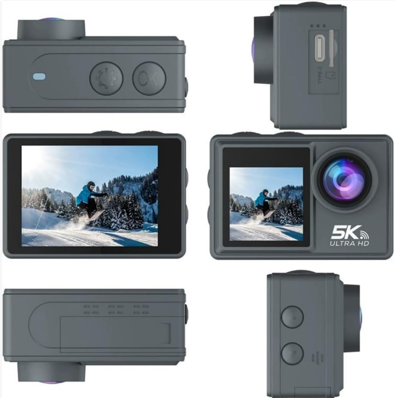
Image 4.1: Various angles of the WACLA M40TR Action Camera. This image displays the camera from the top, right side, front, back (with main screen), left side (with ports), and bottom, highlighting its compact design and button placement.

Familiarize yourself with the camera's physical components and controls.