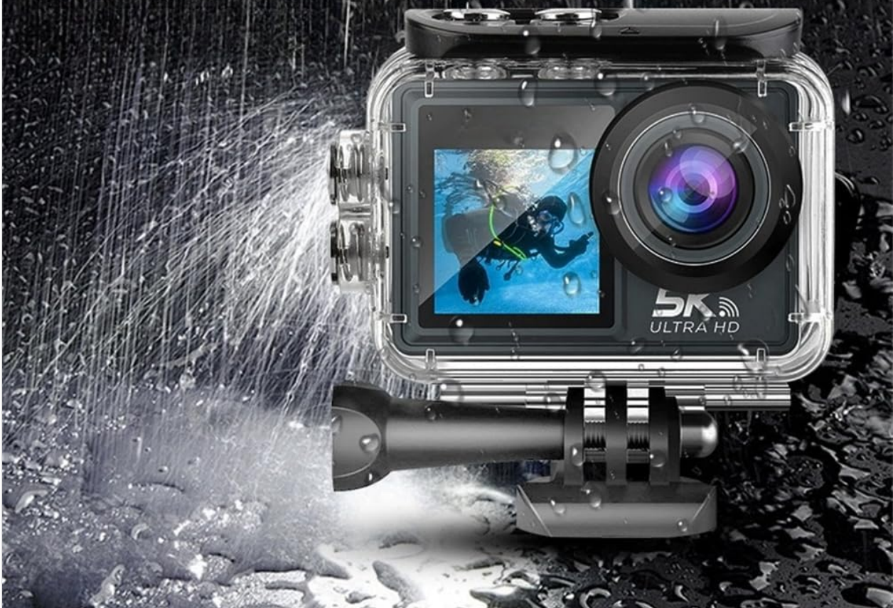
Image 6.6: The WACLA M40TR Action Camera enclosed in its waterproof case, demonstrating its capability to withstand depths of up to 30 meters.

The body is sturdy, with a waterproof case that is waterproof to a depth of 30 meters, and supports operation with wet hands