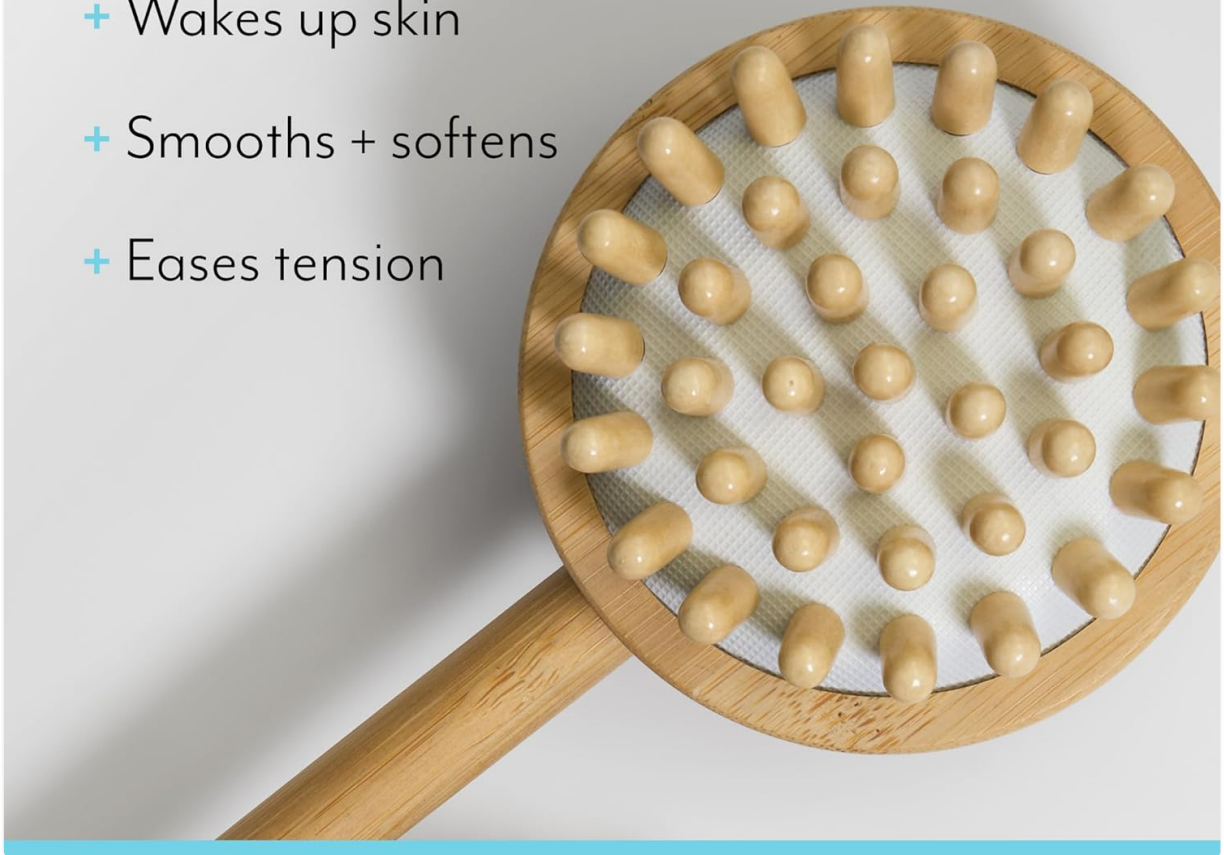
Image: The Bliss 2-in-1 Wooden Shower Brush, showcasing its long handle and dual-sided head.