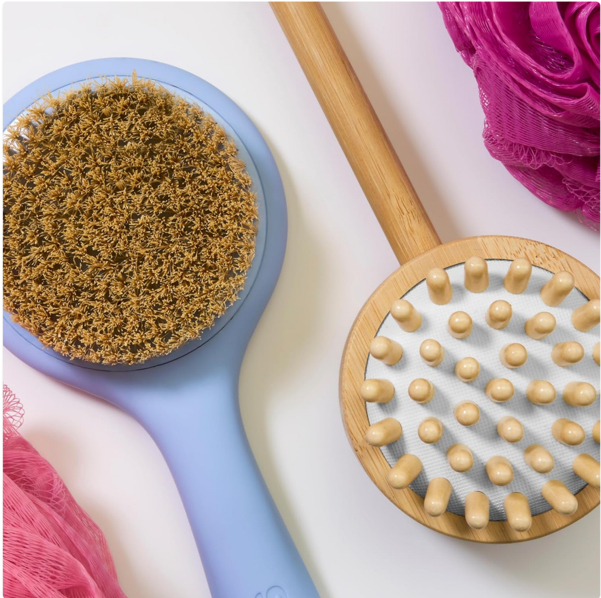
Image: A detailed view of the brush head, highlighting the two distinct surfaces for exfoliation and massage.