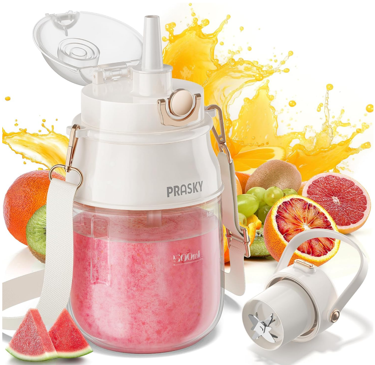
Image: The Prasky Portable Blender, showing the main unit, blending cup, lid, and the detachable blade assembly. Various fruits are depicted around it, suggesting its use for smoothies and juices.