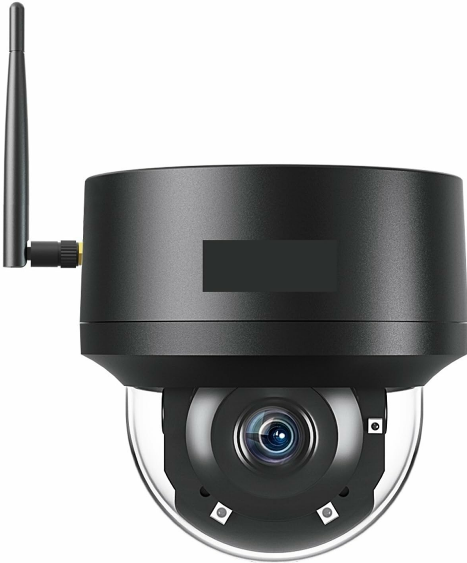
Image: The TWSYOXPR WiFi PTZ Security Camera mounted on a ceiling, illustrating its wide pan and tilt range for comprehensive coverage.

4. Adjust the camera's orientation as needed.