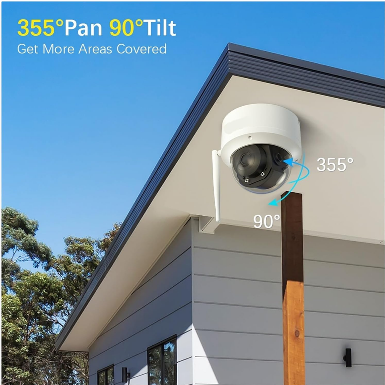
Image: The camera's pan and tilt capabilities, demonstrating its ability to cover a wide area with 355° horizontal and 90° vertical movement.

Utilize the mobile application to remotely control the camera's movement. The camera supports 360° horizontal rotation (pan) and approximately 90° vertical tilt, allowing you to adjust the viewing angle as needed.