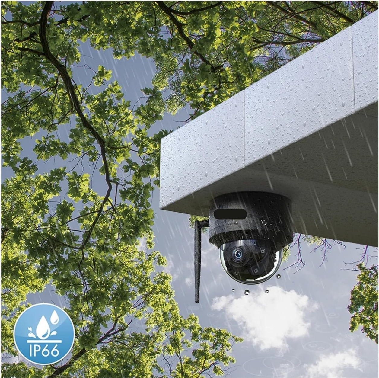
Image: The camera's IP66 weather resistance, indicating its durability against environmental elements.