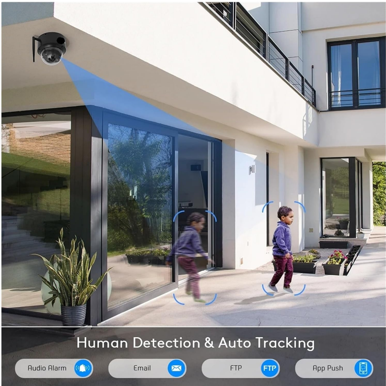
Image: The camera's human detection and auto-tracking feature in action, following a person's movement.