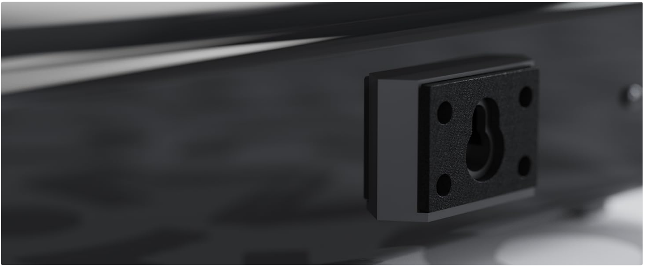
Image: Close-up of the wall mount bracket for the Oakcastle SB40 Soundbar.