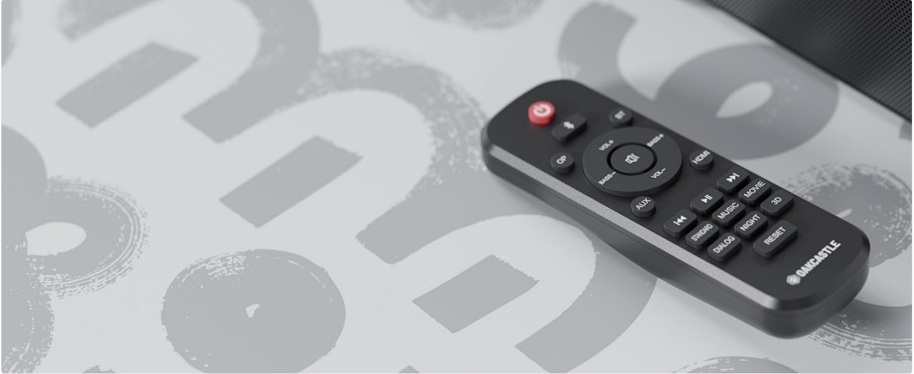
Image: The Oakcastle SB40 Soundbar remote control with various function buttons.

The included remote control provides full functionality for your soundbar.