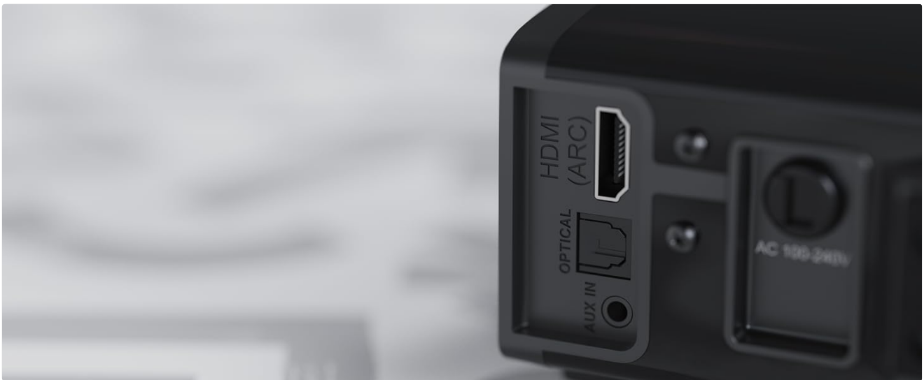
Image: Close-up of the Oakcastle SB40 Soundbar's rear panel showing HDMI ARC, Optical, and AUX input ports.