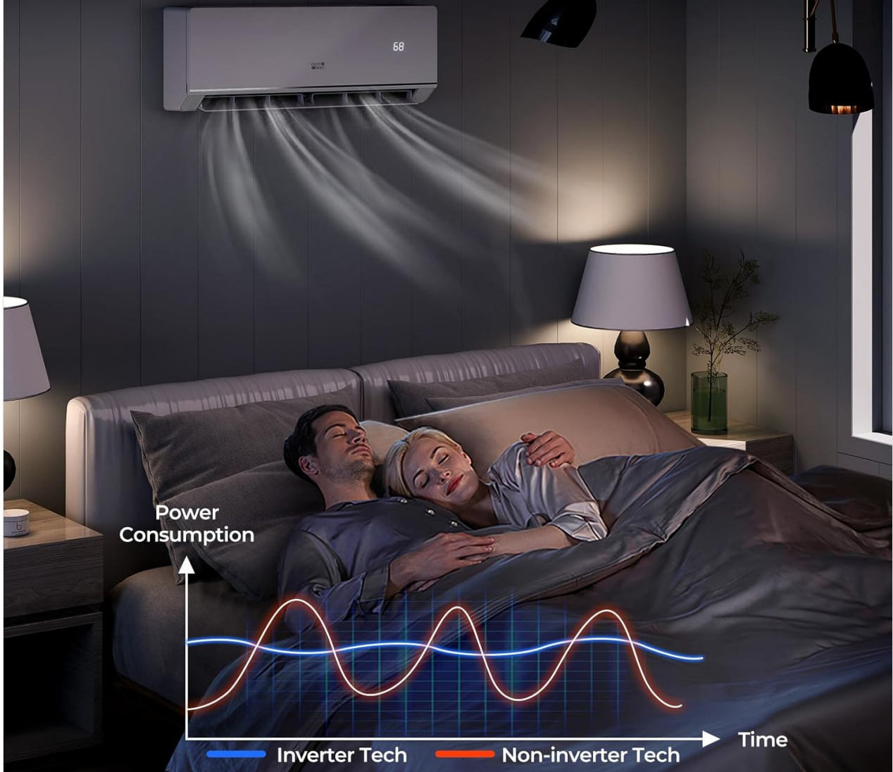
Figure 1.1: Inverter Technology Benefits - Stable, Silent, Efficient Operation.