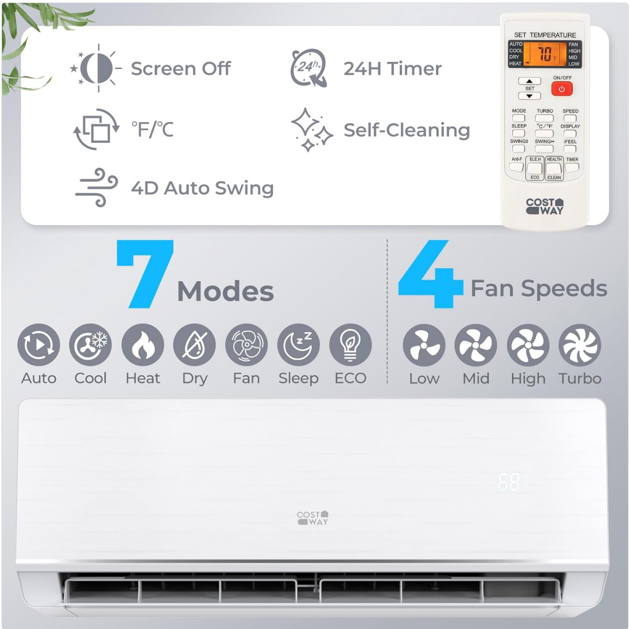
Figure 5.1: Operating Modes, Fan Speeds, and Key Features.