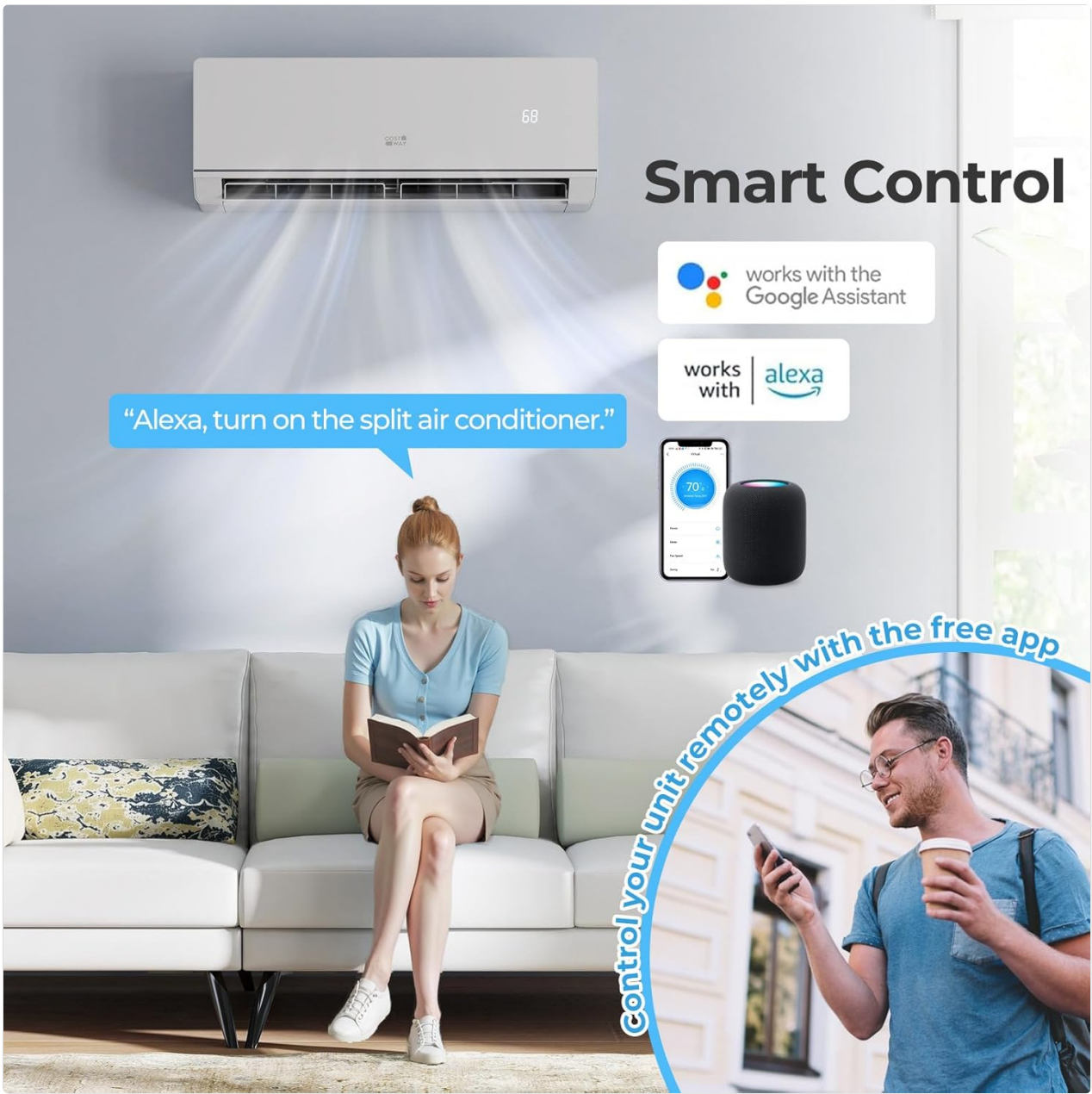
Figure 5.2: Smart Control via App and Alexa.