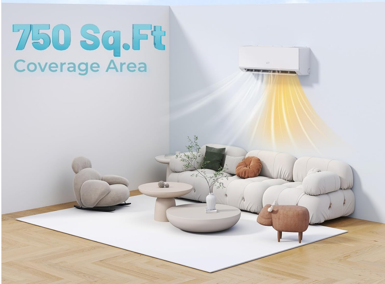
Figure 5.3: Fast Cooling & Heating with Wide Coverage.