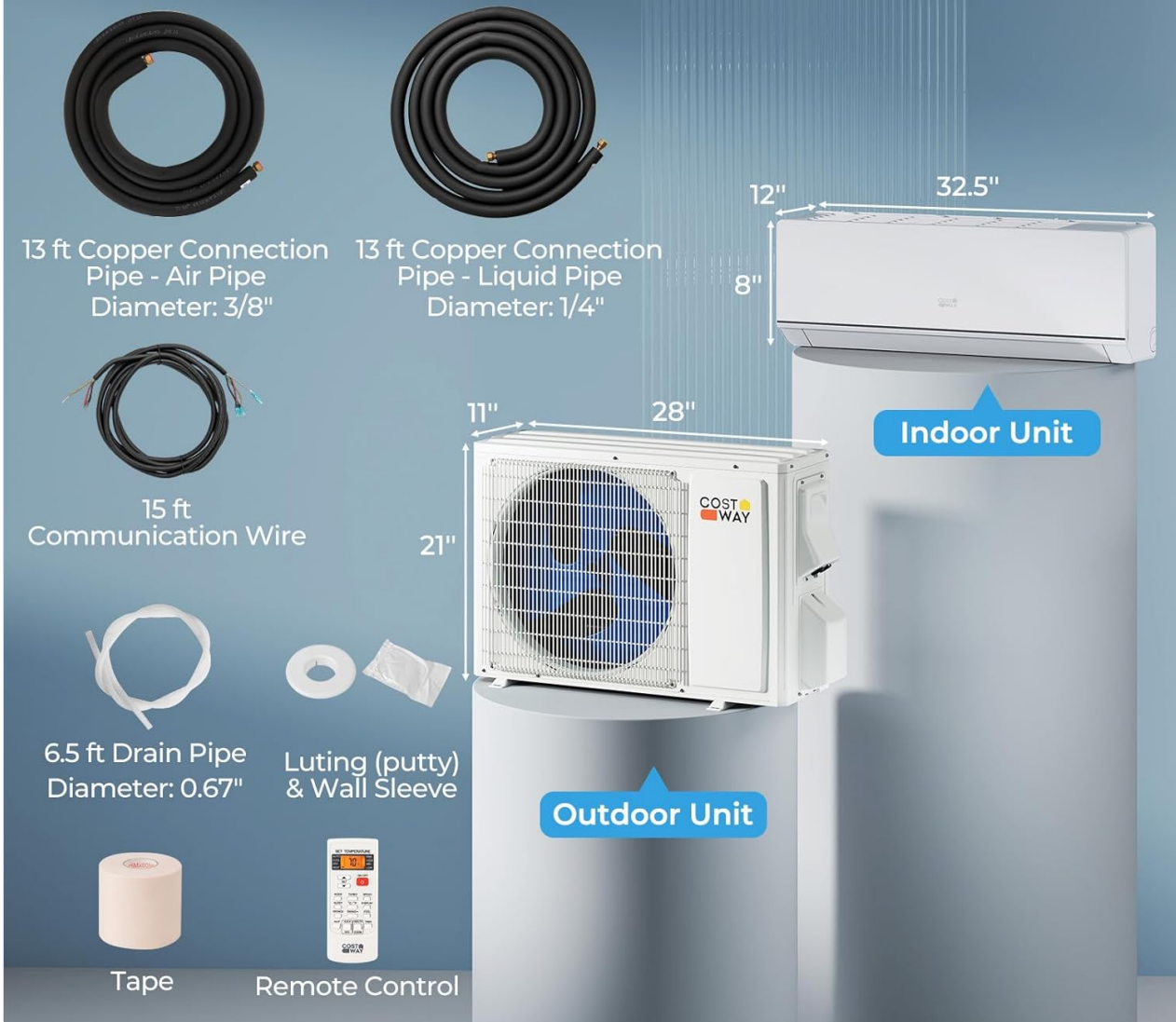
Figure 3.1: Included Components and Dimensions.

Note: the installation should be done only by professionals.