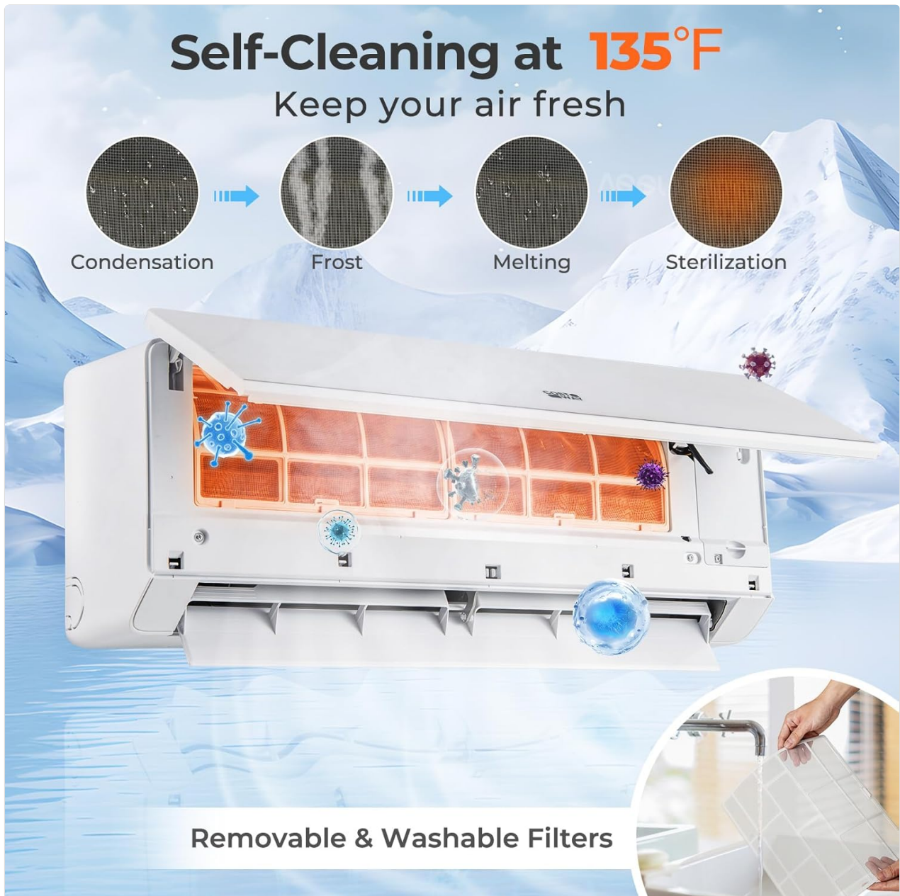
Figure 6.1: Self-Cleaning Process and Removable/Washable Filters.