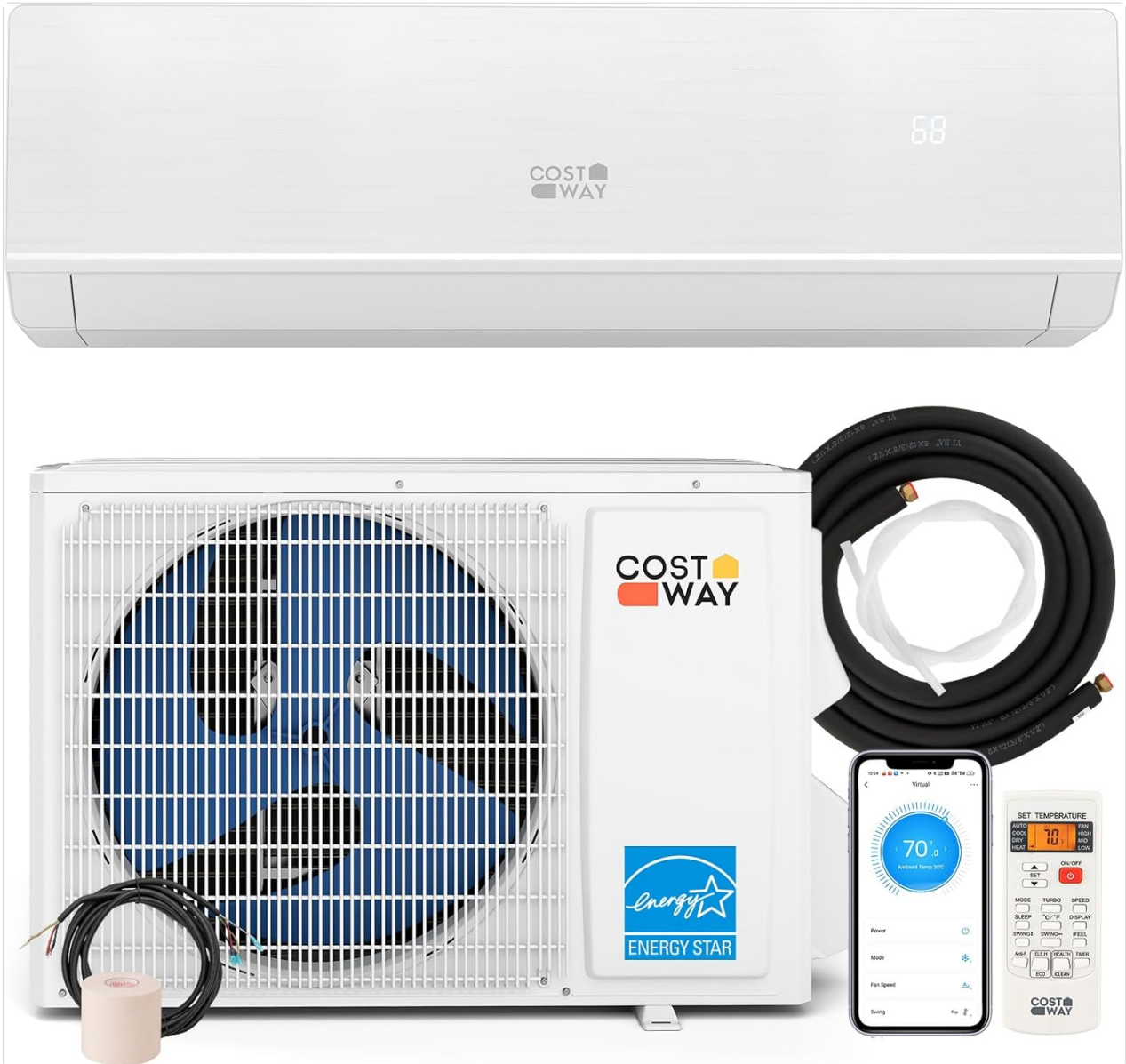
Figure 4.1: Overview of Indoor and Outdoor Units with Installation Components.