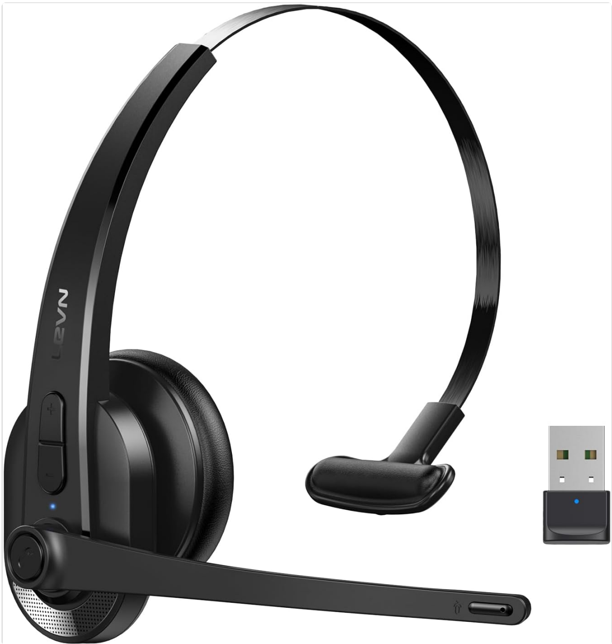
Image: Front view of the LEVN LE011 Wireless Headset, showcasing its single-ear design and adjustable microphone.