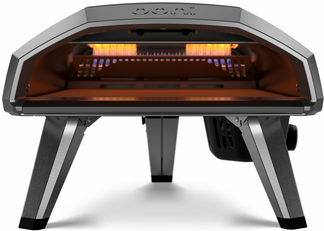
Image: The Ooni Koda 2 Propane Gas Pizza Oven, a compact and portable outdoor unit, shown in Foundry Black.