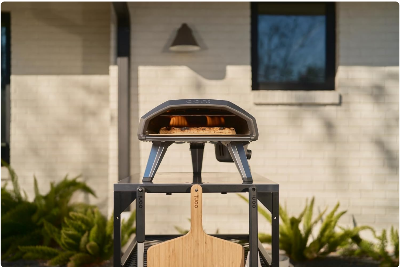
Image: A pizza cooking inside the Ooni Koda 2 oven, showing the flames at the rear and the pizza stone.