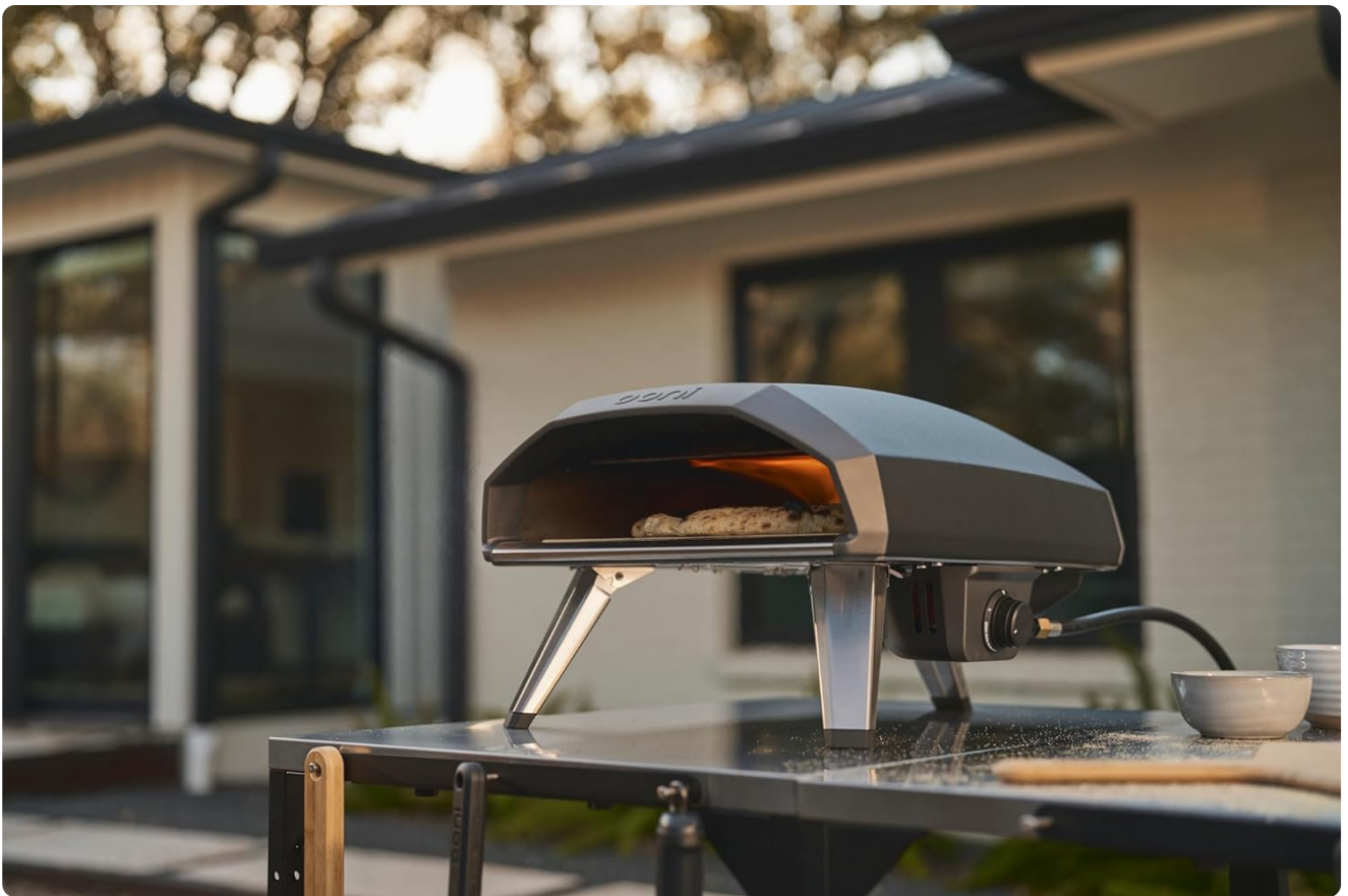
Image: The Ooni Koda 2 oven is shown preheating, with the internal flames visible, indicating it's reaching optimal cooking temperature.