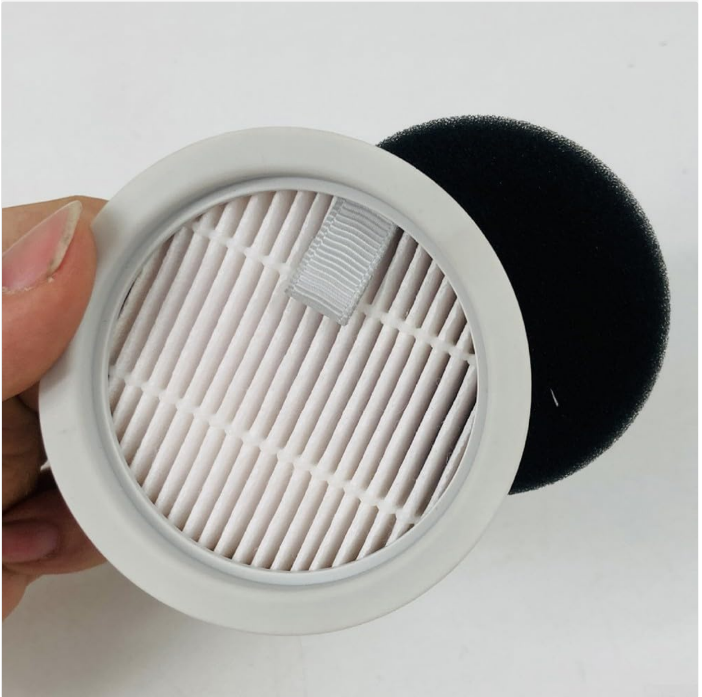
Figure 2: A single JurwheeR Replacement HEPA Filter set, ready for installation.

5. Close Compartment: Close the filter compartment securely. Ensure all latches or covers are properly fastened to prevent air leaks.