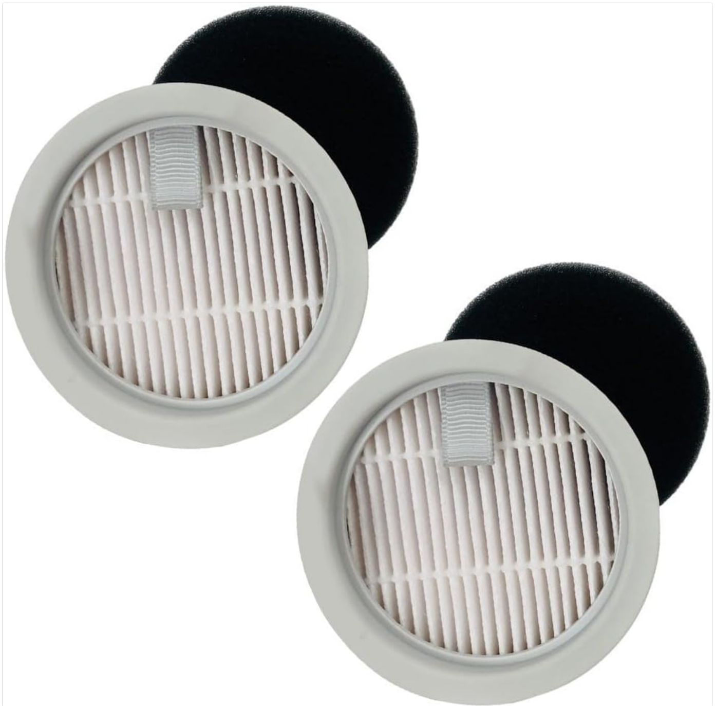
Figure 1: Two JurwheeR Replacement HEPA Filter sets, showing the pleated filter and foam disc components.