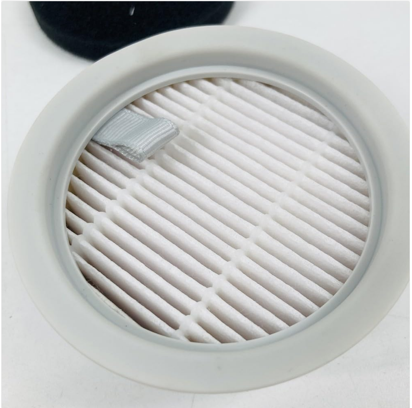
Figure 3: Close-up of the pleated HEPA filter element.