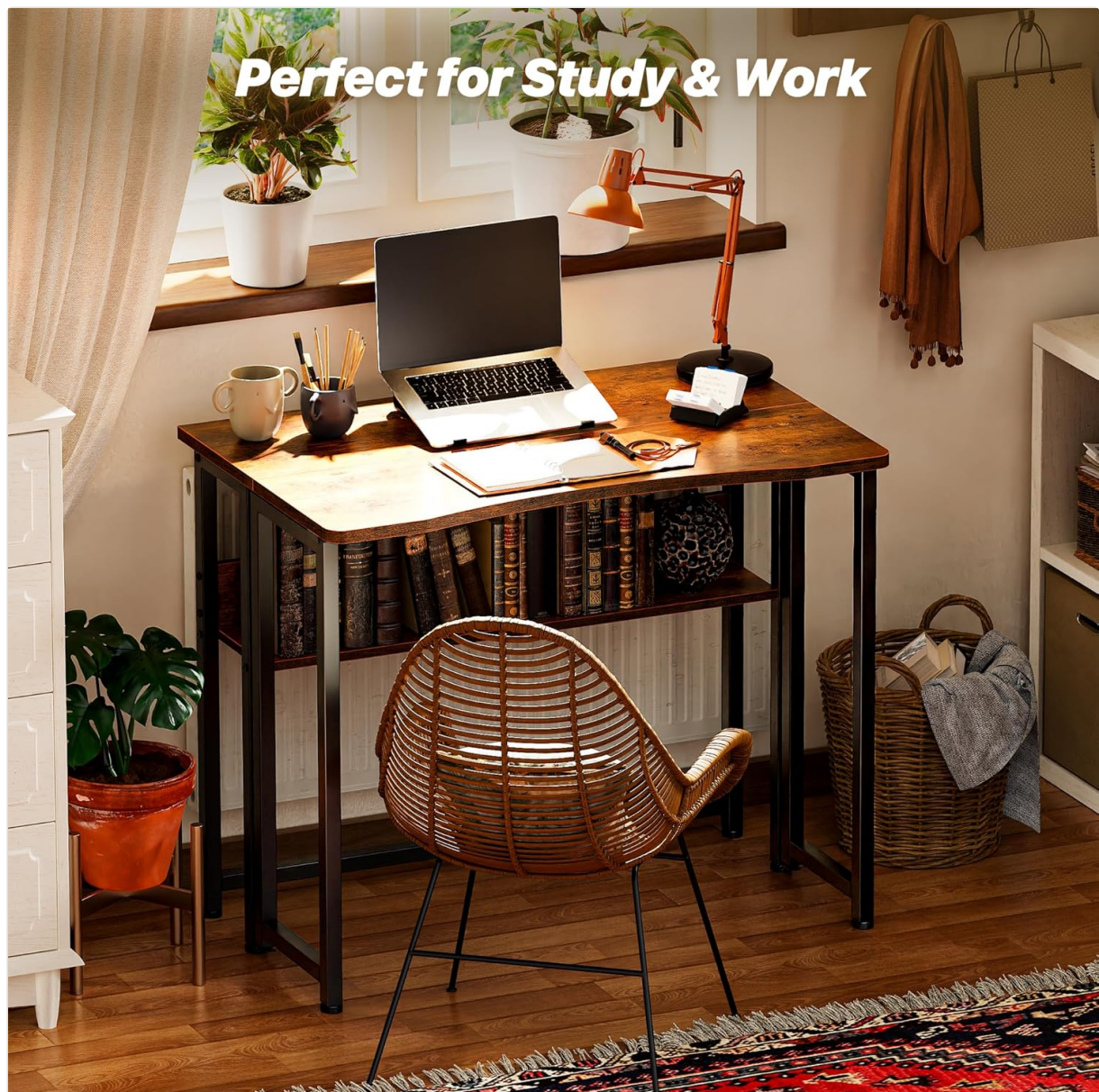
Image: The Huuger Folding Desk showcasing its lower storage shelf filled with books and a decorative basket.

The integrated storage shelf provides convenient space for books, office supplies, or decorative items. Ensure items placed on the shelf do not exceed its weight capacity and are removed before folding the desk.