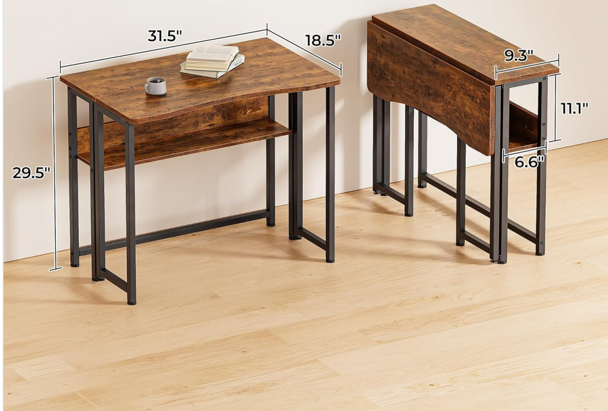
Image: Diagram illustrating the dimensions of the Huuger Folding Desk when fully open (31.5"W x 18.5"D x 29.5"H) and when folded (9.3" thick).