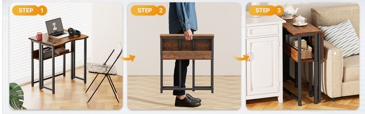
Image: Illustration of the desk's folding mechanism, demonstrating how it can be converted into a compact sofa table for storage.