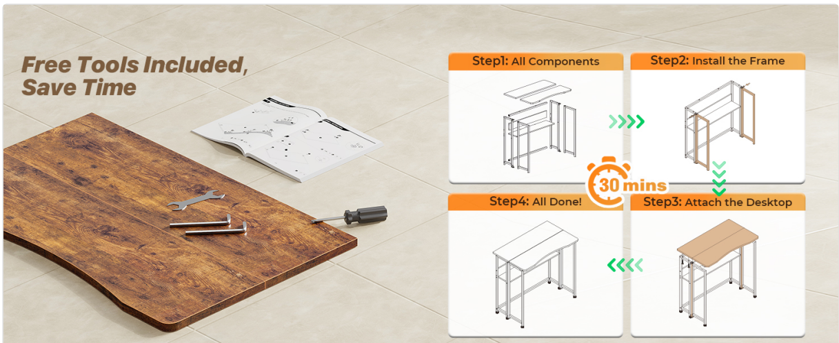
Image: A detailed diagram illustrating the four main assembly steps, including all components and tools required.