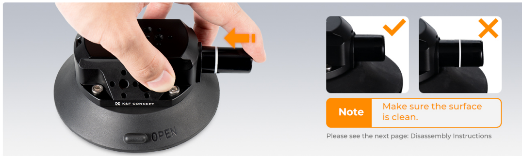
Image description: A hand pressing the pump button on the K&F CONCEPT suction cup, with an inset showing the warning line disappearing when properly sealed, indicating readiness for use.

Press the Pump repeatedly until the safety warning line disappears