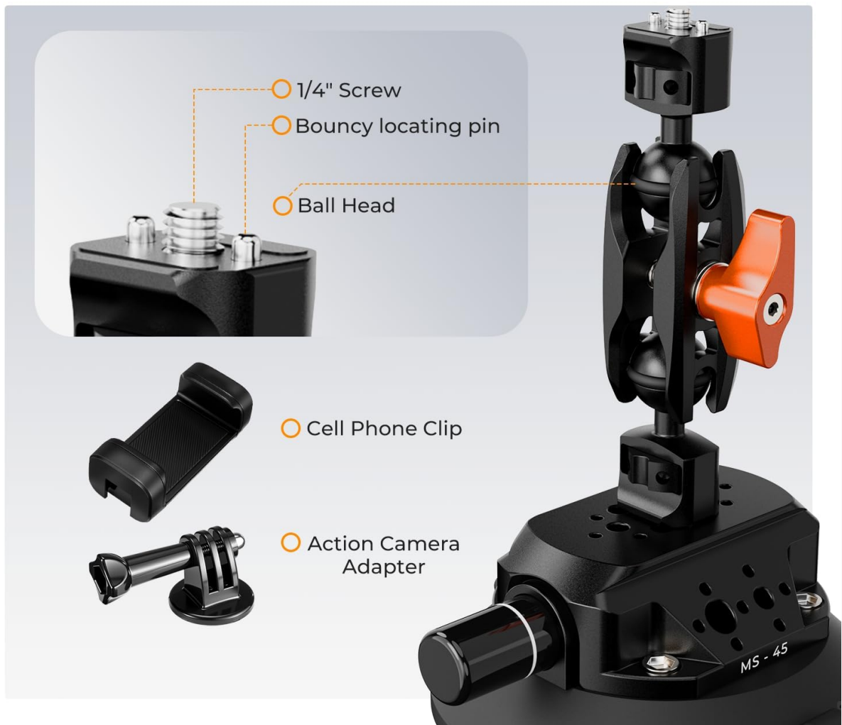
Image description: A close-up of the 360° universal ball head on the K&F CONCEPT magic arm, illustrating its components and how a cell phone clip or action camera adapter can be attached for flexible positioning.