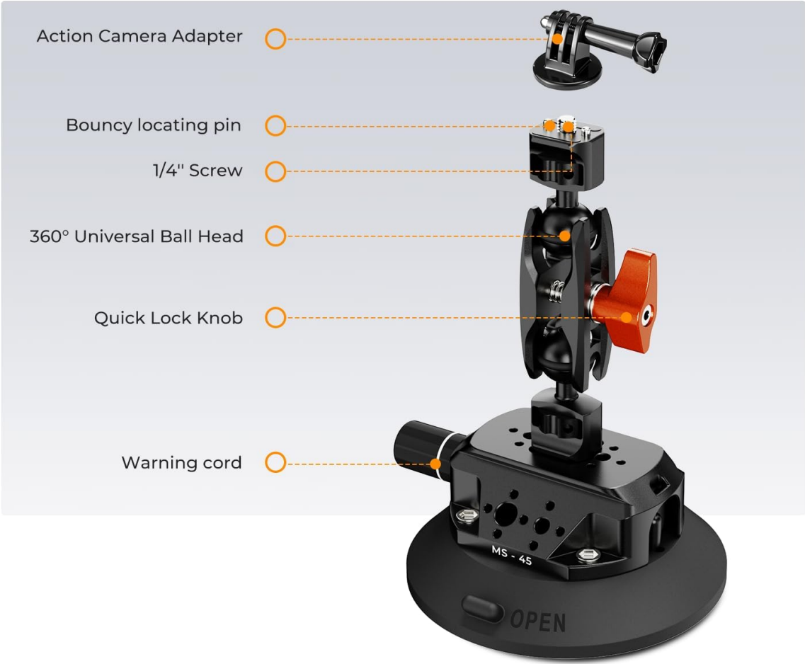
Image description: An exploded view diagram of the K&F CONCEPT suction cup mount, highlighting the action camera adapter, 1/4" screw, 360° universal ball head, quick lock knob, and warning cord.