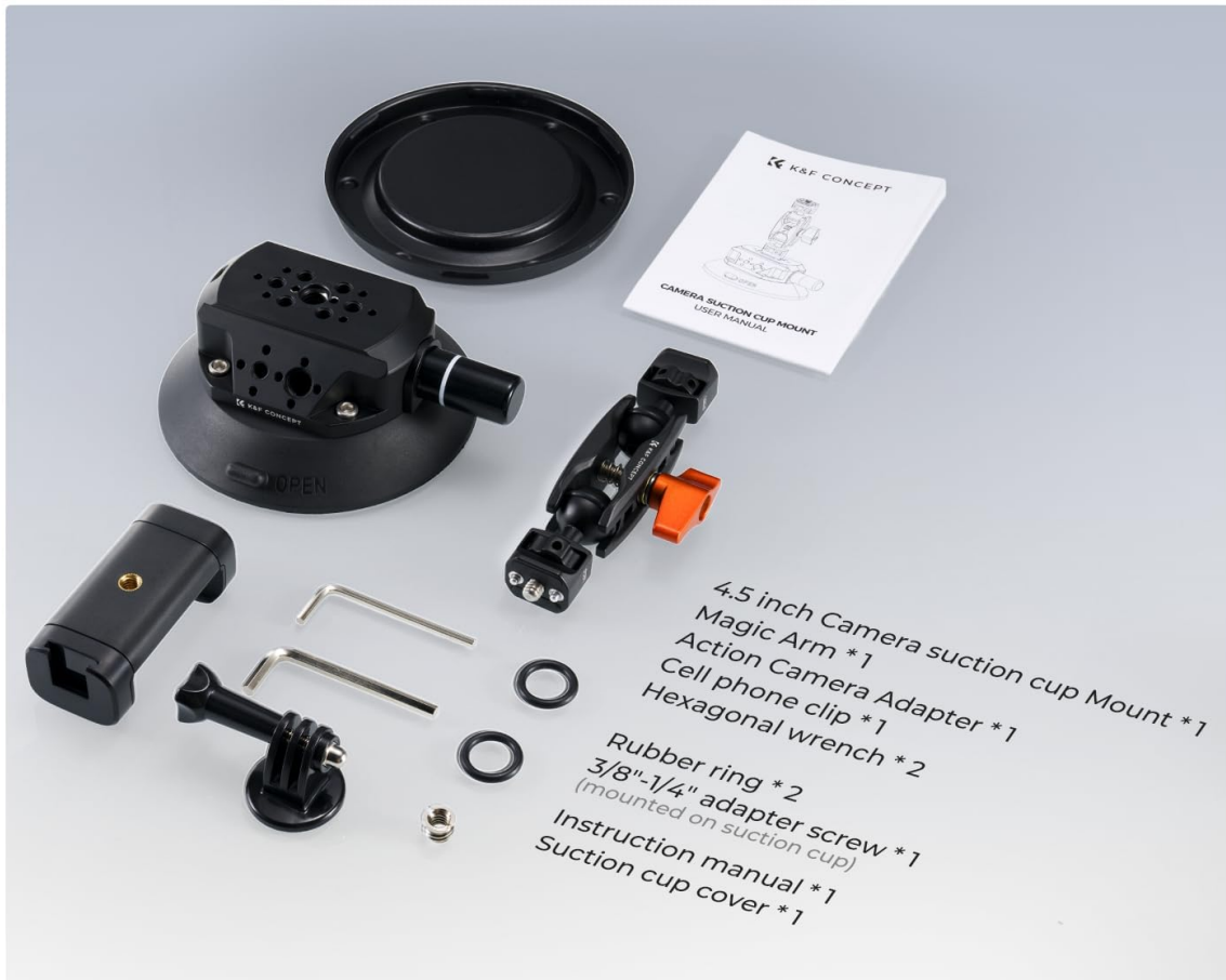
Image description: A flat lay of all components included in the K&F CONCEPT suction cup camera mount package, neatly arranged with the instruction manual.