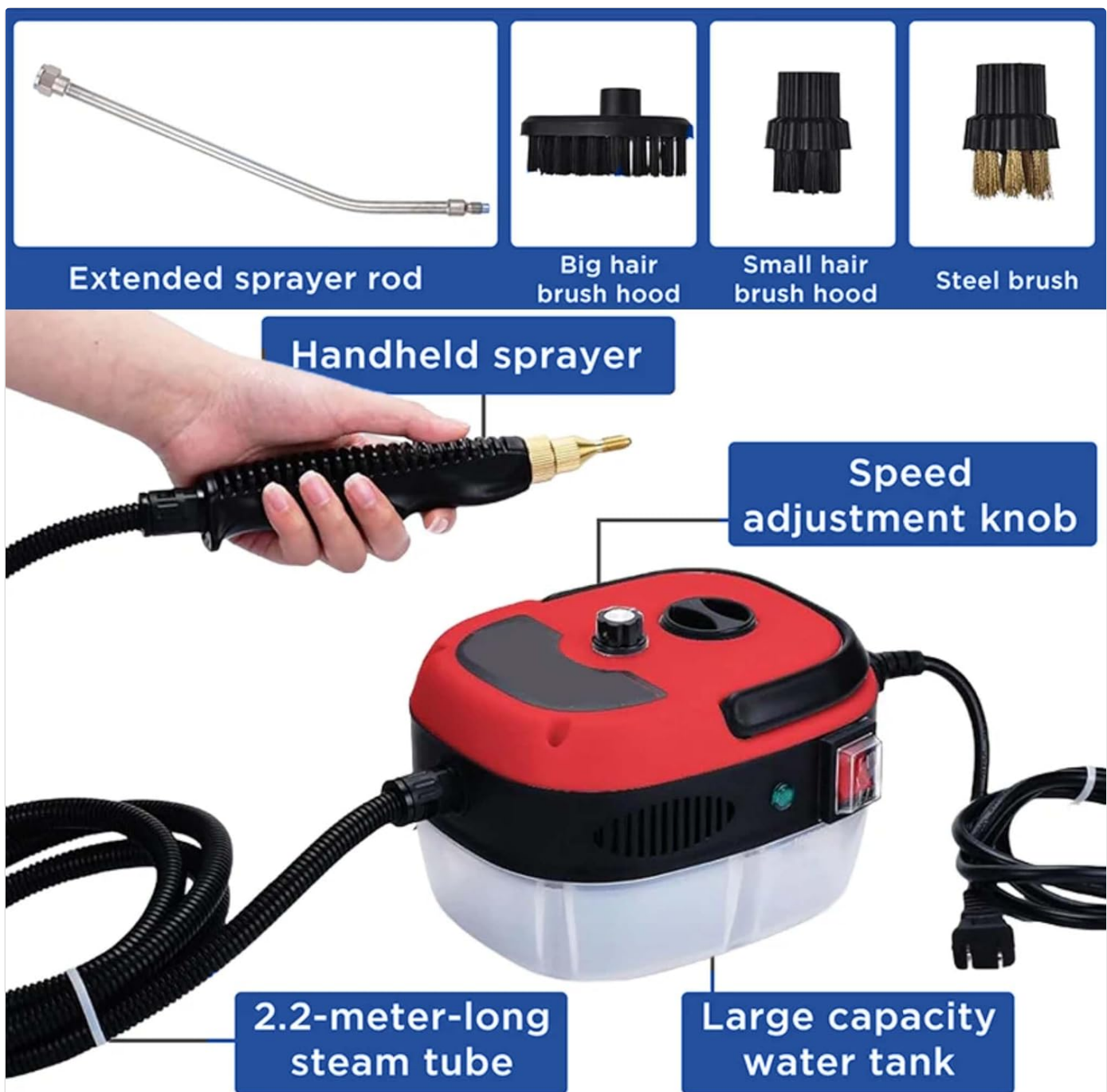
Image: Overview of the RAINPOT Handheld Steam Cleaner, showing the main unit, handheld sprayer, extended sprayer rod, speed adjustment knob, 2.2-meter-long steam tube, and large capacity water tank. Also visible are various brush heads: big hair brush hood, small hair brush hood, and steel brush.