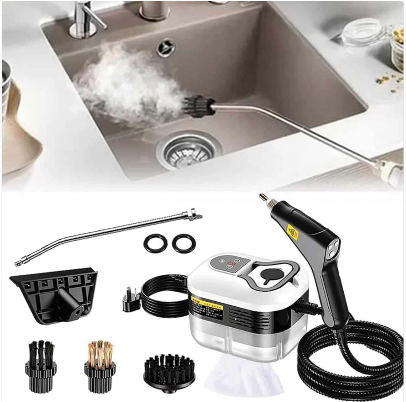
Image: The RAINPOT Handheld Steam Cleaner main unit and various accessories, including the handheld sprayer, extended nozzle, and different brush heads. This image illustrates the complete set of components.

Unscrew the water tank cap. Fill the large capacity glass water tank with clean, distilled, or demineralized water. Do not overfill. Securely close the cap.