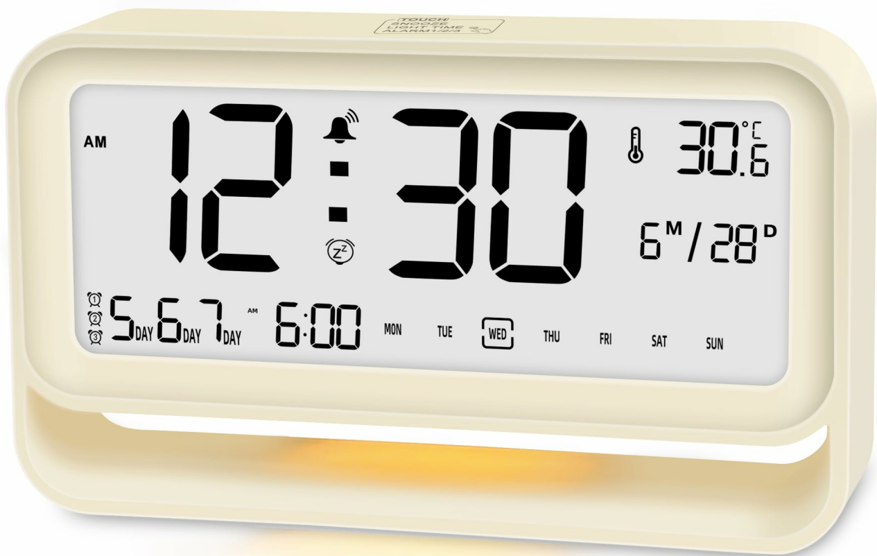
Image 1.1: Ayybboo Digital Alarm Clock with key features highlighted.