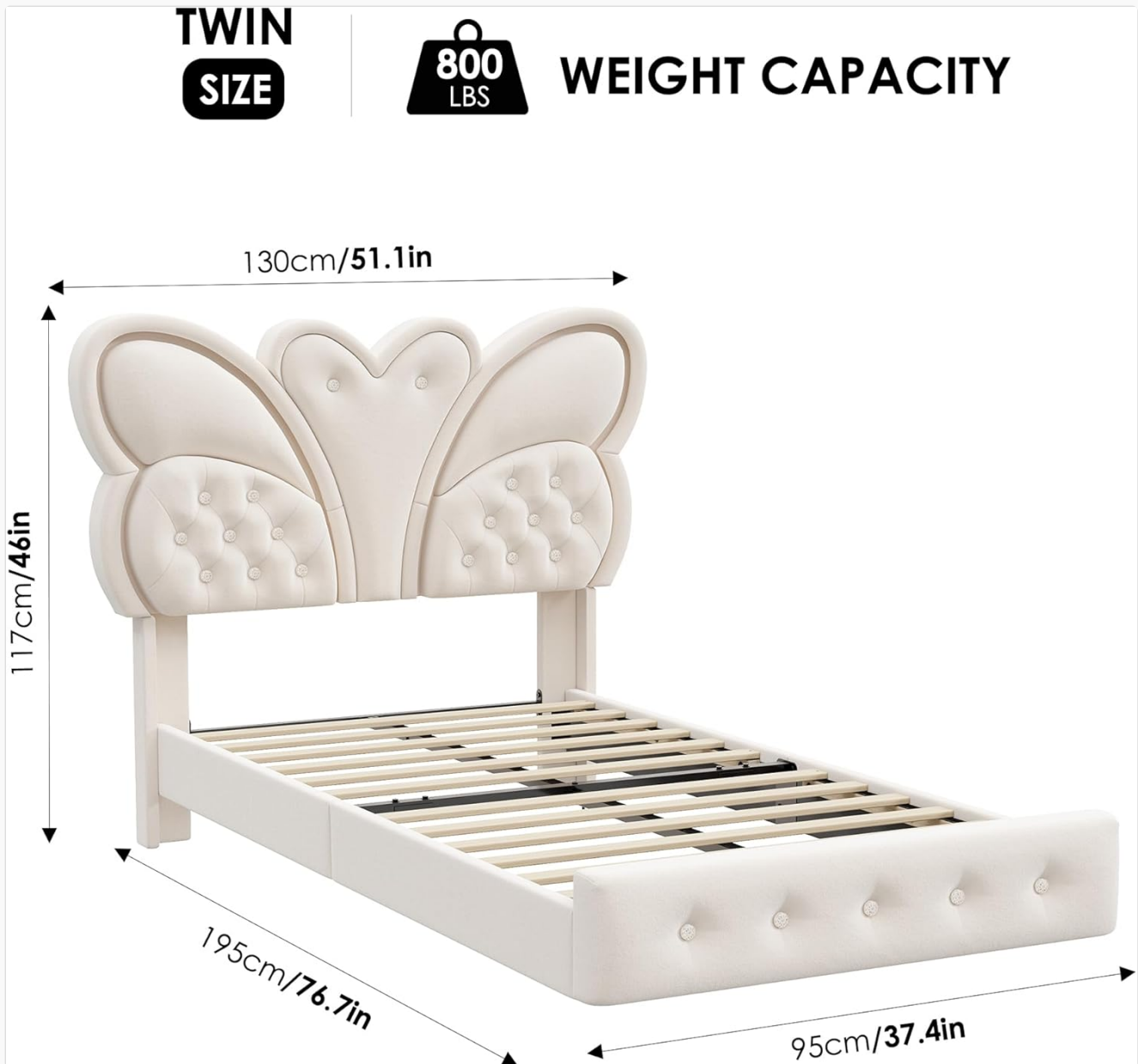
Image 2.1: Dimensions and Weight Capacity of the Twin Bed Frame. The bed measures 76.7 inches (195cm) in length, 51.1 inches (130cm) in width at the headboard, and 46 inches (117cm) in height. It has a weight capacity of 800 lbs.