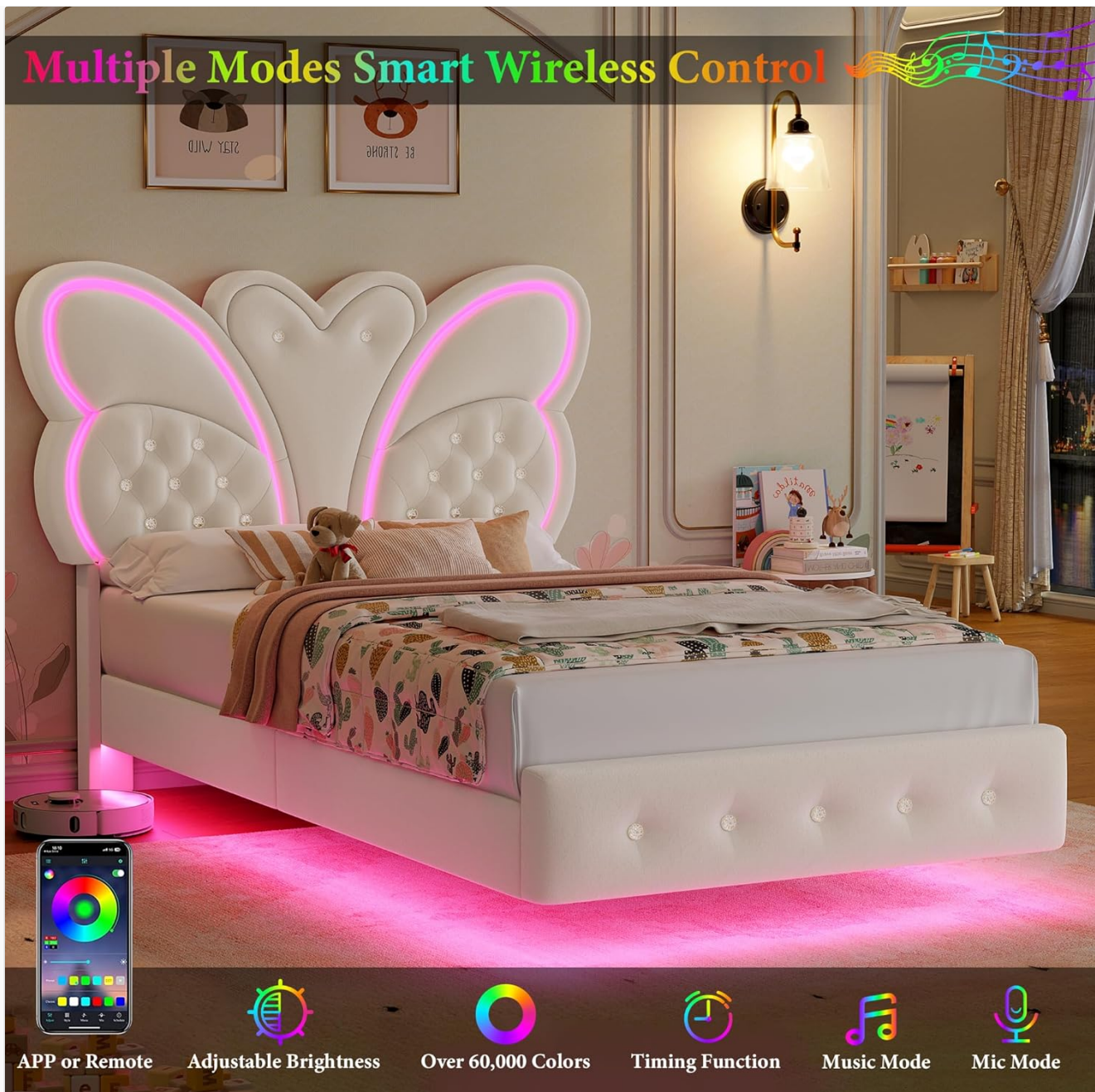
Image 4.1: LED Light Features. The integrated RGB LED lights offer multiple modes, smart wireless control via app or remote, adjustable brightness, a wide color spectrum, timing functions, and a music synchronization mode.