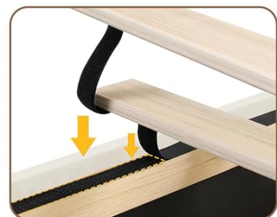
Easy to Assemble