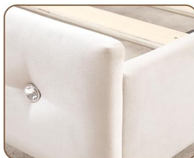
Footboard is Raised