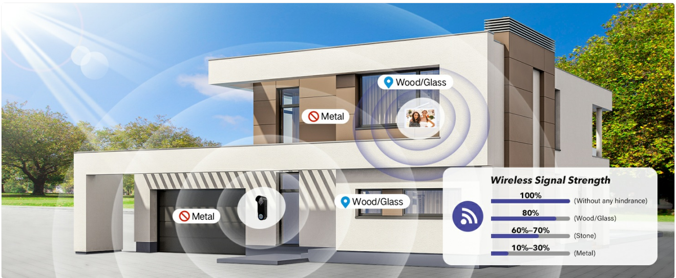
Figure 3: Wireless signal strength can be reduced by obstacles, especially metal. Optimal placement avoids metal obstructions.