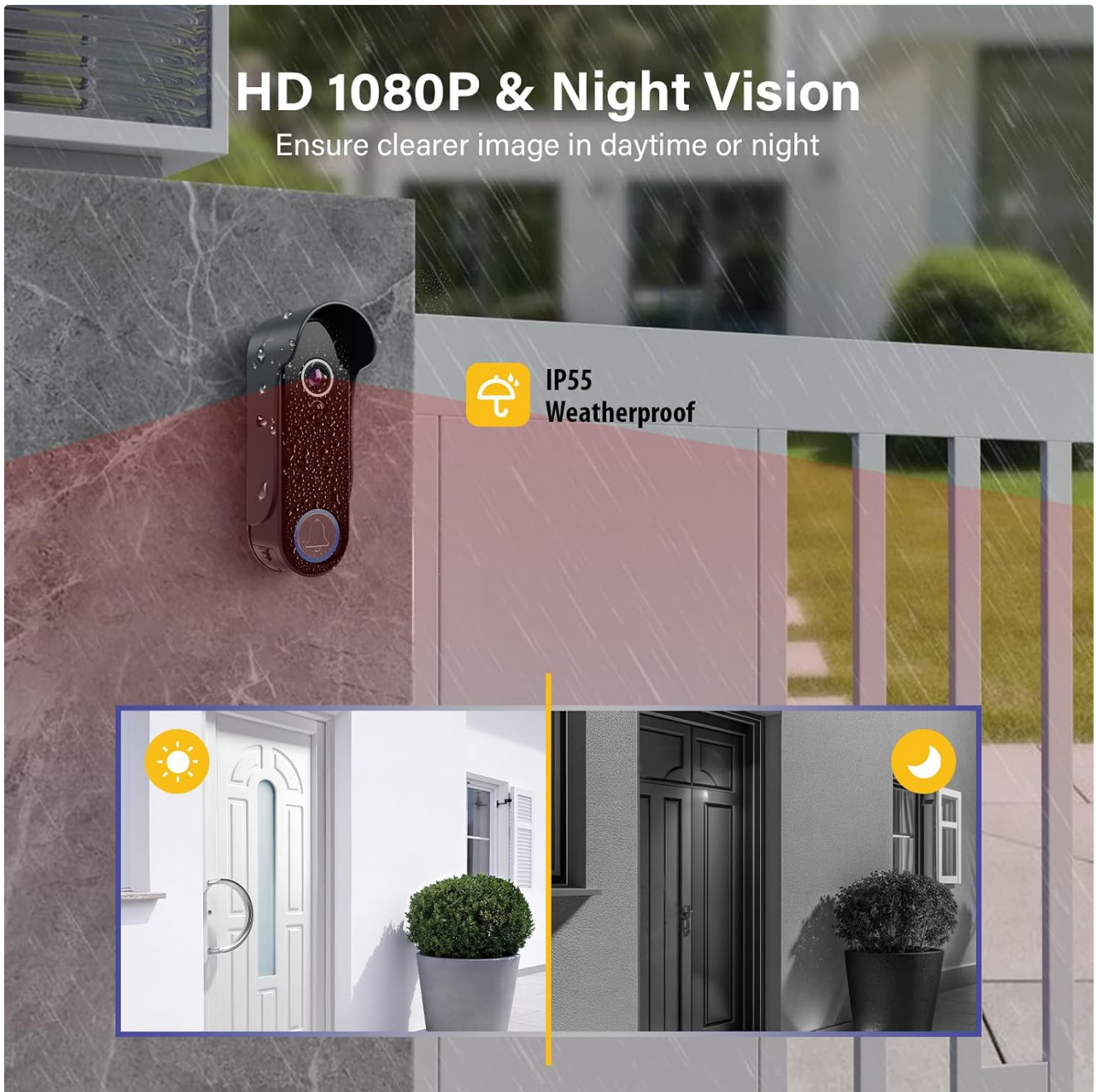
Figure 8: Day and night vision capabilities of the doorbell camera.