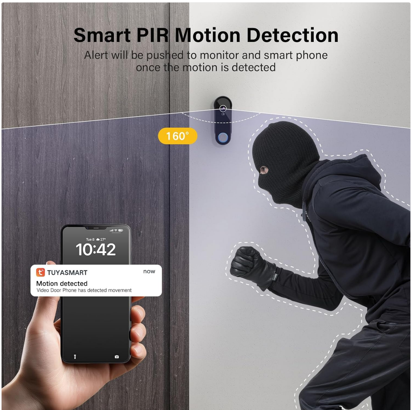
Figure 7: Motion detection system sending an alert to a smartphone when activity is detected.

Alert will be pushed to monitor and smart phone once the motion is detected