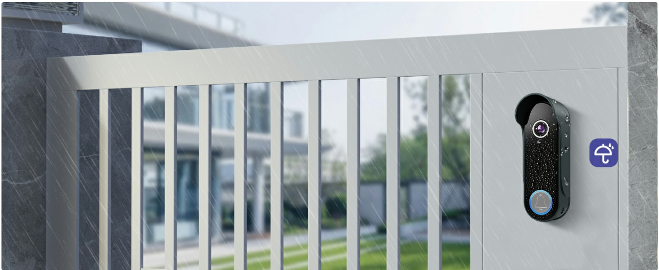
Figure 10: The doorbell camera is designed with IP55 weather resistance for outdoor use.