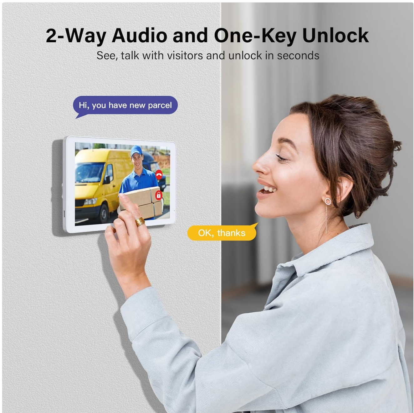
Figure 6: Demonstrating two-way audio communication with a visitor via the indoor monitor.

See, talk with visitors and unlock in seconds