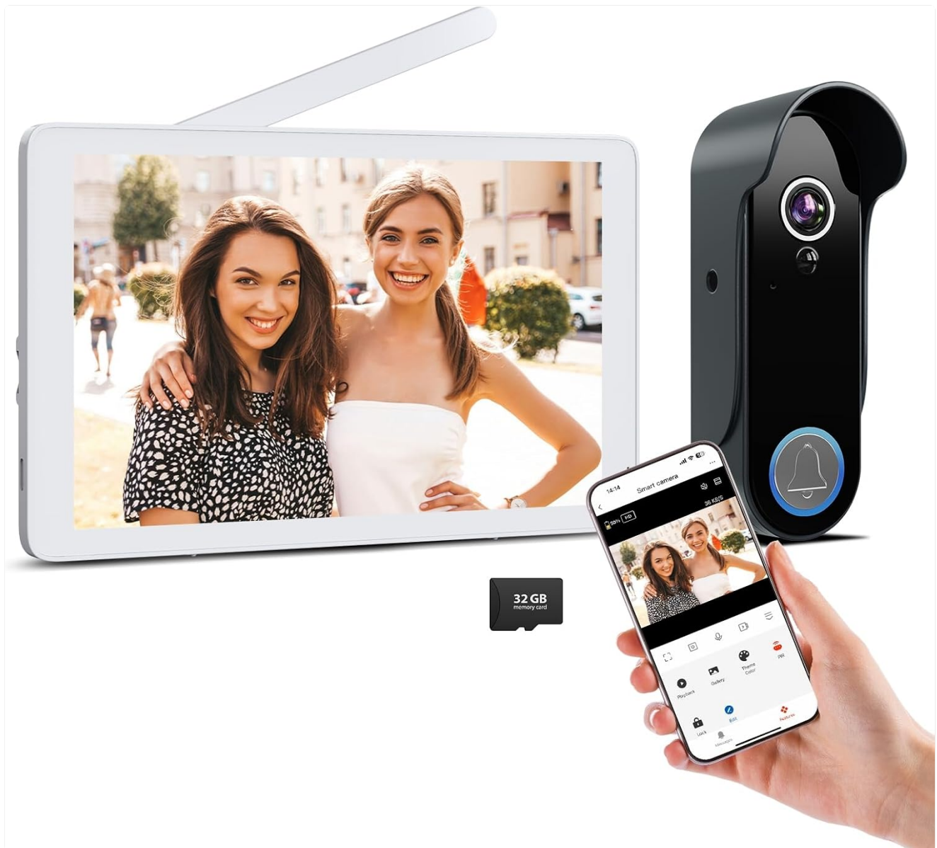
Figure 1: Bvavo Wireless Video Doorbell Intercom System components, including the doorbell unit, indoor monitor, and smartphone application interface.