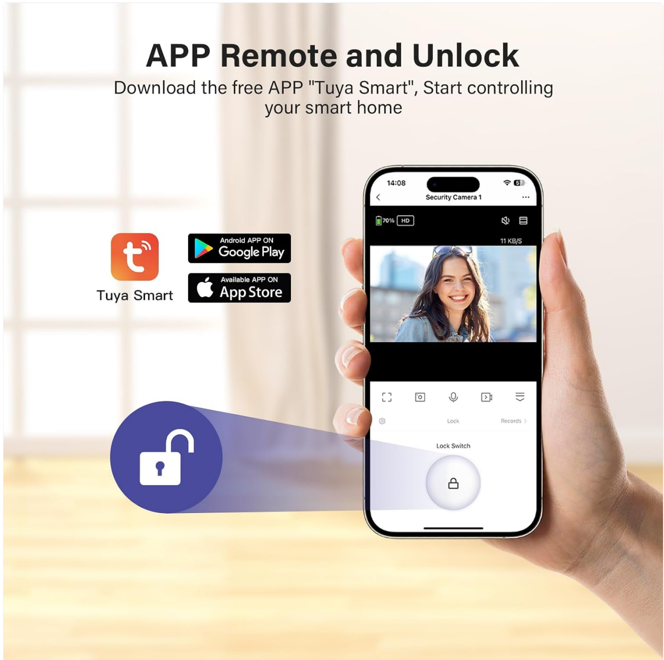
Figure 5: Tuya Smart App interface for remote control and monitoring.

For smartphone control and remote access, download the free Tuya Smart App from the App Store (iOS) or Google Play Store (Android). Follow the in-app instructions to add your Bvavo doorbell system.