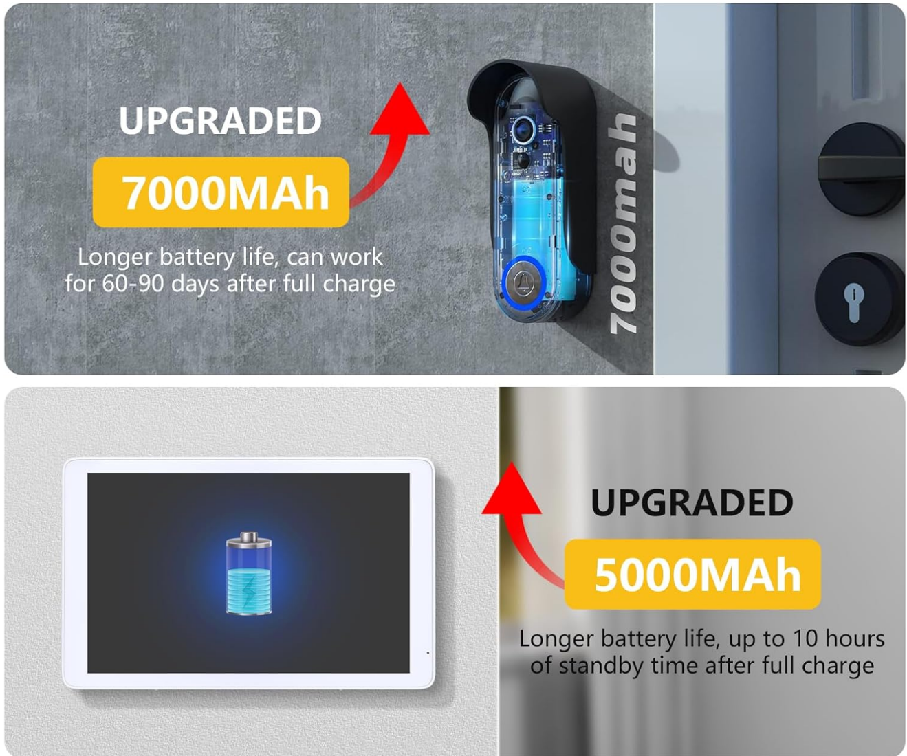
Figure 2: Battery specifications for the doorbell camera and indoor monitor.

Better to connect display with power adapter for stable use