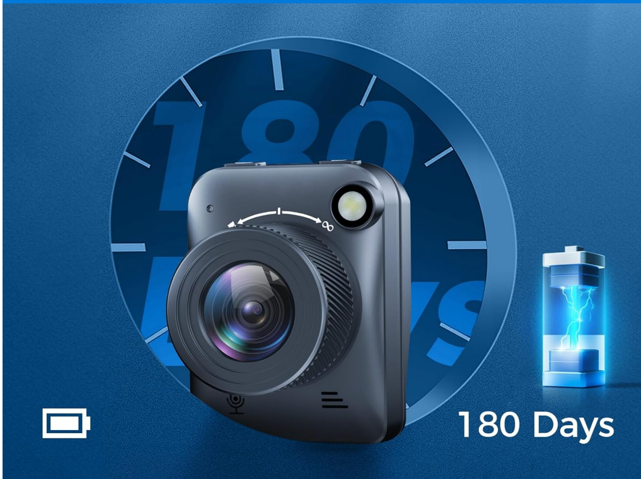
Image: The Dsoon TL3000 camera emphasizing its 180-day battery life.

Longer standby working time, don't worry about insufficient battery affecting shooting.