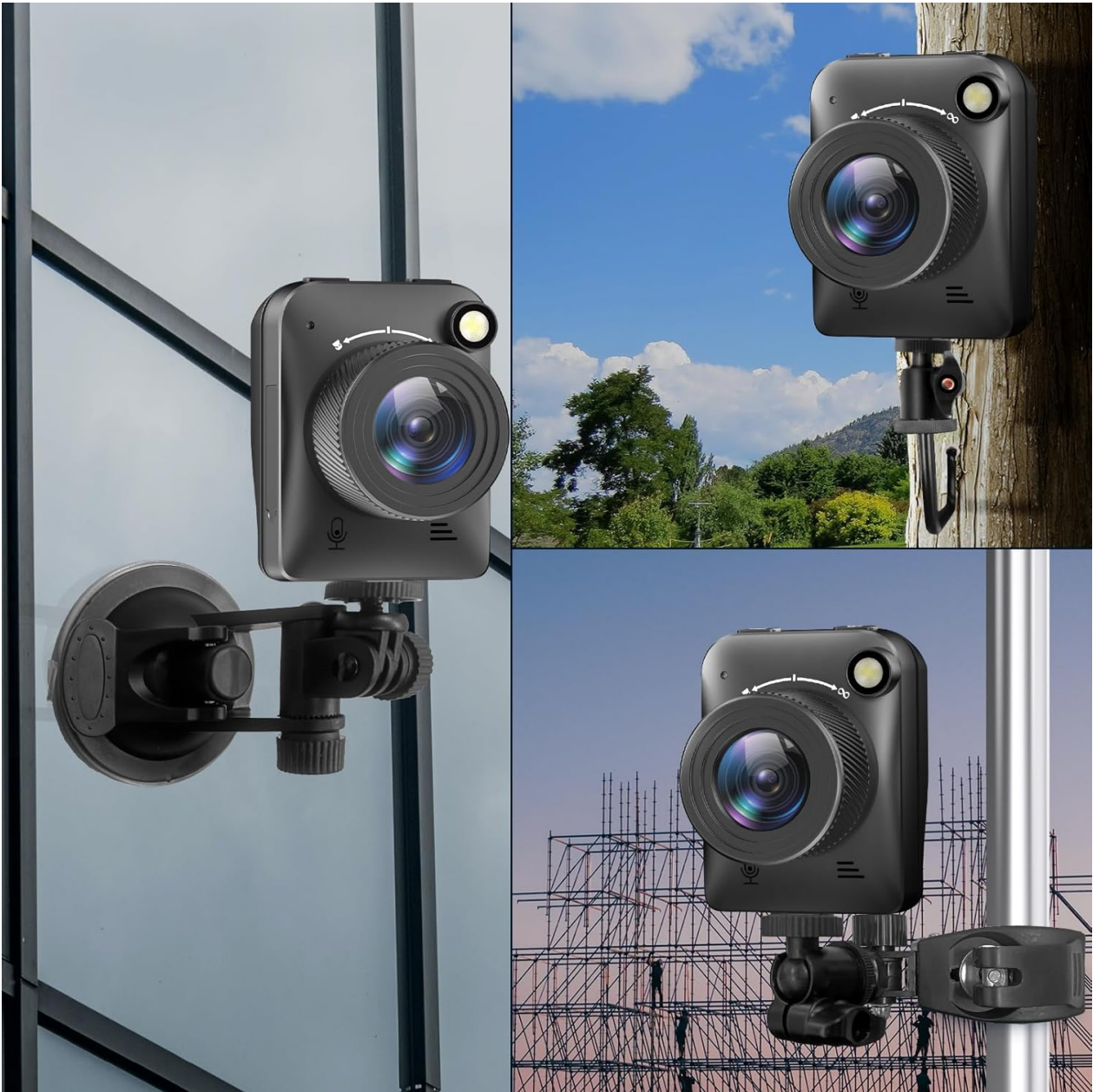
Image: The Dsoon TL3000 camera demonstrating its versatile mounting capabilities.

Attach the desired bracket to the camera's base and secure it to your chosen location. The camera's design allows for flexible positioning.