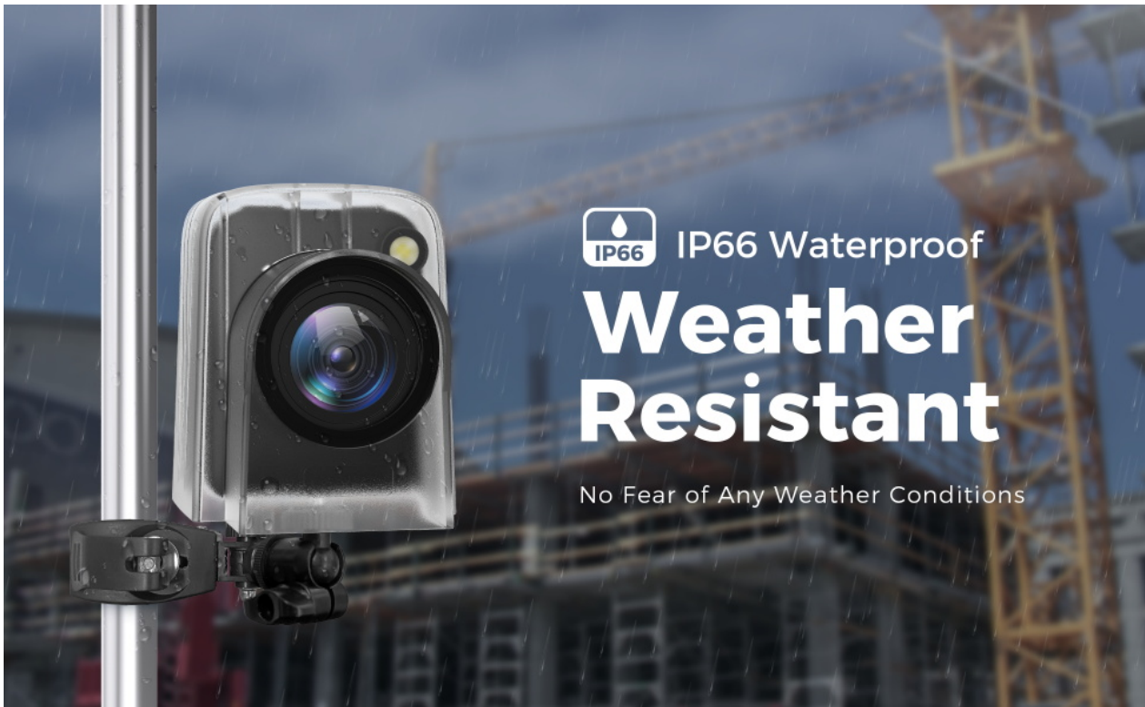
Image: Time-lapse footage showing progress at a construction site.

Video: Demonstration of the Dsoon 4K FHD Time Lapse Camera in action for recording construction.