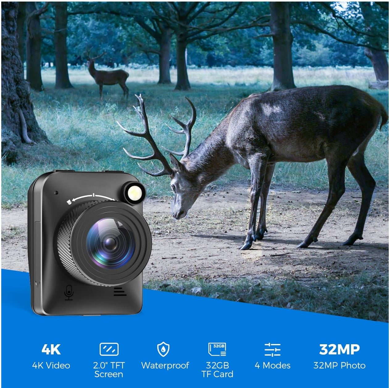
Image: The Dsoon TL3000 camera showcasing its key features and suitability for outdoor observation.