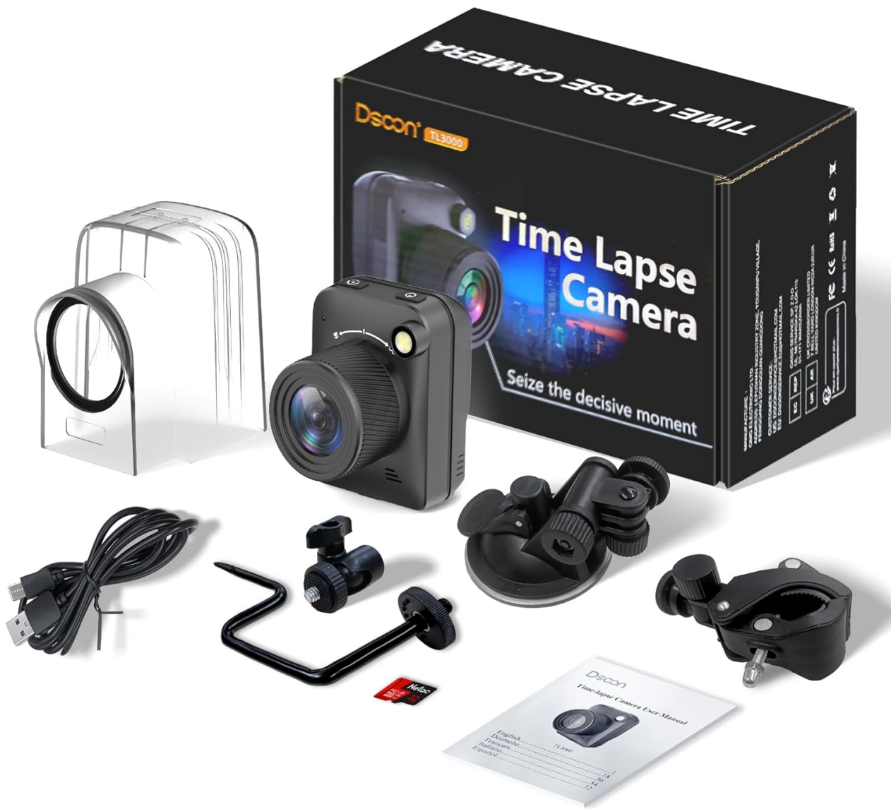
Image: All components included in the Dsoon TL3000 Time Lapse Camera package.