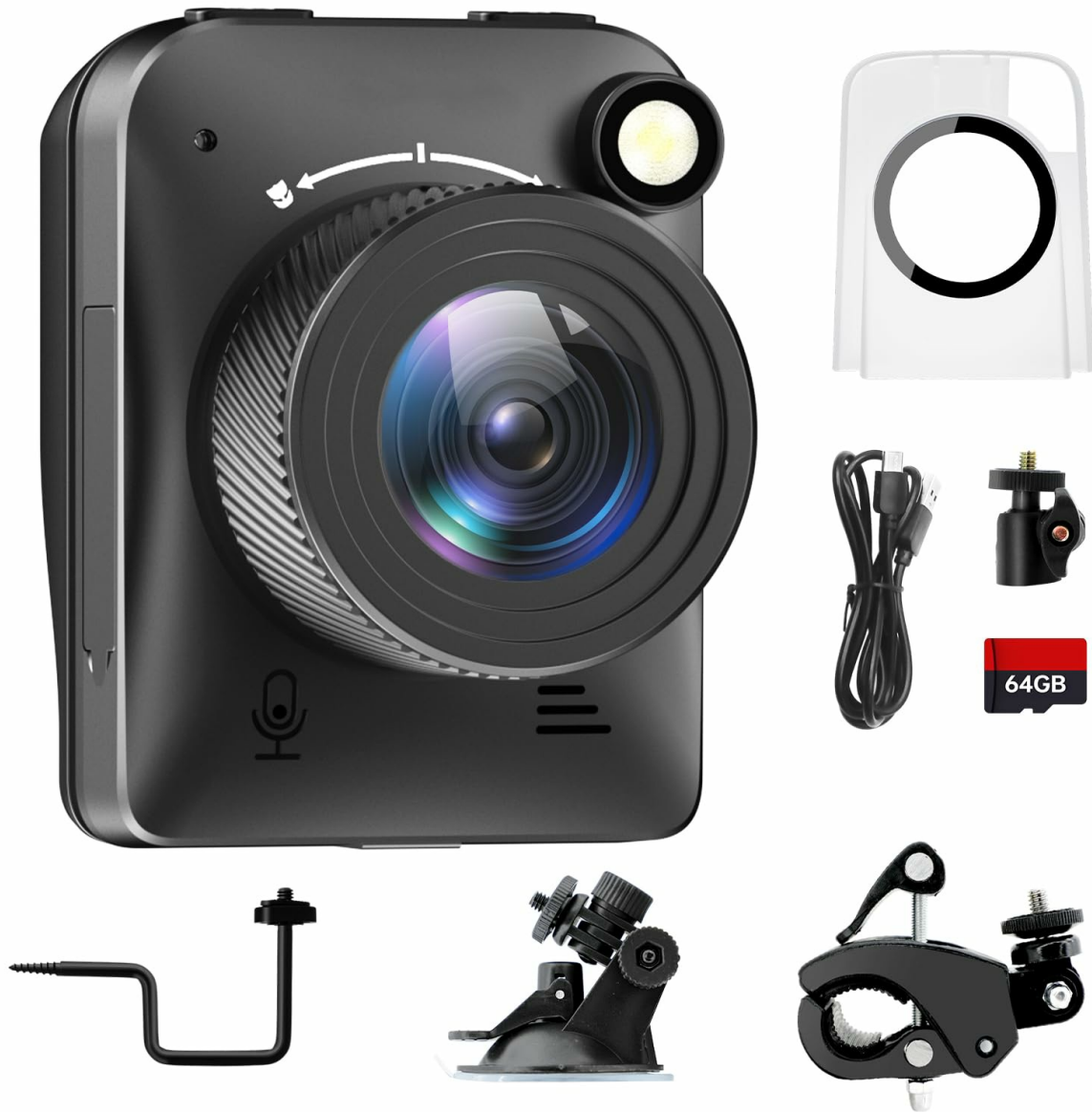
Image: Front view of the Dsoon TL3000 Time Lapse Camera.