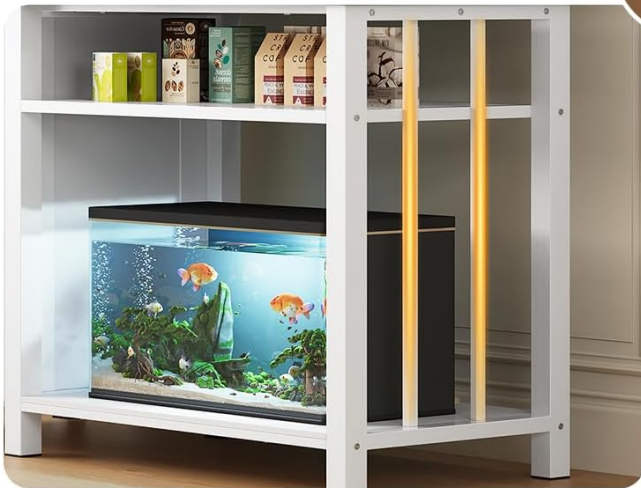
Two Metal Strengthen Design