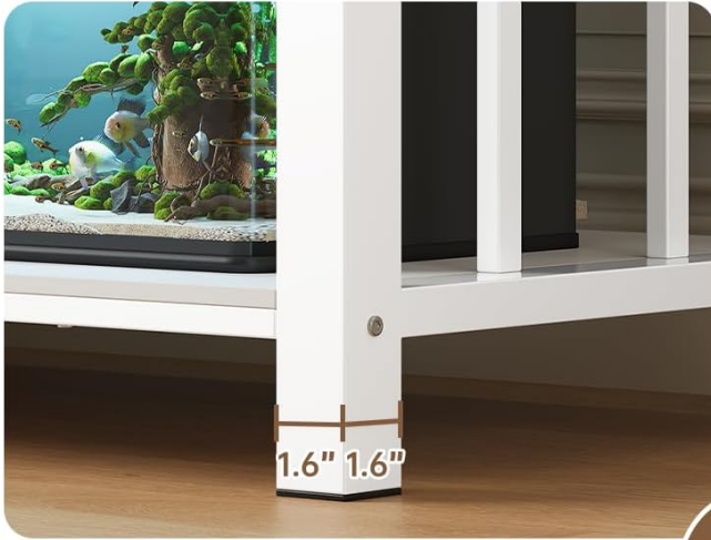
Stability Metal Legs