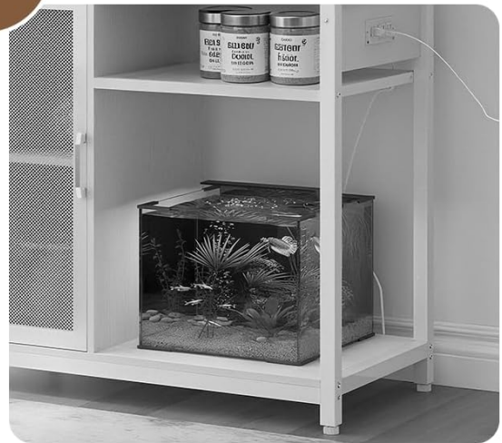
No Strengthen Design

Image: Illustration of the stand's stability features, including reinforced metal legs.