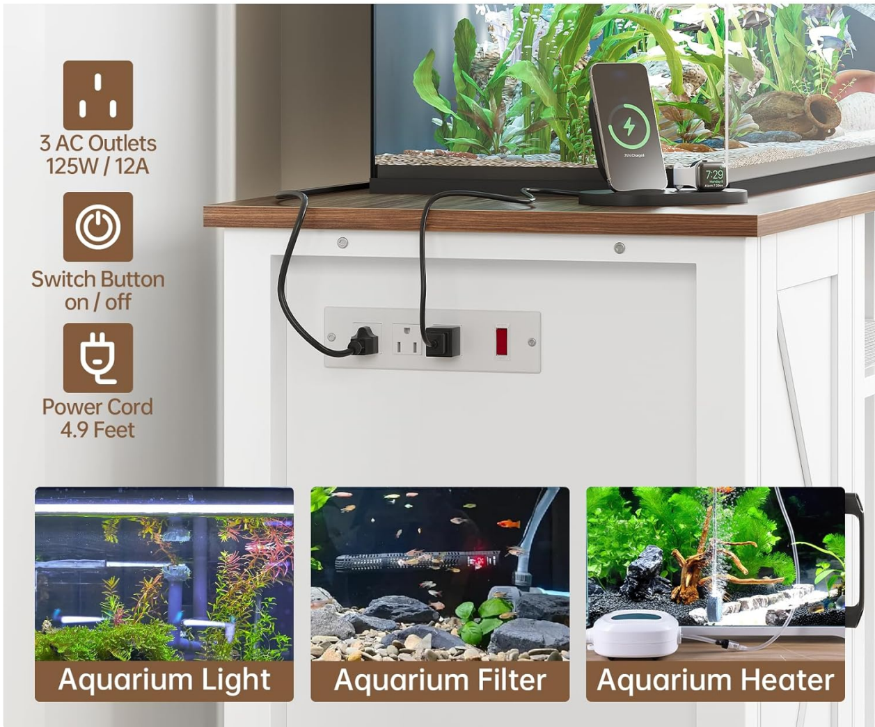
Image: The integrated power outlet with 3 AC outlets and a safety switch for aquarium equipment.