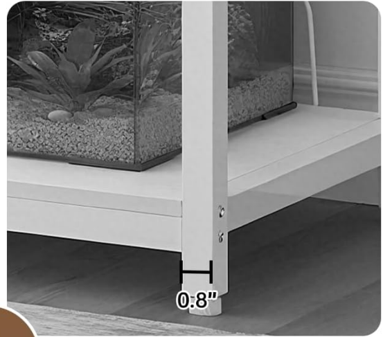
Ordinary Table Legs