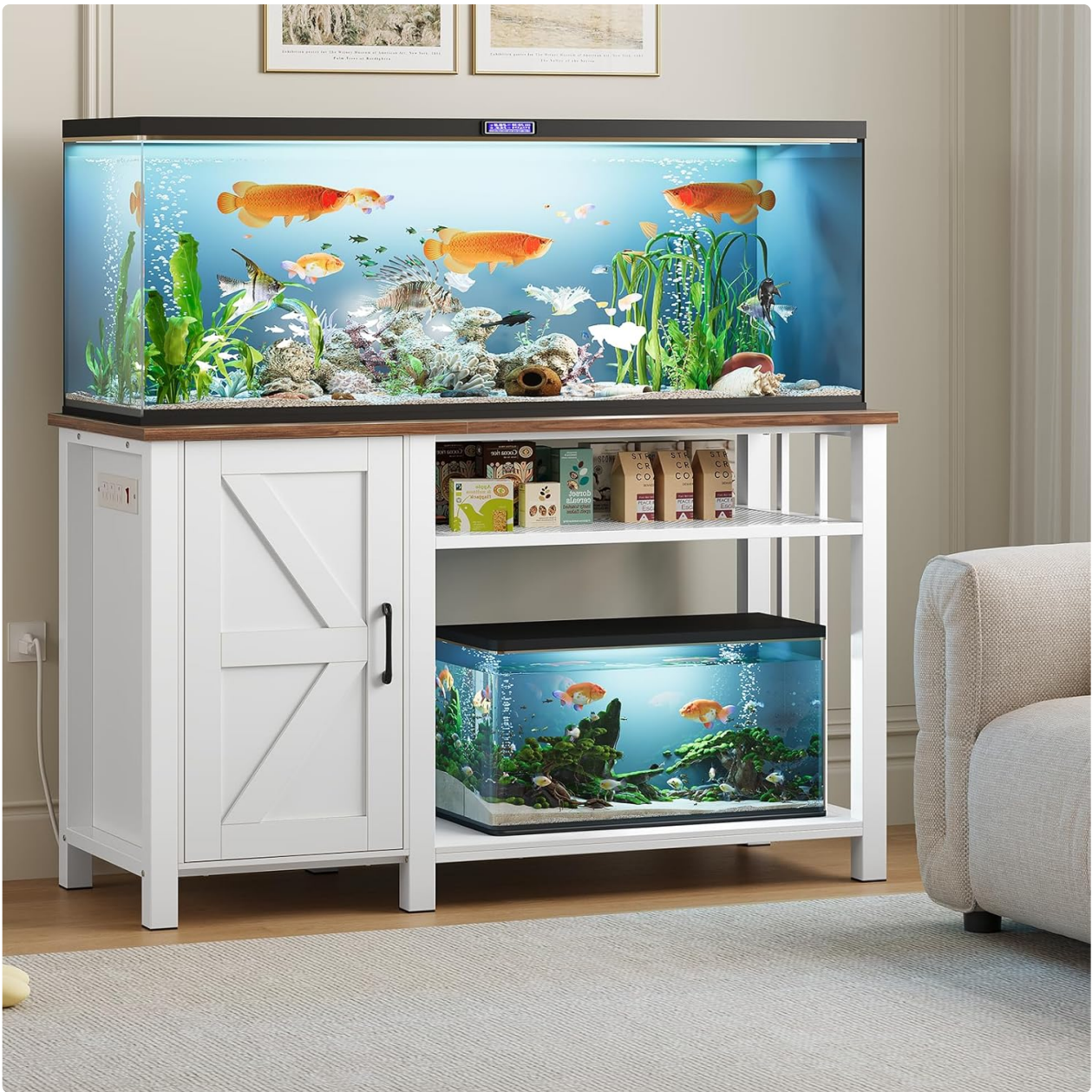
Image: The LotaTools Aquarium Stand supporting a large fish tank, highlighting its robust design.