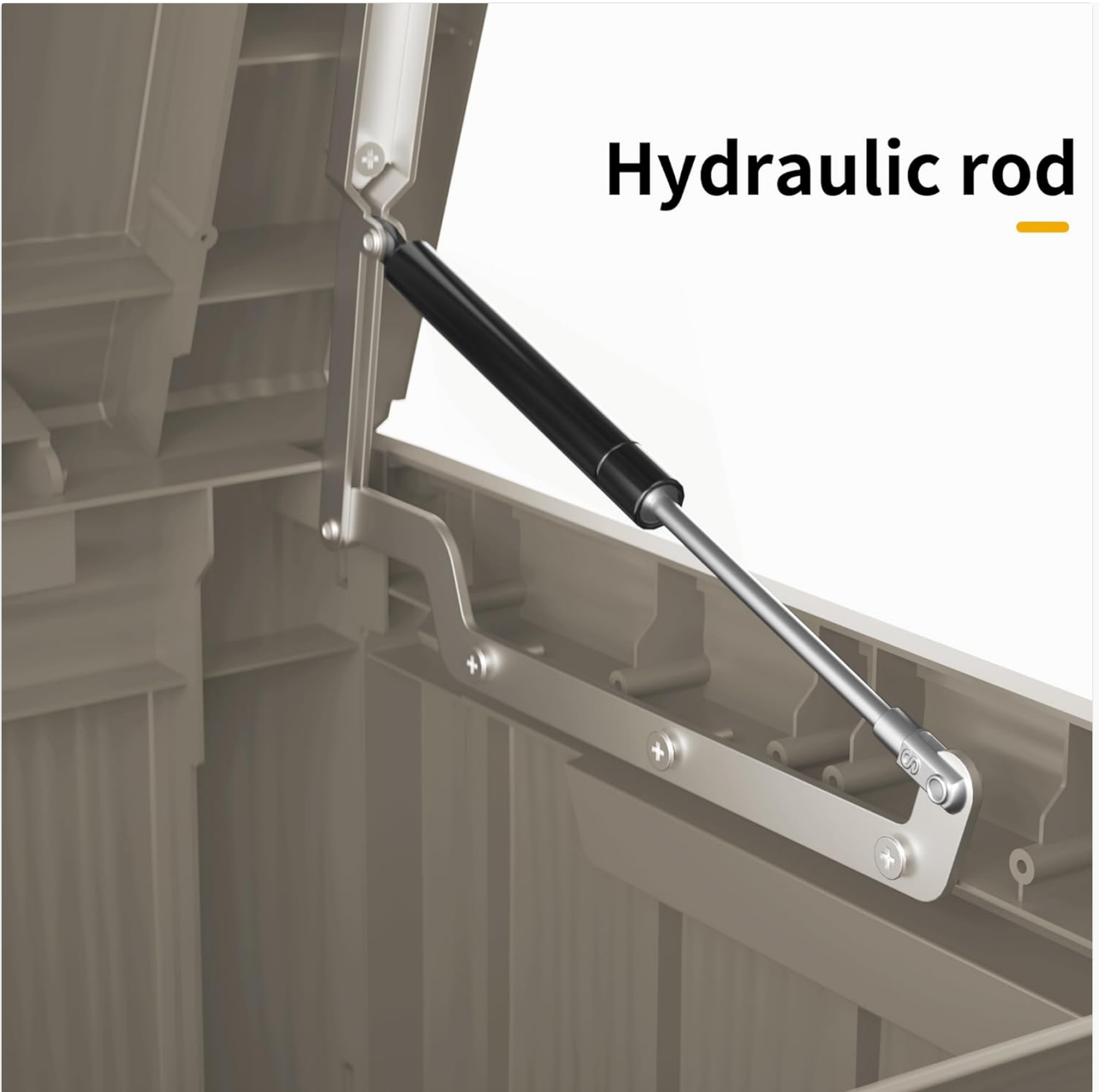
Image: Detail of the hydraulic rod that ensures a soft-close lid.