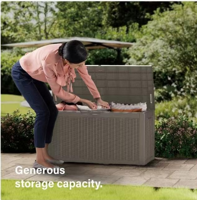
Generous storage capacity.