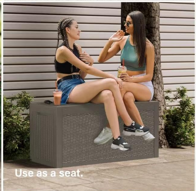
Use as a seat.