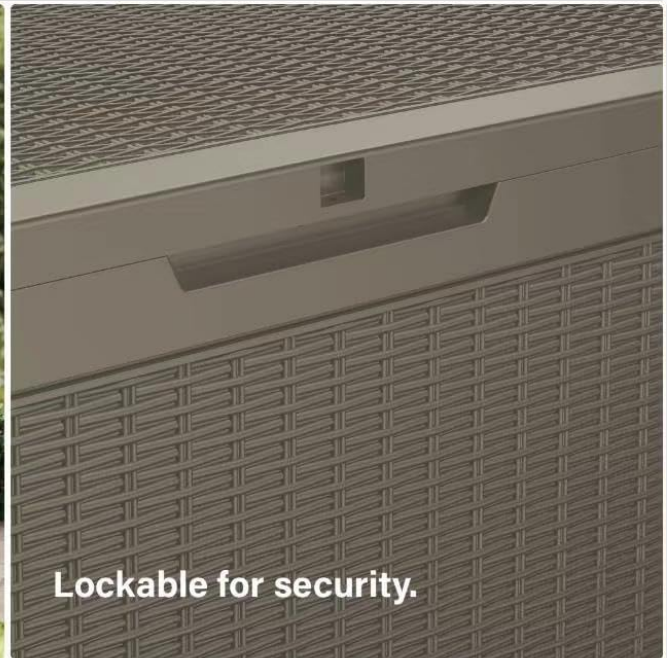
Lockable for security.