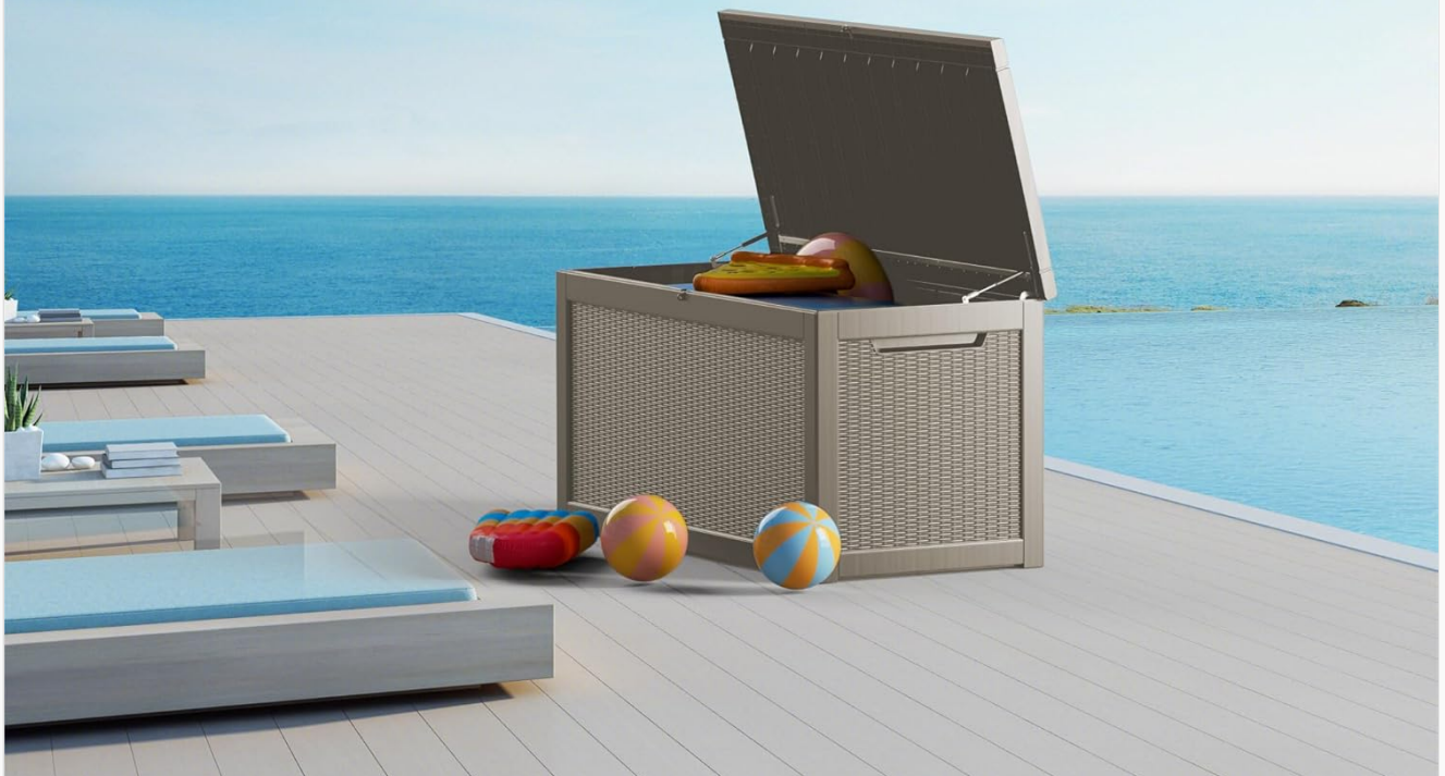
Image: The storage box doubles as a sturdy bench for seating.

See the product in use and its storage capabilities: