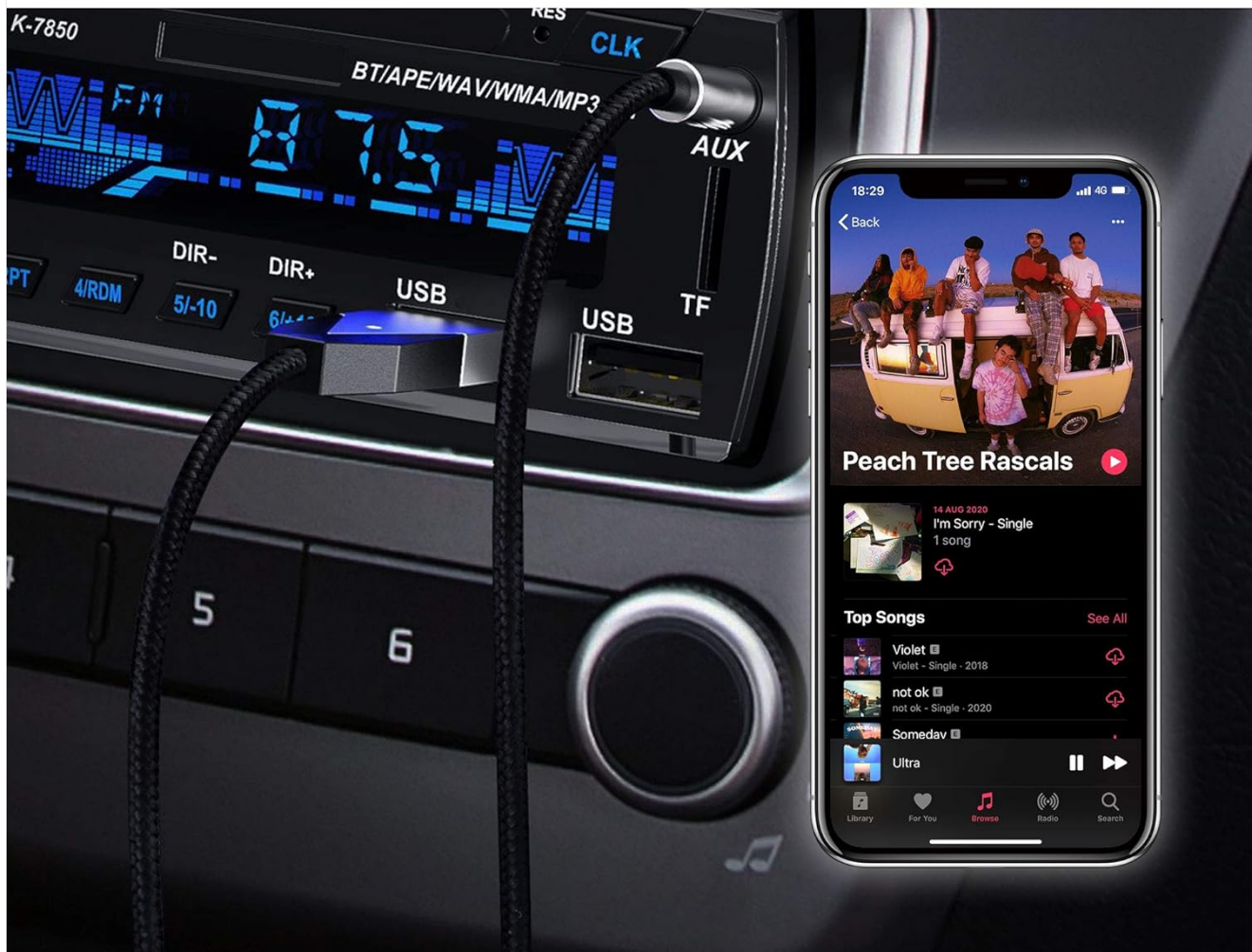
Figure 3.1: The adapter connected to a car's USB and AUX ports, ready for music streaming.