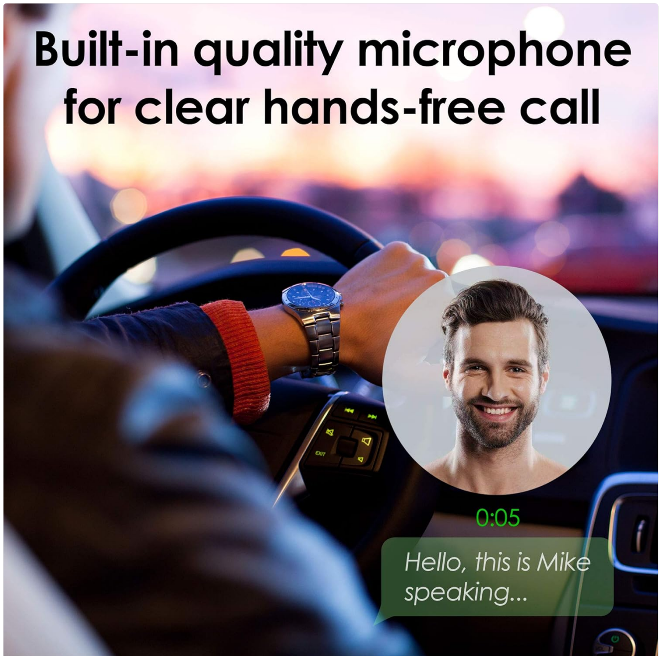
Figure 4.1: Illustrates the use of the built-in microphone for clear hands-free calls while driving.

When a call comes in on your paired mobile device, the adapter's built-in microphone allows for hands-free communication. Answer or end calls using the controls on your mobile device. The call audio will be routed through your connected stereo system.