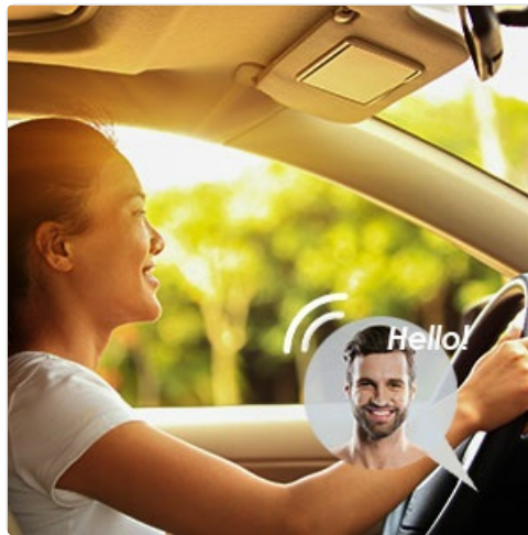
Figure 2.3: The adapter features Bluetooth 5.0 technology for enhanced connectivity.