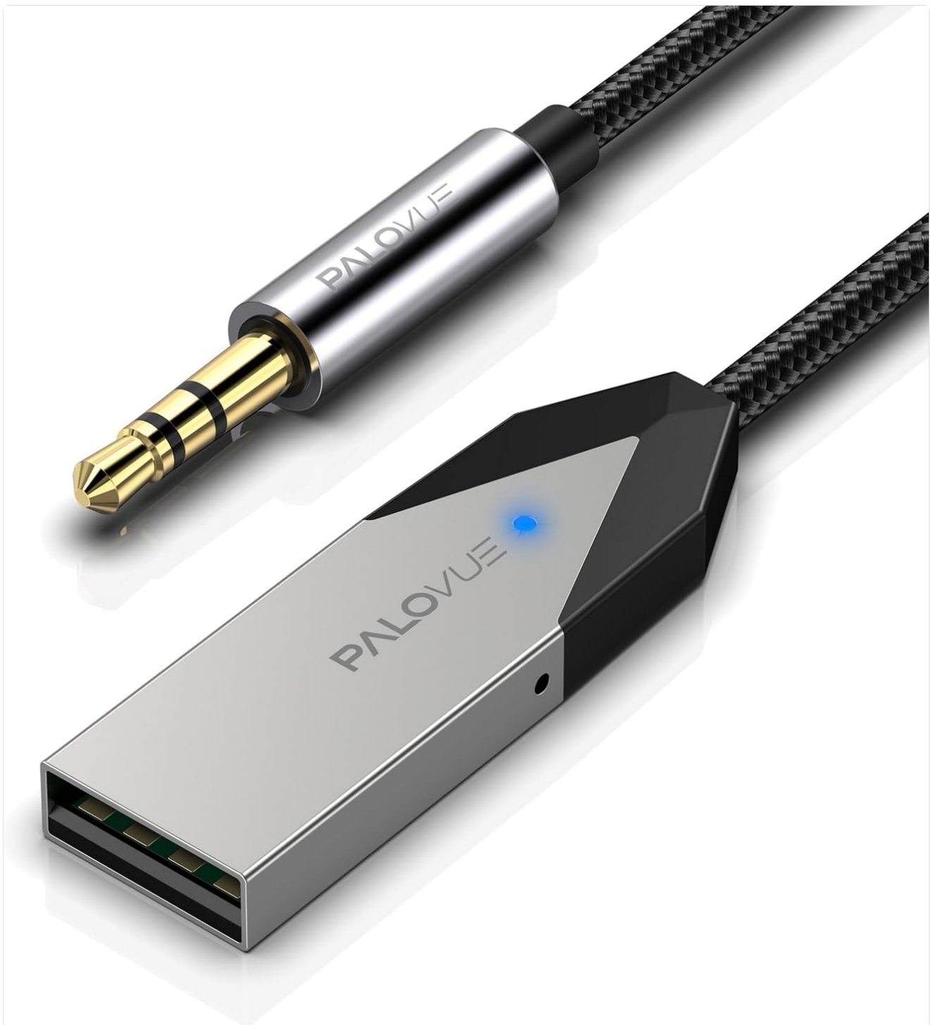
Figure 2.1: PALOVUE Bluetooth Aux Adapter, showing the USB-A connector, 3.5mm audio jack, and braided cable.