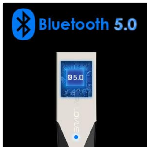
Figure 2.2: Detailed diagram illustrating the USB Power Supply Port, Microphone, LED Light, Zinc Alloy Material, 3.5mm Audio