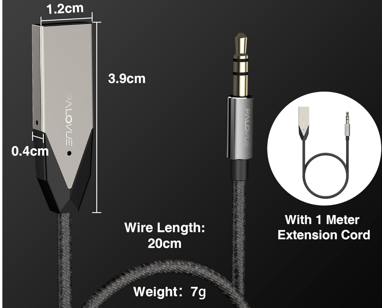
Figure 2.4: Dimensions of the adapter (3.9cm length, 1.2cm width, 0.4cm thickness) and cable length (20cm), with an optional 1-meter extension cord.