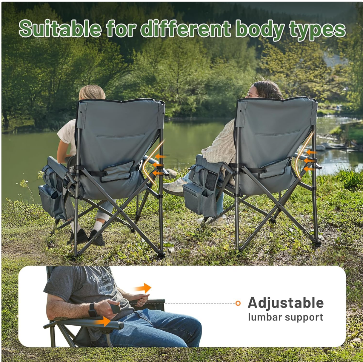
Image 4.1: Visual comparison illustrating the ergonomic benefits of the integrated lumbar support design.