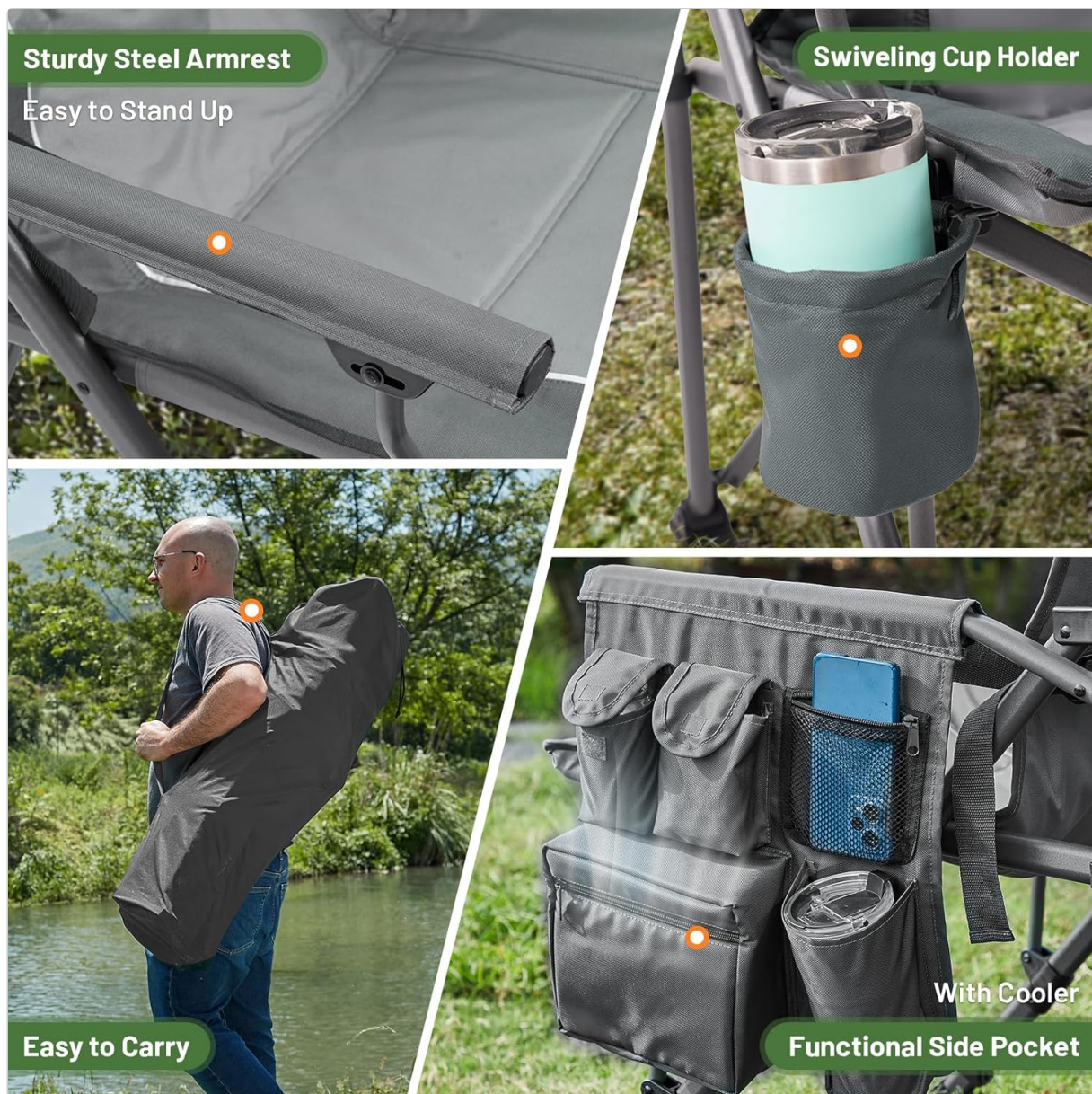
Image 4.2: Detail view of the swiveling cup holder and the multi-functional side pockets, including a cooler bag section.