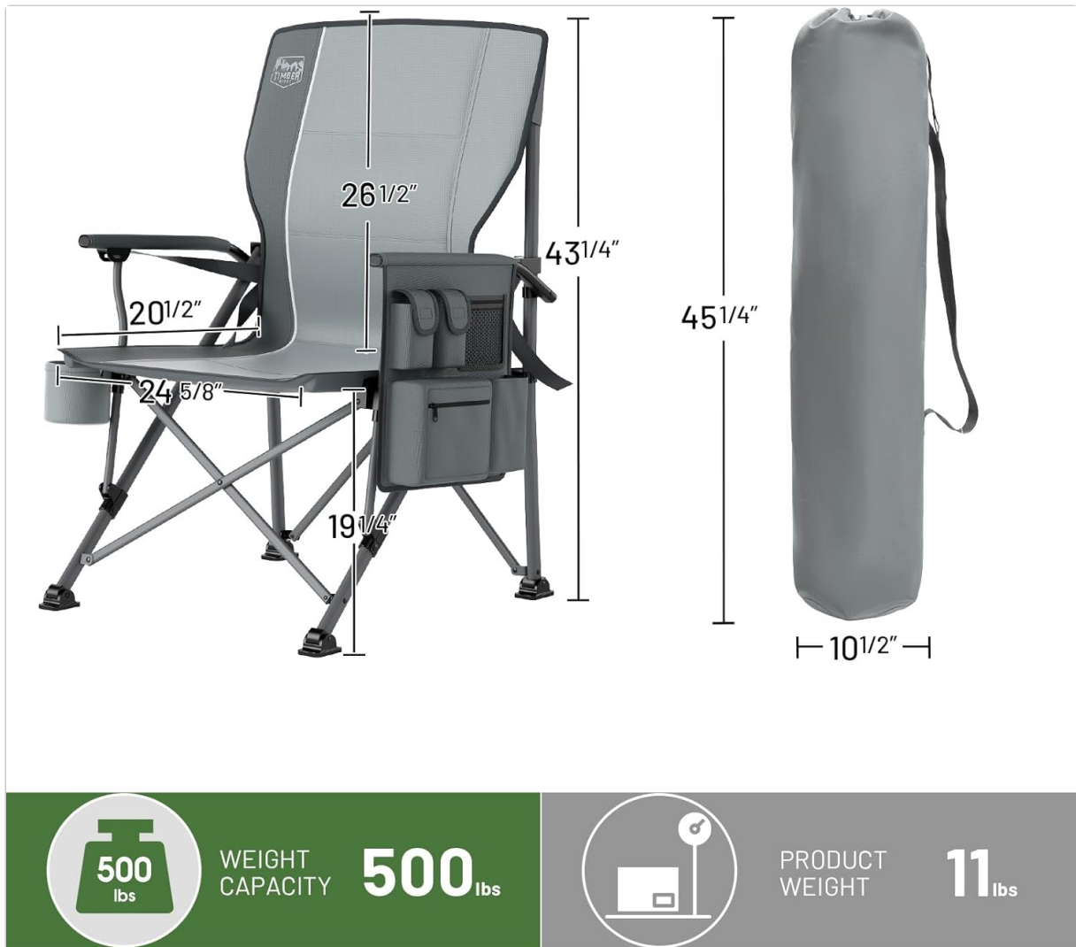
Image 7.1: Detailed dimensions of the TIMBER RIDGE Oversized Folding Camping Chair.