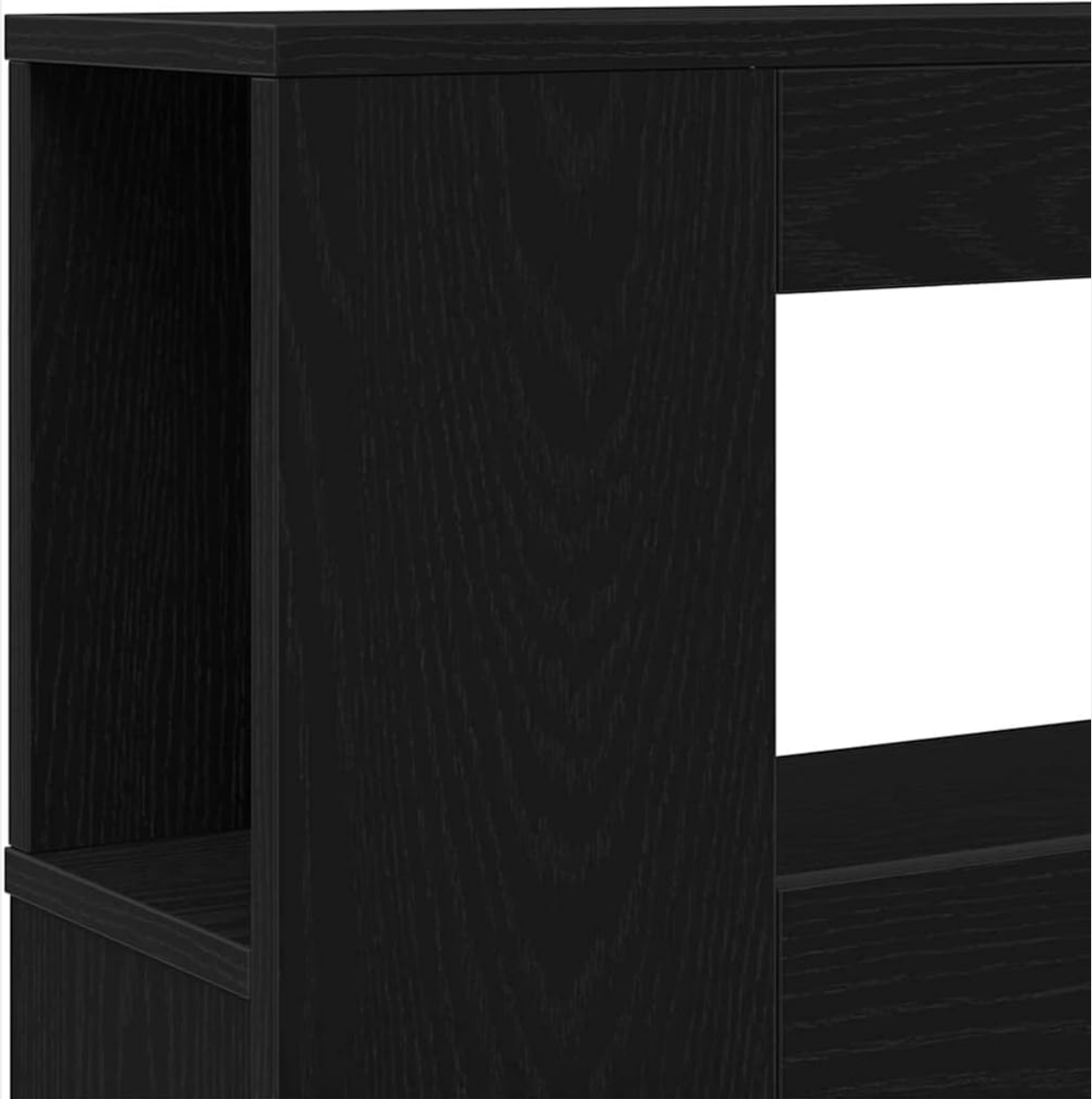
Image 4.2: View of the integrated shelf, providing convenient storage.