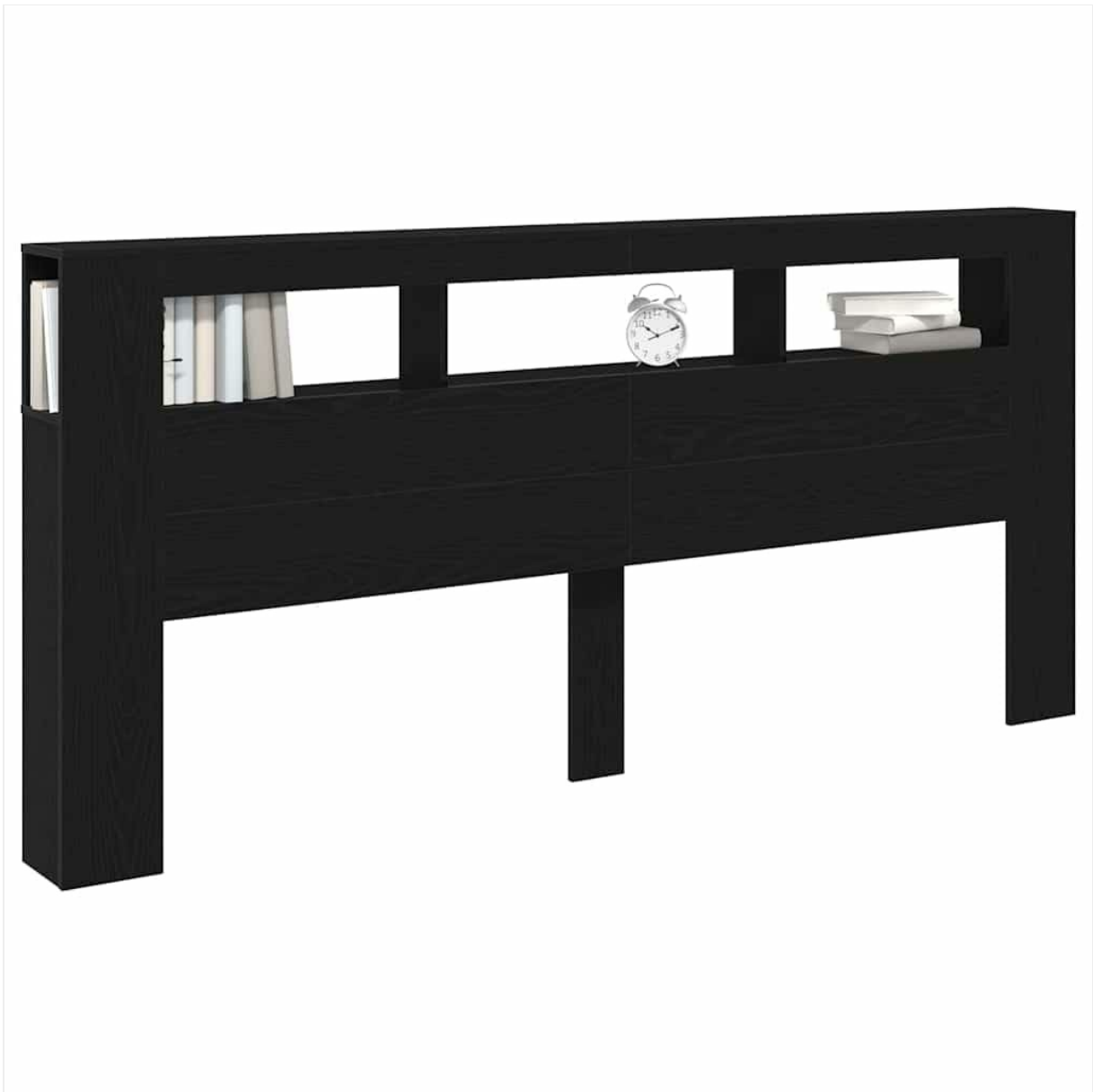
Image 1.1: The vidaXL LED Headboard with integrated shelf in a bedroom setting.