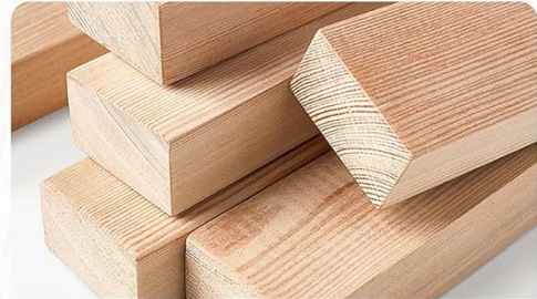
Hard Solid Wood Frame