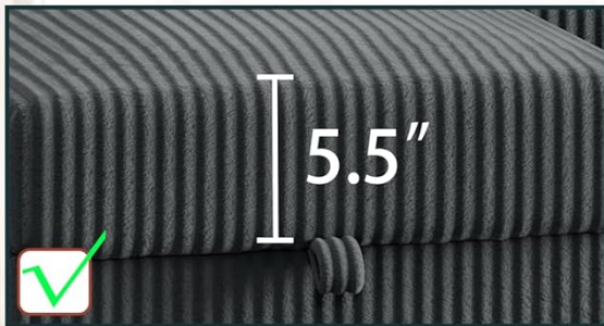
More Comfort Thick Cushion