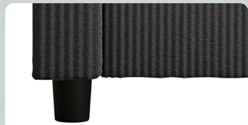
Sturdy Sofa Legs