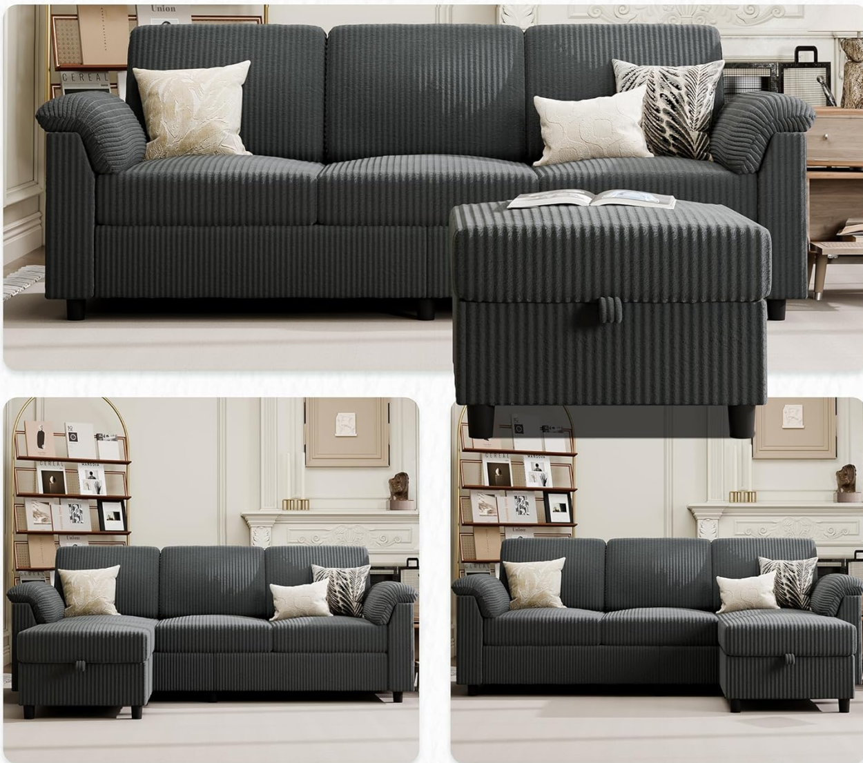
Image 4.1: The flexible movable ottoman allows for various sofa configurations, adapting to different room layouts and user preferences.