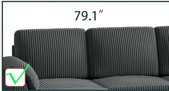
79" Convertible Sectional Couch