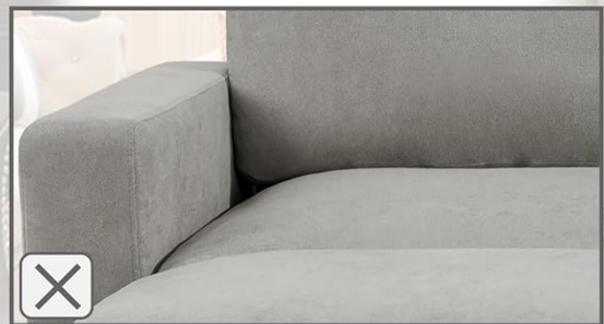
Hard, narrow and uncomfortable