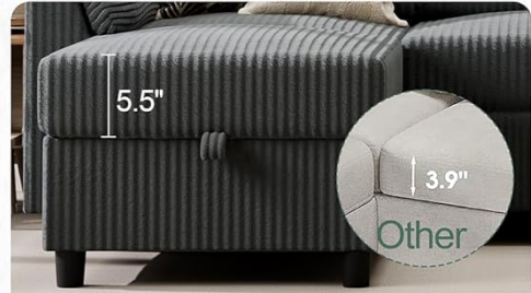
5.5" Thick Seat Cushion