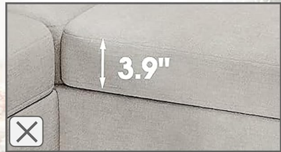
Thinner, Lack of Support