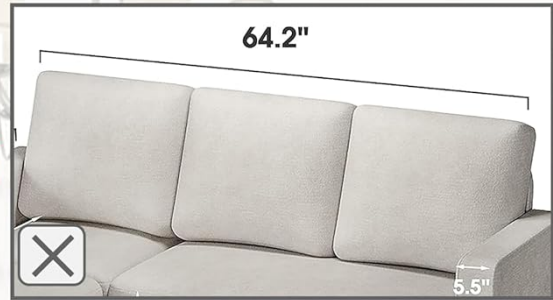
64" Low Version for Children