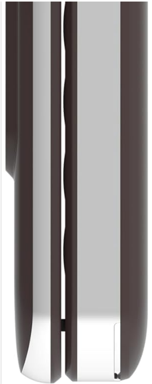
Figure 3: Side view with flashlight button.