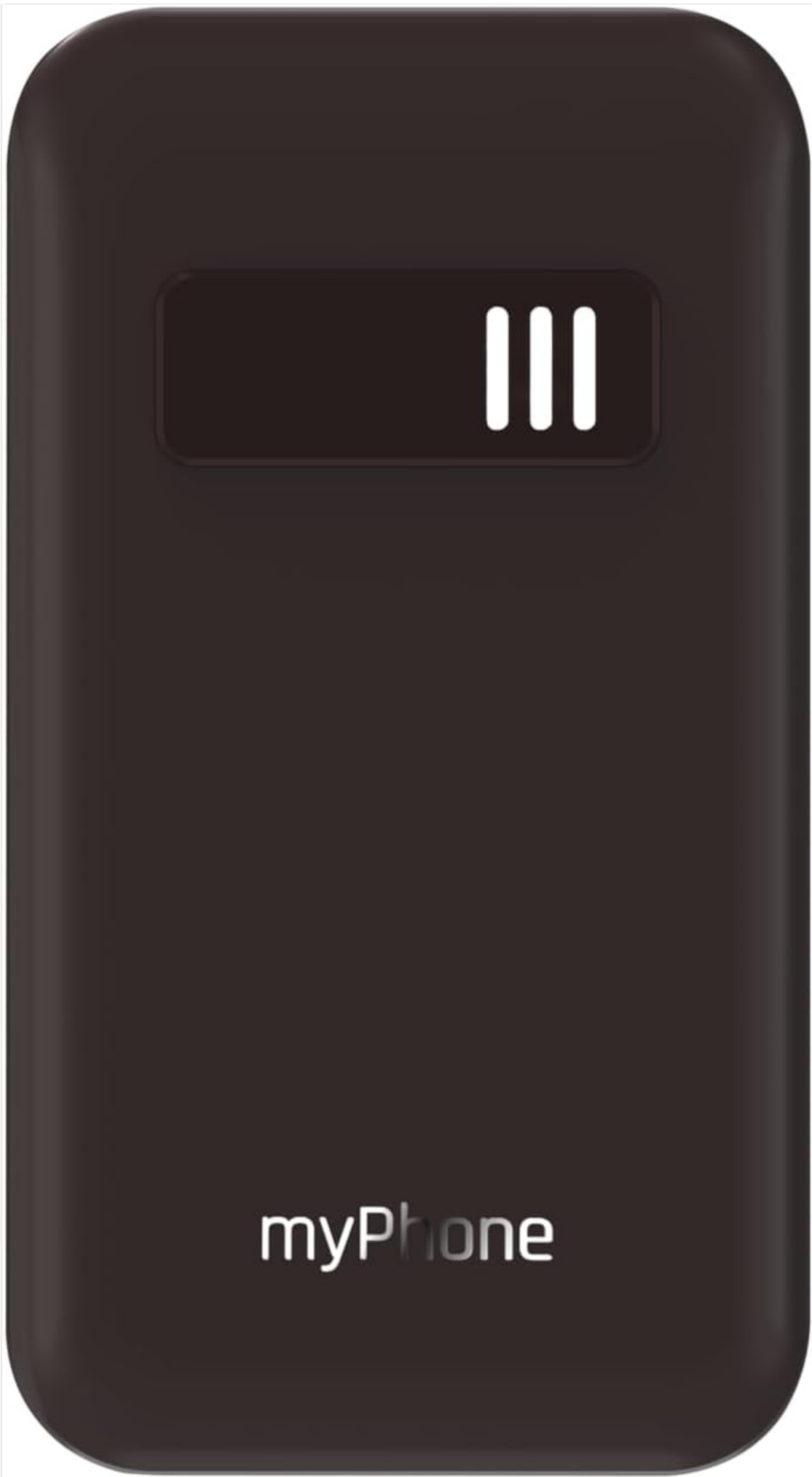
Figure 5: Back of the phone with the SOS button.