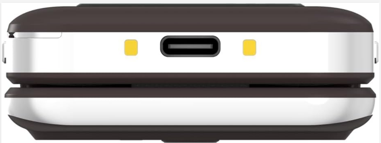
Figure 4: Bottom view with USB-C port.