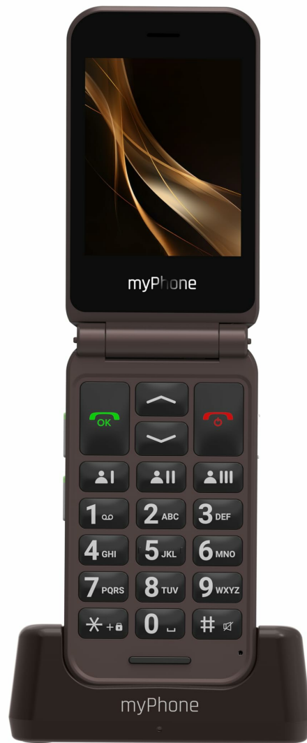
Figure 1: myPhone Harmony LTE in its charging dock (closed view).

Familiarize yourself with the physical components of your myPhone Harmony LTE.