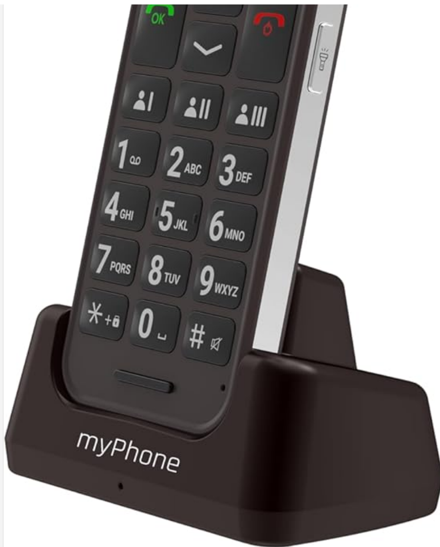
Figure 6: Phone charging in the dock (open view).