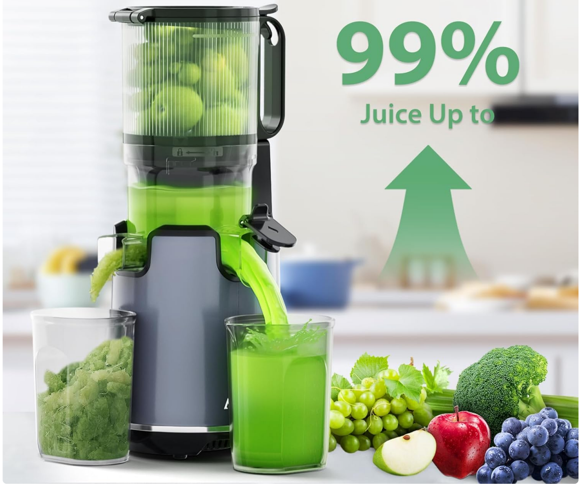
Image: The Aeito juicer producing a high yield of pure green juice, with dry pulp collected in a separate container, illustrating efficient extraction.