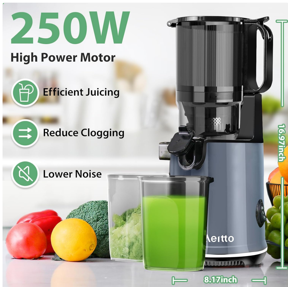
Image: The Aeito juicer's large 5.3-inch feed chute, capable of accommodating whole fruits and vegetables like apples, grapes, and carrots, significantly reducing preparation time.