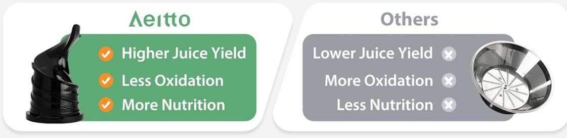
Image: A diagram illustrating the 7-stage upgraded auger of the Aeito juicer, detailing how it cuts, grinds, squeezes, and extracts juice for maximum yield and nutrition compared to traditional methods.