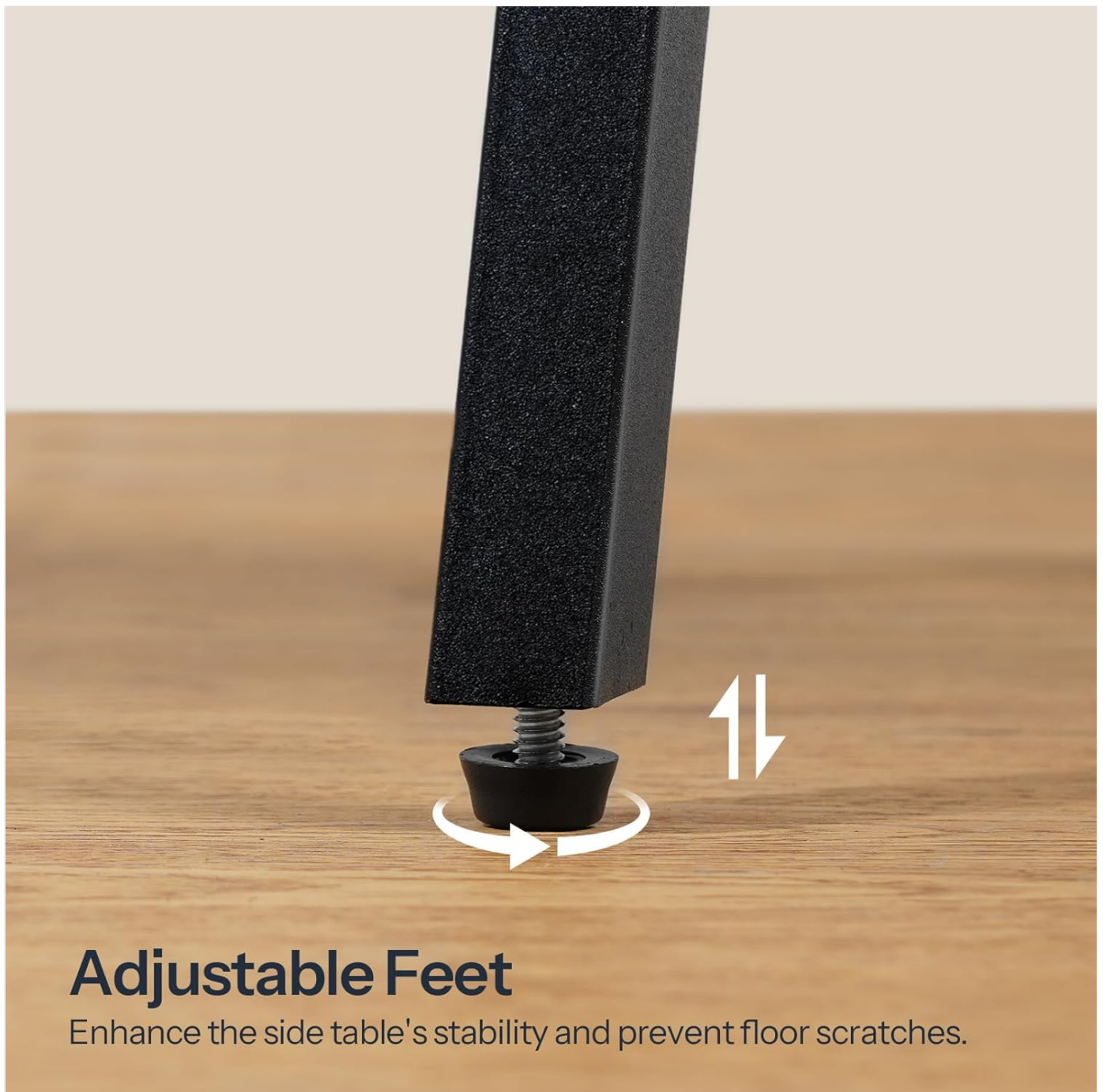
Image 5.3: Adjustable feet enhance stability and prevent floor scratches. Rotate to adjust height.