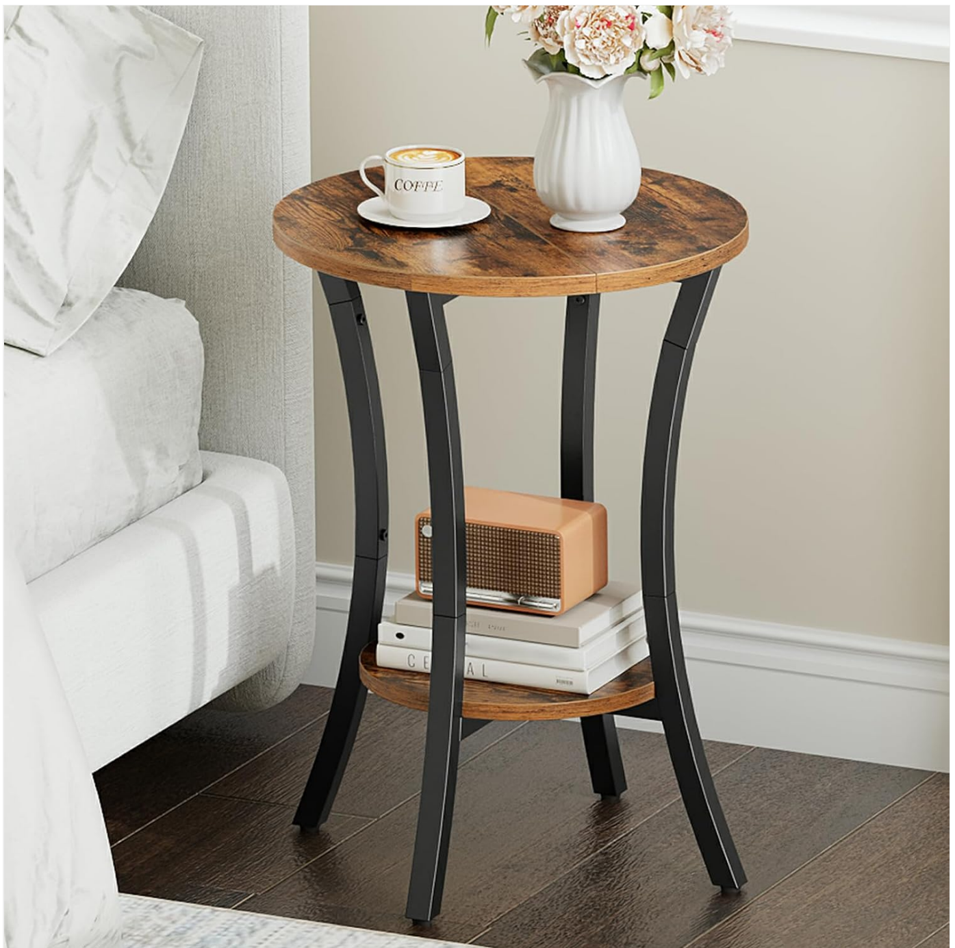
Image 6.1: The side table functions effectively as a nightstand in a bedroom setting.