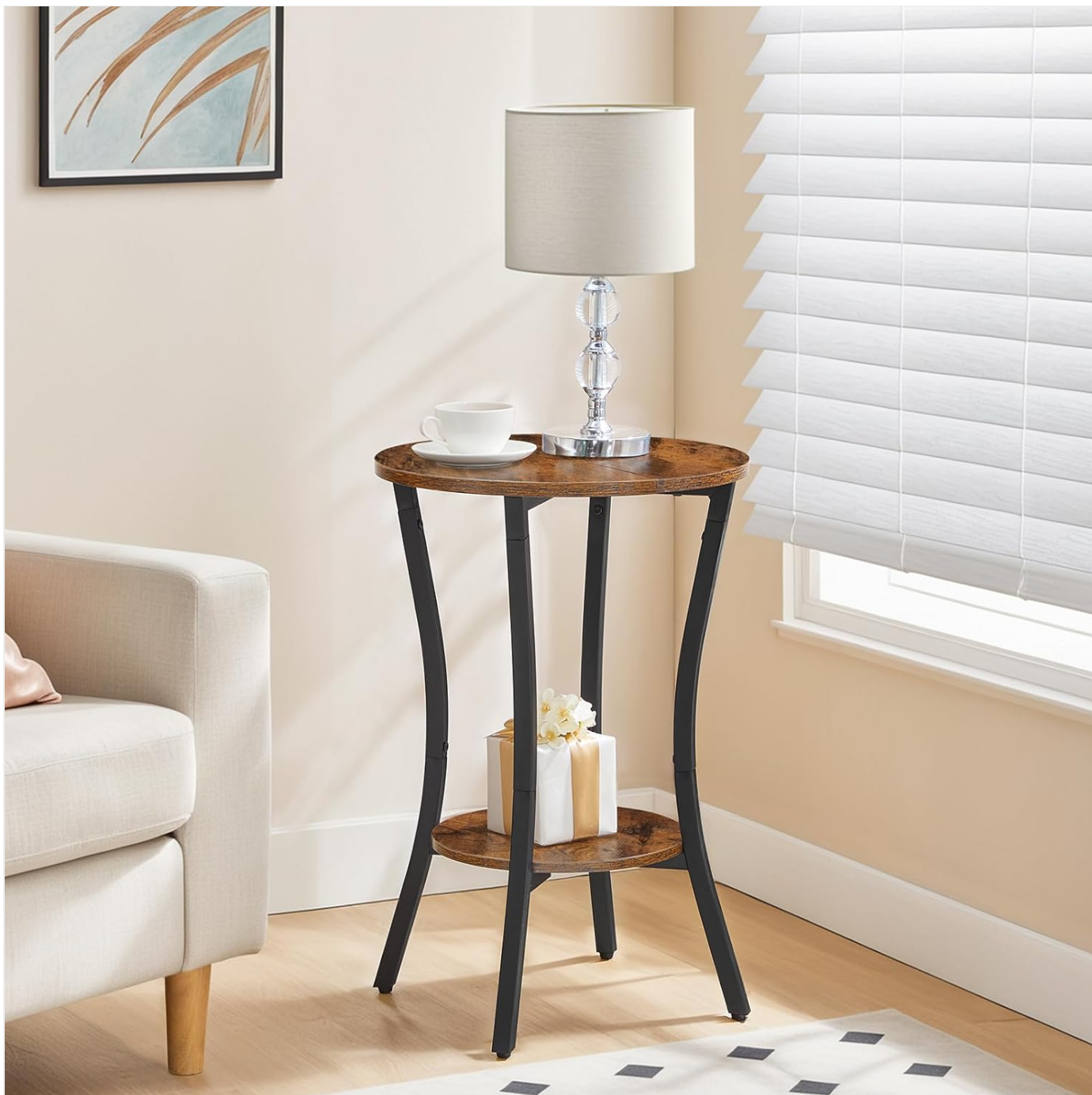
Image 1.1: The HOOBRO Round Side Table BF180BZ01 positioned next to a sofa in a living room, showcasing its compact design and utility.