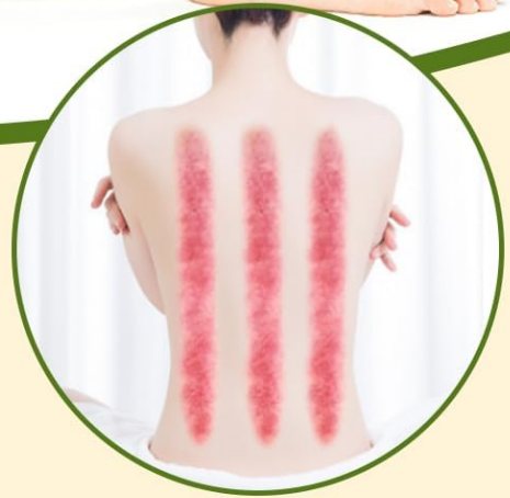
Image: An example of skin redness after using the device, clarifying it as a normal and temporary reaction.

This is an effective massage technique for relieving fatigue. After use, the skin may turn red, which is a normal reaction. This effect will disappear within a couple of days.