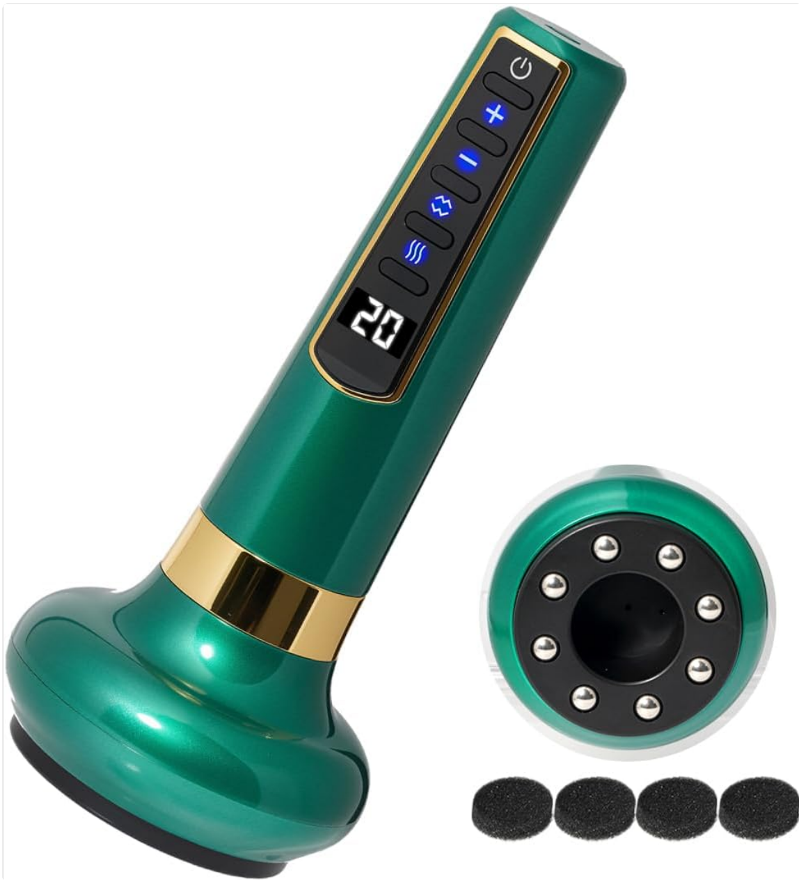
Image: The Dolinvo Electric Cupping Device, showcasing its ergonomic green design with gold accents and control panel.