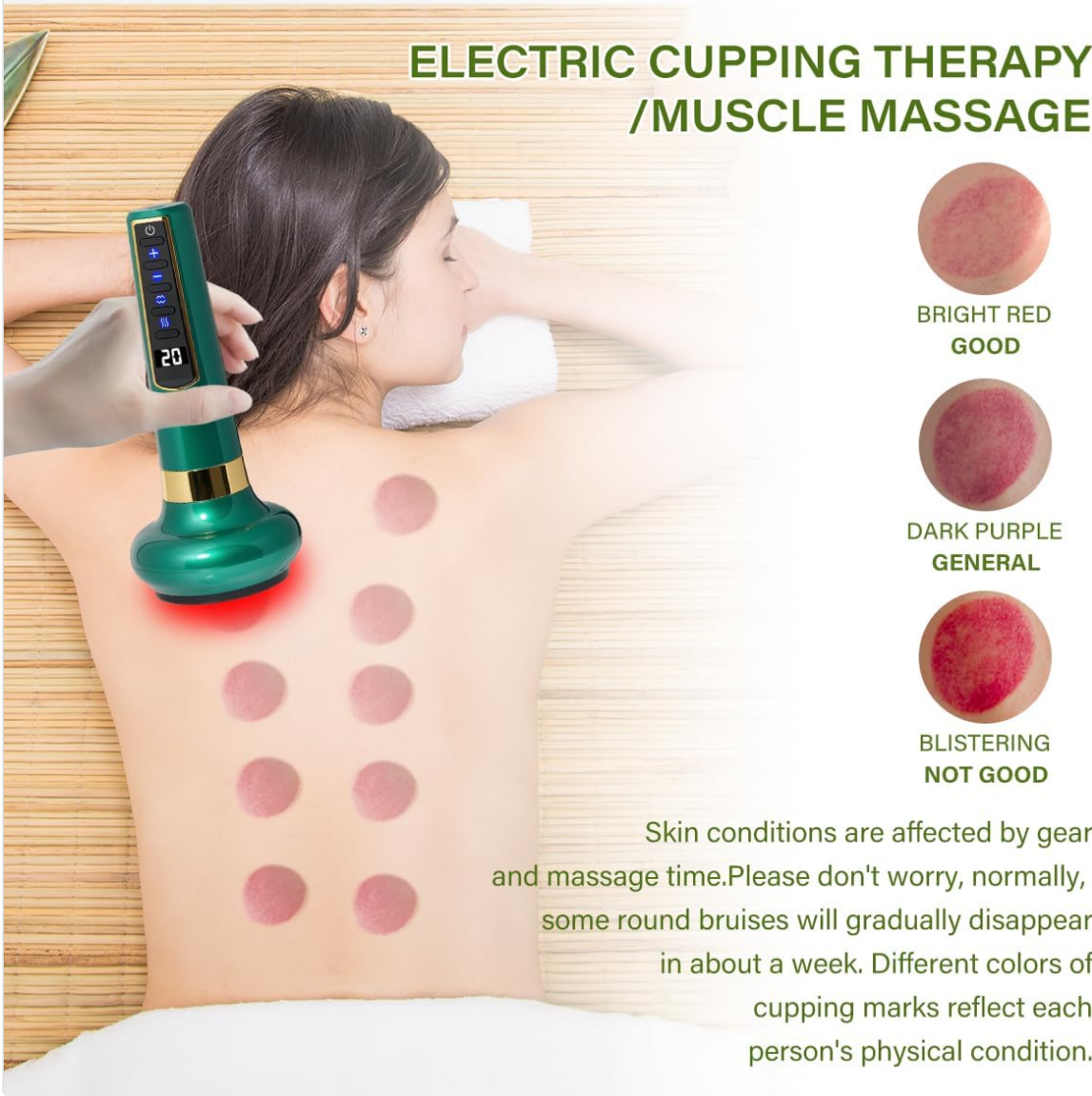
Image: A visual explanation of different cupping marks and their significance, along with an example on a person's back.