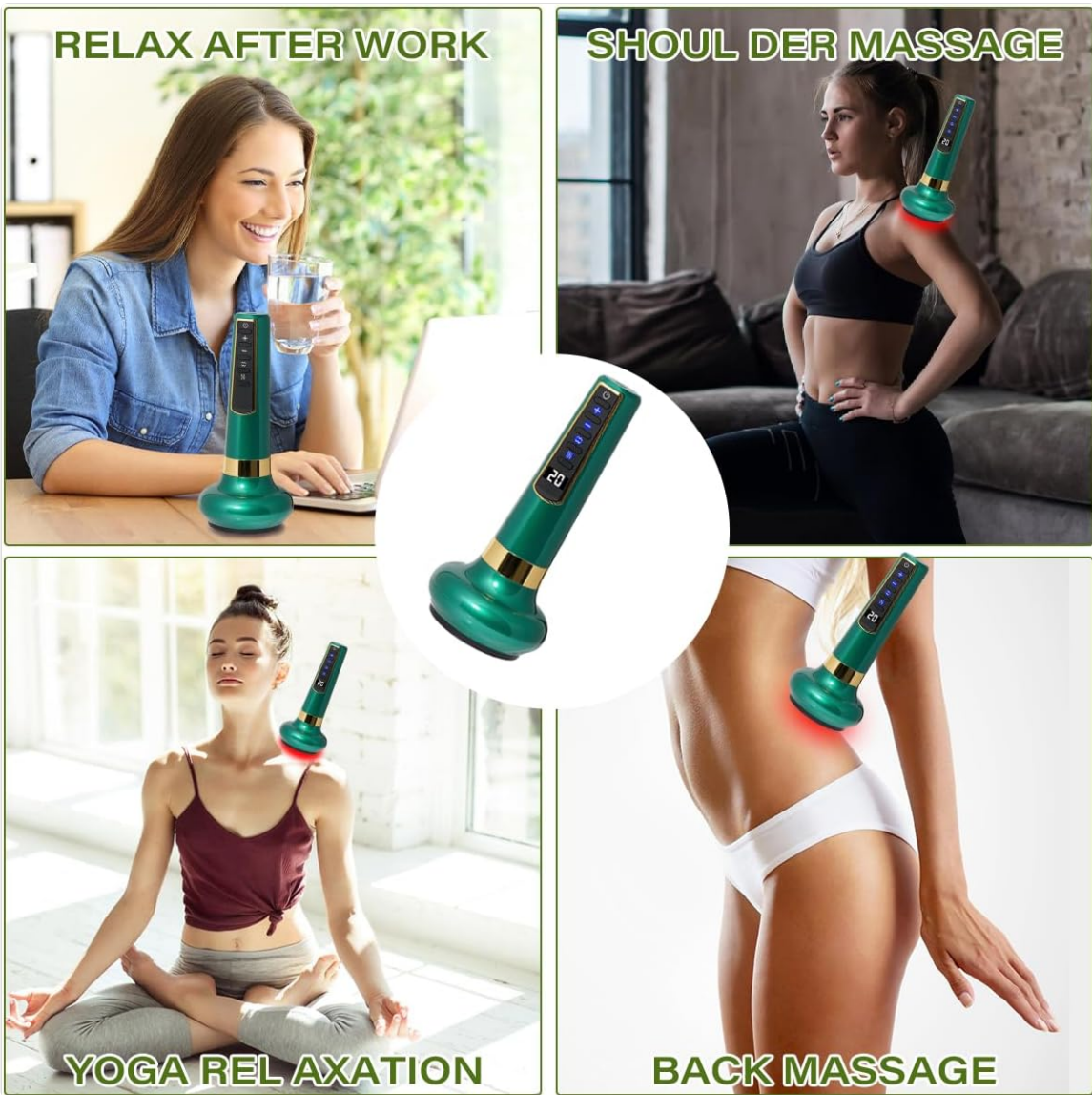
Image: Examples of the device's versatile use for relaxation and massage on different body parts.