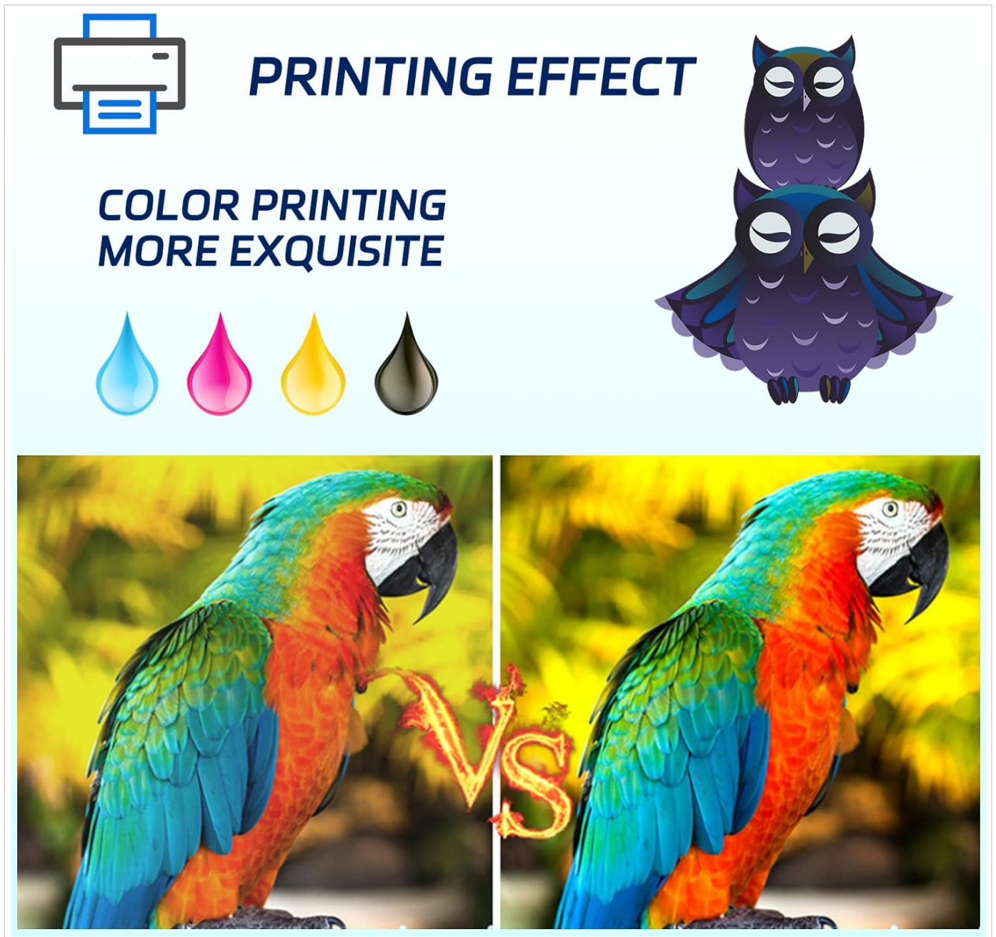
Image 4.2: An illustration showcasing the vividness and detail of color prints achieved with the BIVOL IM C3510 Toner Cartridge.