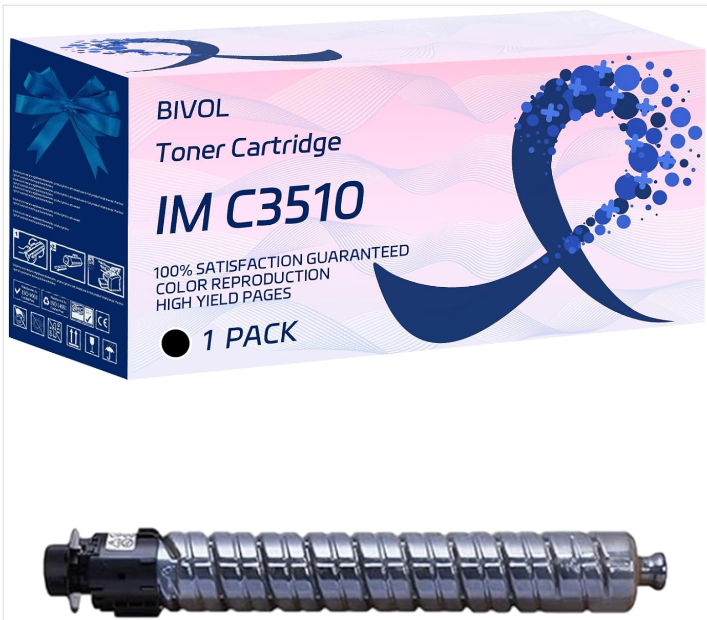
Image 1.1: The BIVOL IM C3510 Toner Cartridge packaging and the cartridge unit. This image displays the product as it appears when unboxed, highlighting its design and branding.