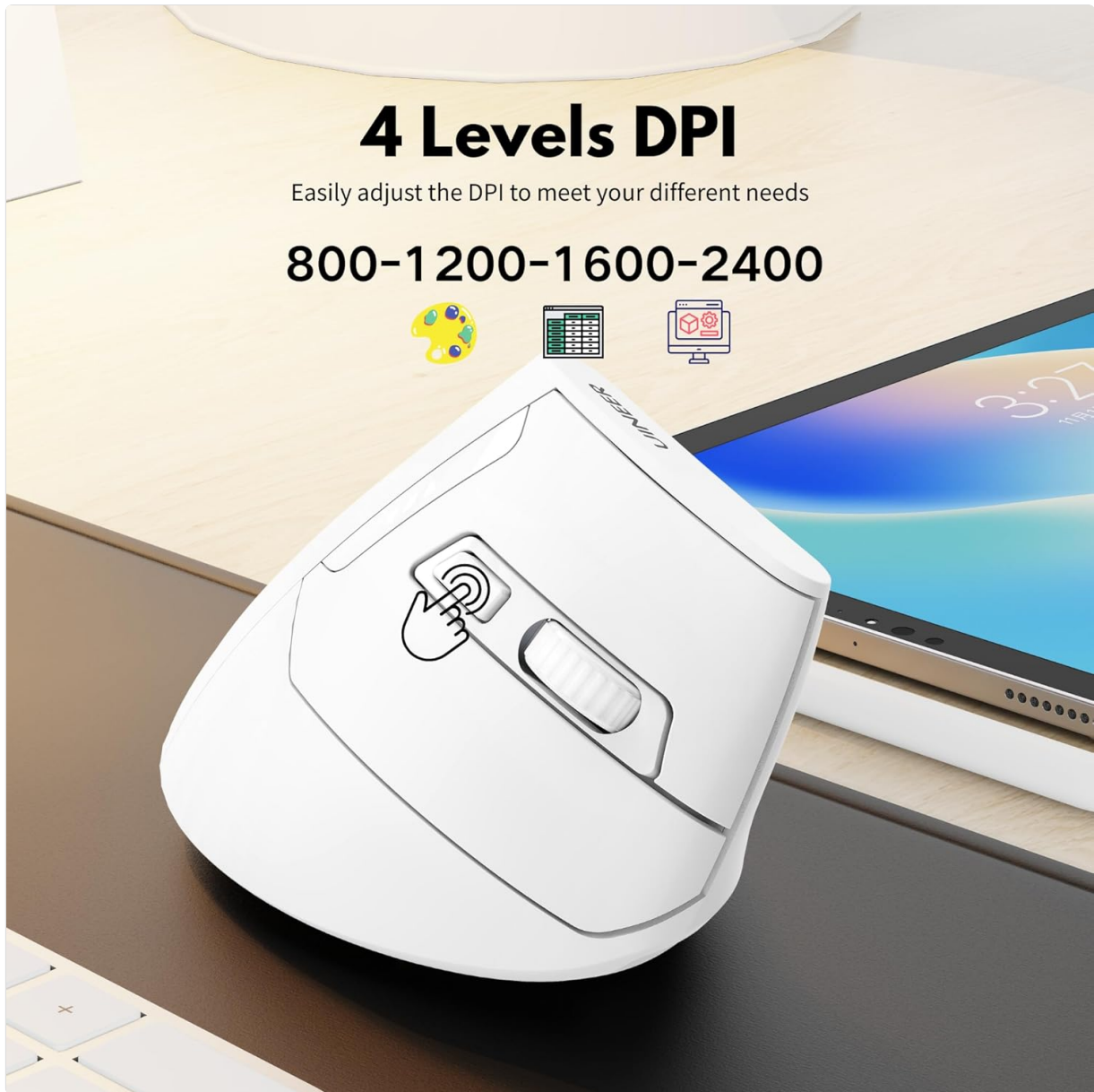
Figure 4: The DPI button and its four adjustable levels (800, 1200, 1600, 2400).