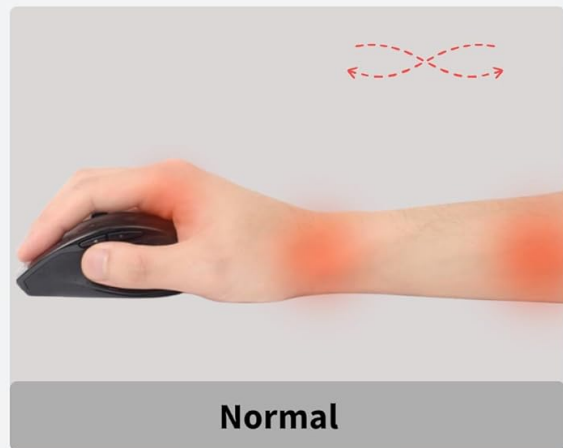
Figure 3: Illustration of the ergonomic vertical design, showing how it reduces wrist strain compared to a traditional mouse.