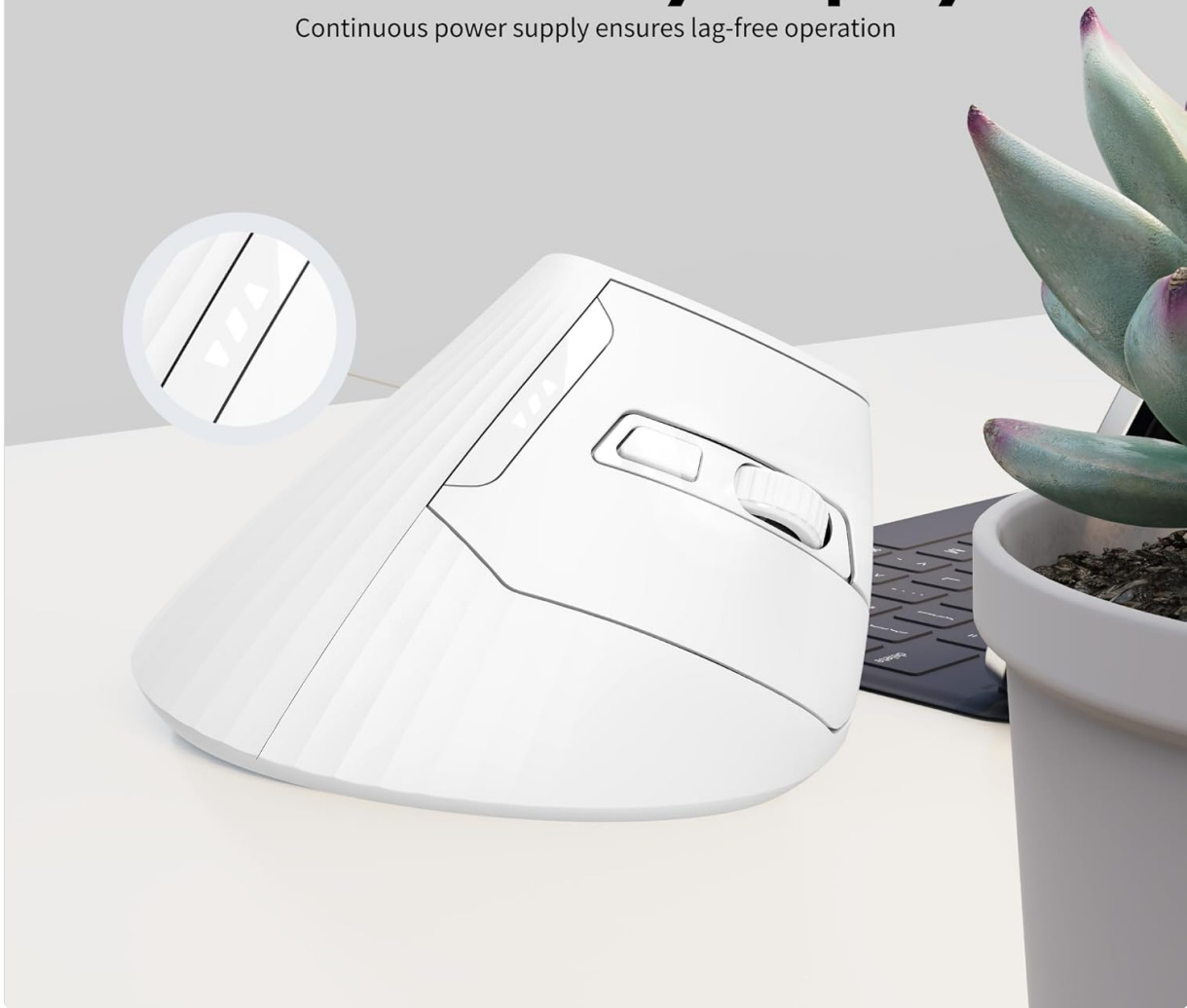
Figure 6: Visual representation of the battery indicator on the mouse.

Continuous power supply ensures lag-free operation