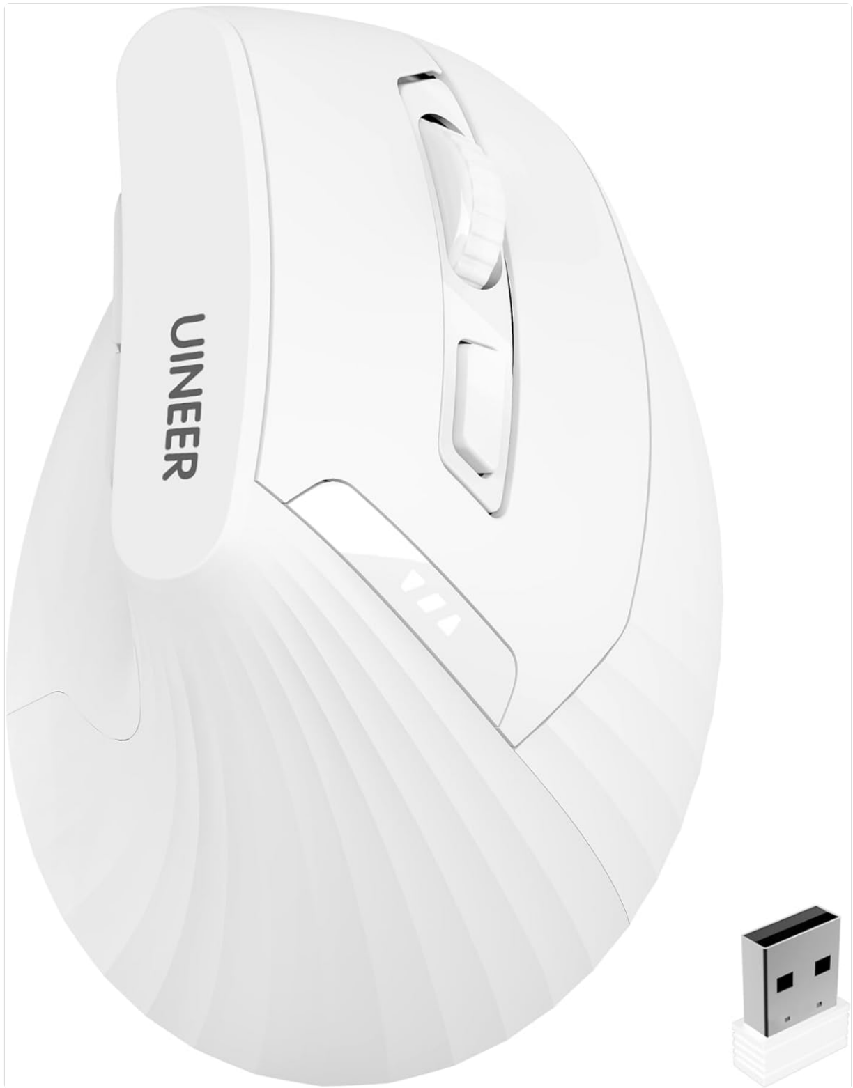
Figure 1: Uineer Vertical Wireless Mouse (White) with its USB receiver.