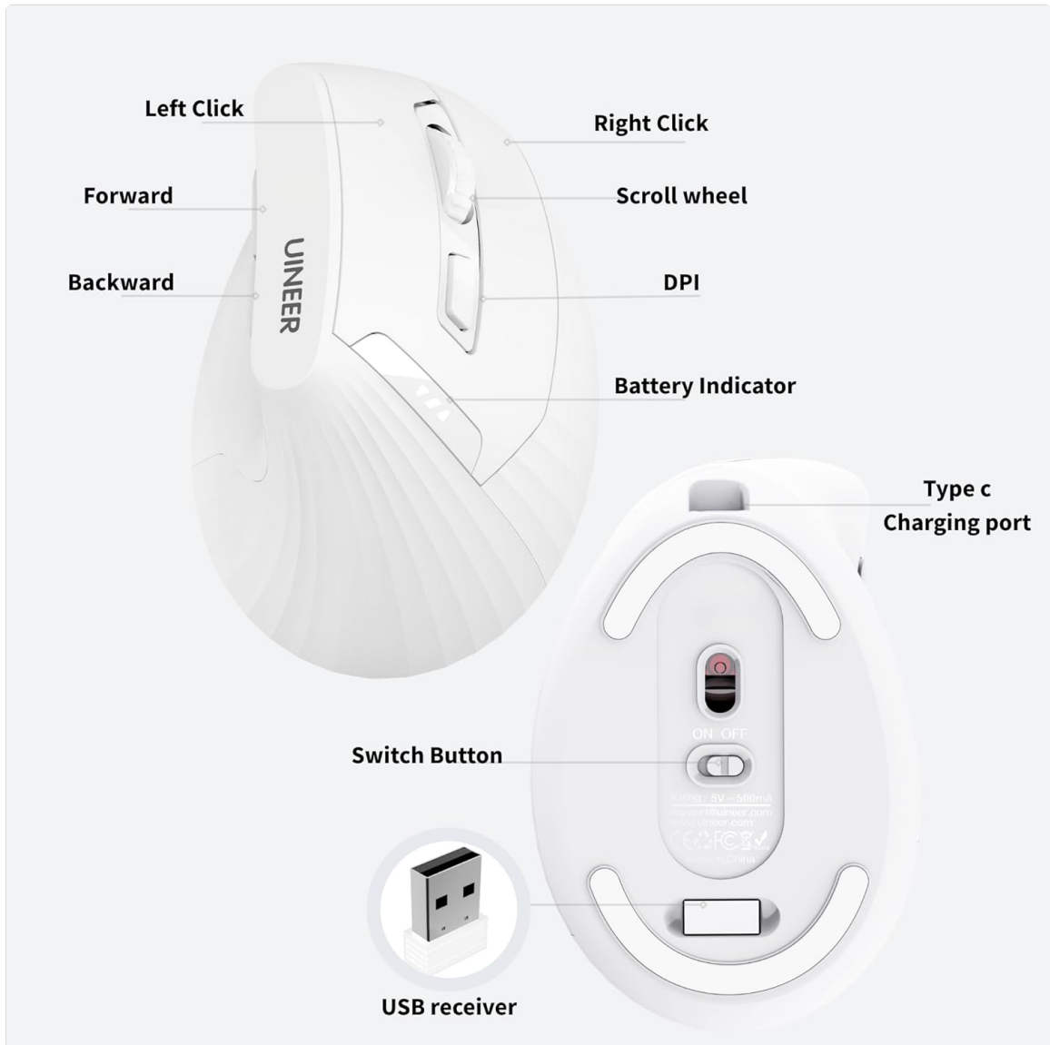
Figure 2: Bottom of the mouse, highlighting the USB receiver compartment and power switch.