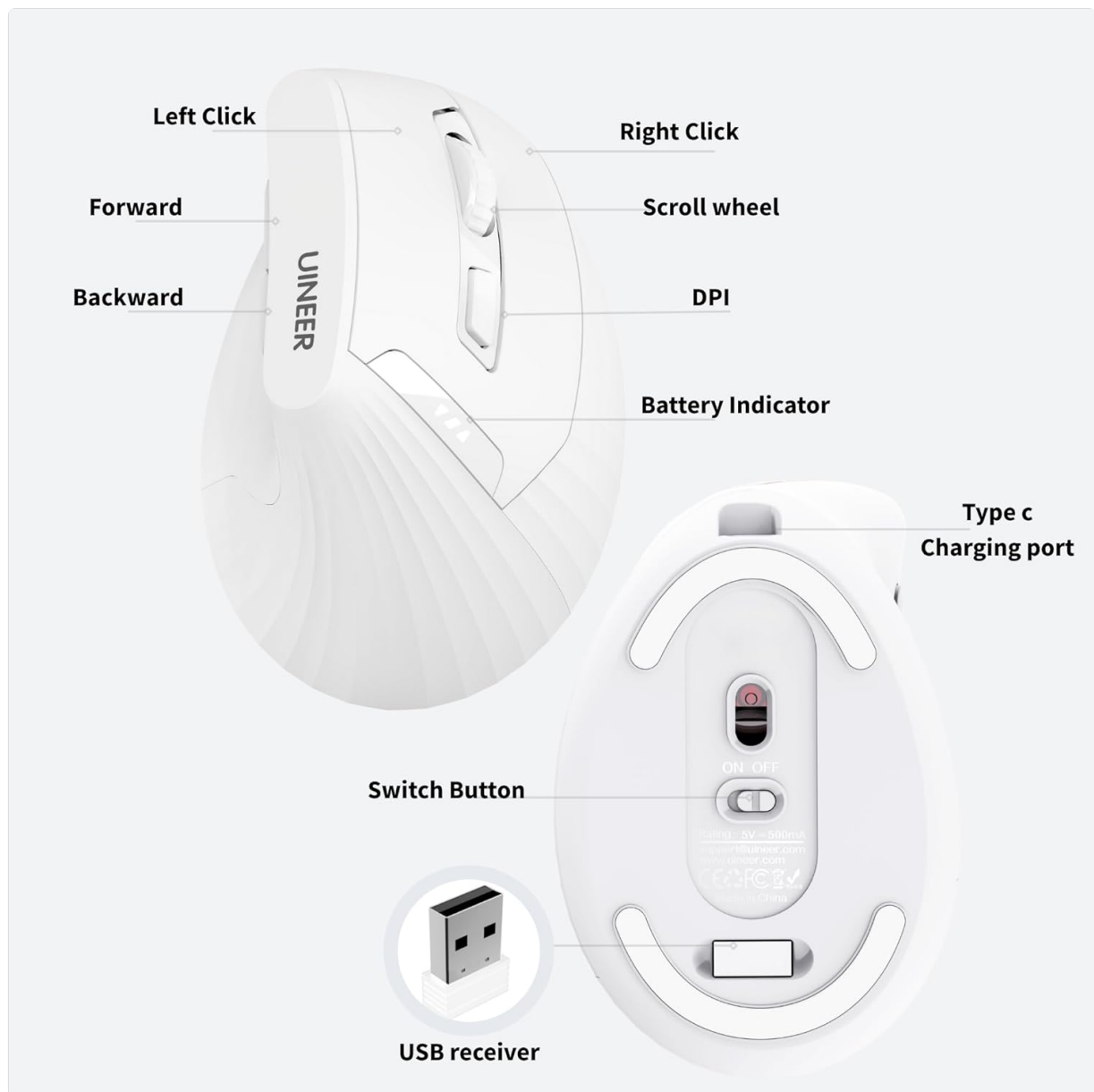
Figure 5: Detailed diagram of the mouse buttons and their functions.