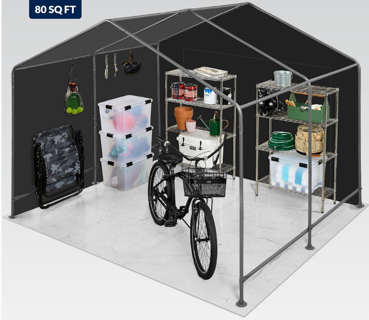
Image: Interior of the shed showcasing its 80 sq ft of ample storage space, accommodating bikes, storage bins, and shelving units.