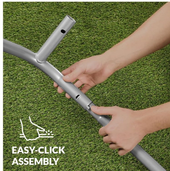
Image: Detailed view of shed components, highlighting stabilizing bungee cords, ground stakes, accessory hooks, and the easy-click assembly mechanism.