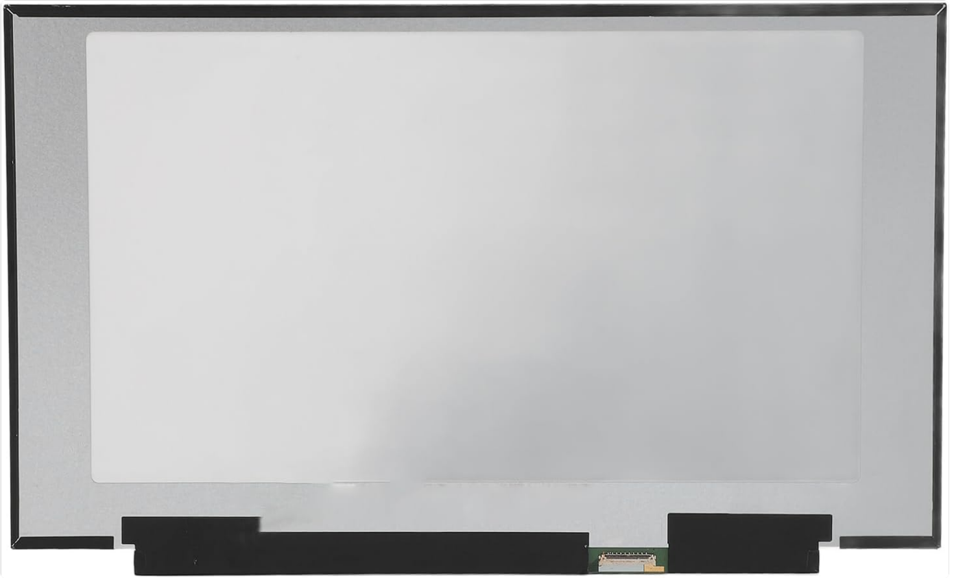
Image: The rear side of the LCD screen, revealing the protective backing and the location of the internal circuitry and connectors.