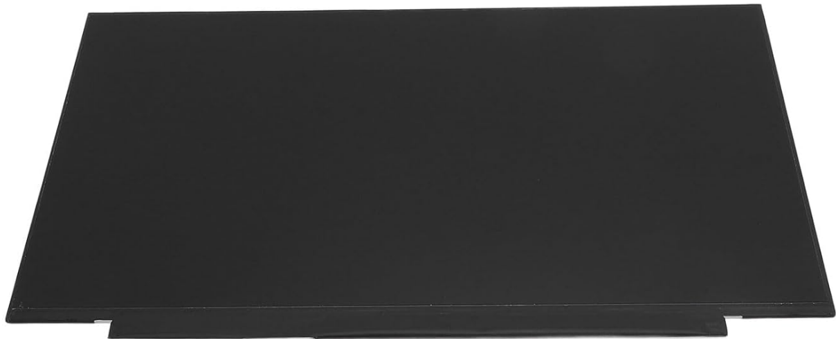
Image: The 15.6-inch LCD screen being prepared for installation into a laptop chassis. This screen is made of durable LCD material, designed for longevity and clear display.

This laptop LCD display screen is made of excellent LCD material, which is sturdy and abrasion resistant, not easy to be damaged, has a long service life, and displays clearly.