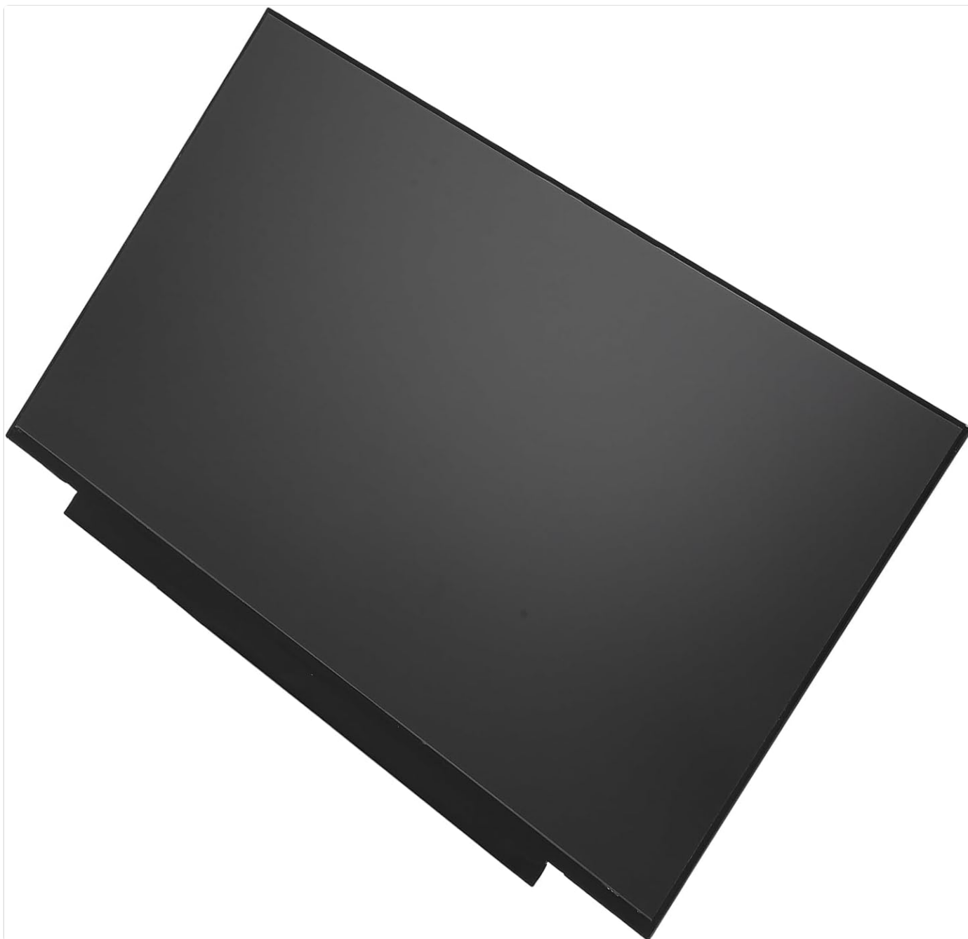
Image: An angled perspective of the 15.6-inch LCD screen, highlighting its slim profile and black border.