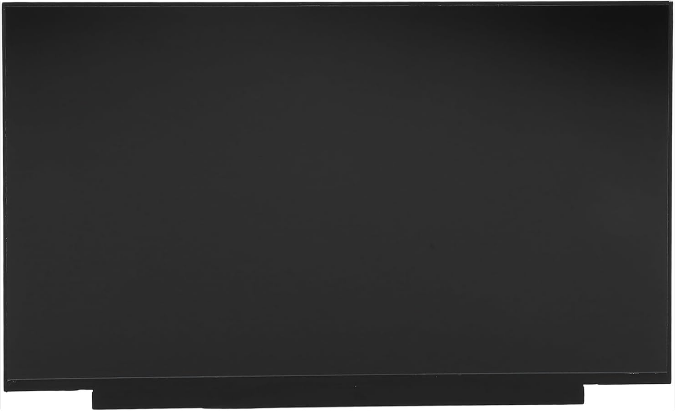
Image: The front surface of the 15.6-inch LCD screen, showcasing its sleek, black design. Regular gentle cleaning is recommended to maintain its clear display.