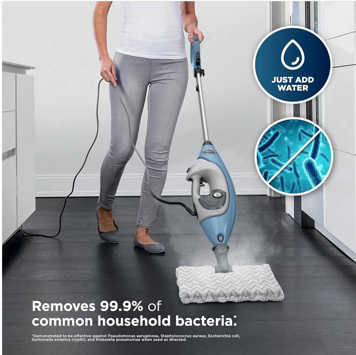
Image: The steam mop in action on a tiled floor, highlighting its ability to sanitize using only water.

Note: Always use distilled water to prevent mineral buildup and prolong the life of your steam mop. Do not add any cleaning solutions or chemicals to the water tank.