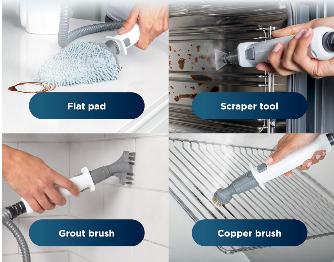
Image: A collage showcasing the detachable handheld cleaner being used with various tools, including the flat pad, scraper tool, grout brush, and copper brush, for different cleaning tasks.