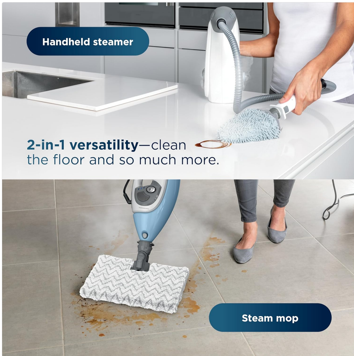
Image: Demonstrates the 2-in-1 versatility, showing the steam mop cleaning a floor and the handheld steamer cleaning a countertop.