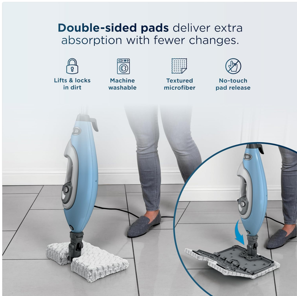
Image: The steam mop head with a double-sided Dirt Grip pad attached, demonstrating the easy attachment and release mechanism.