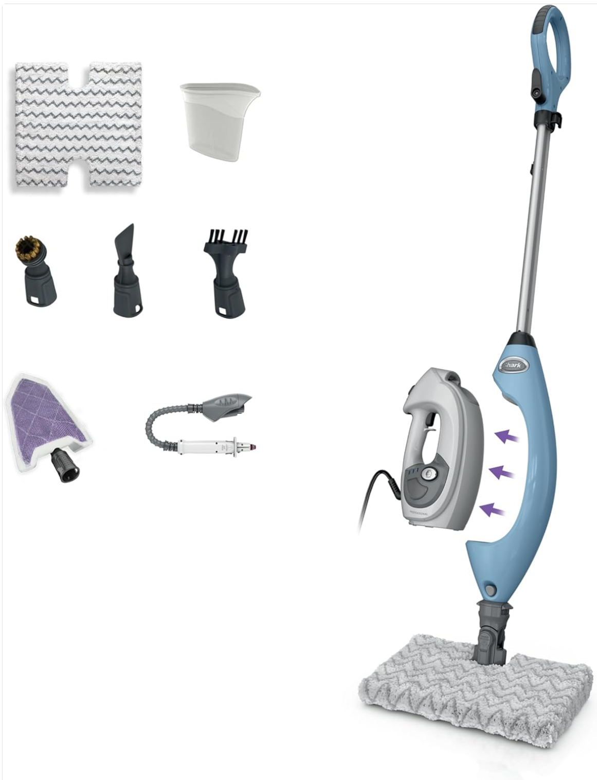
Image: Overview of the Shark Lift-Away 5-in-1 Steam Mop and its various components, including the main unit, mop head, and several attachments.