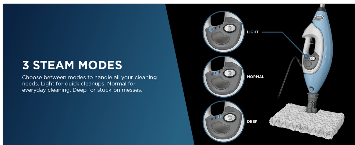
Image: Visual representation of the three steam modes (Light, Normal, Deep) and how to select them on the steam mop's control panel.