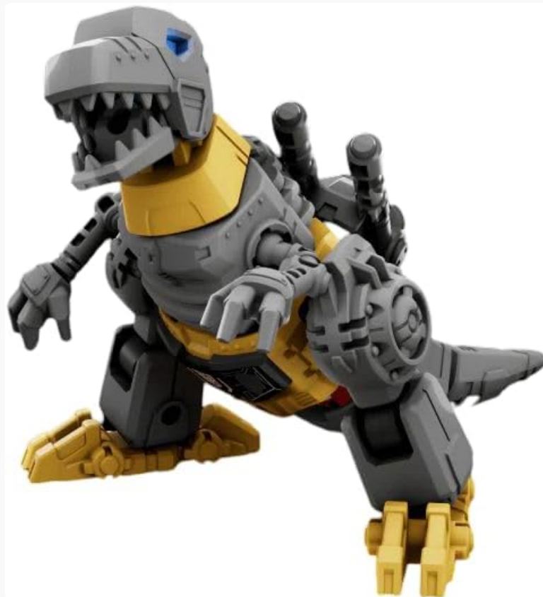
Figure 5: An assembled Grimlock figure in dinosaur mode, showcasing its alternate form.