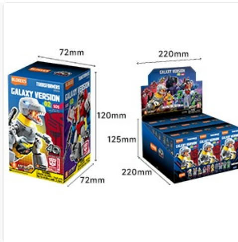
Figure 6: Dimensional overview of the individual BLOKEES kit box and the larger display box.