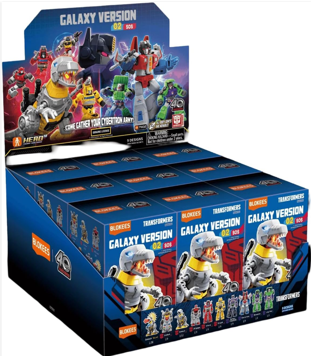
Figure 2: A display box containing multiple BLOKEES Transformers Galaxy Version 02 SOS kits, illustrating the variety of characters available.