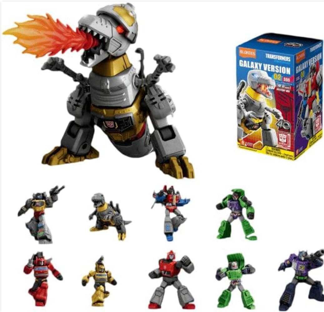
Figure 1: Example of a BLOKEES Transformers Galaxy Version 02 SOS kit, showing the Grimlock figure and its individual packaging.