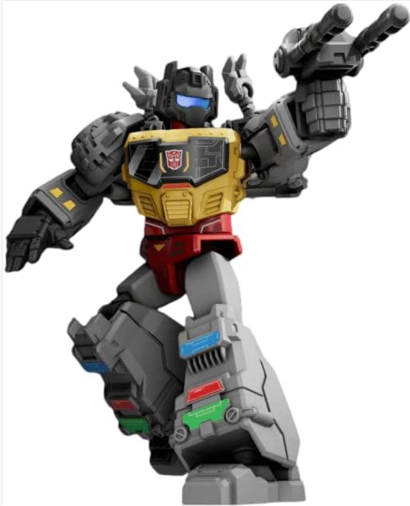
Figure 4: An assembled Grimlock figure in robot mode, demonstrating articulation and poseability.