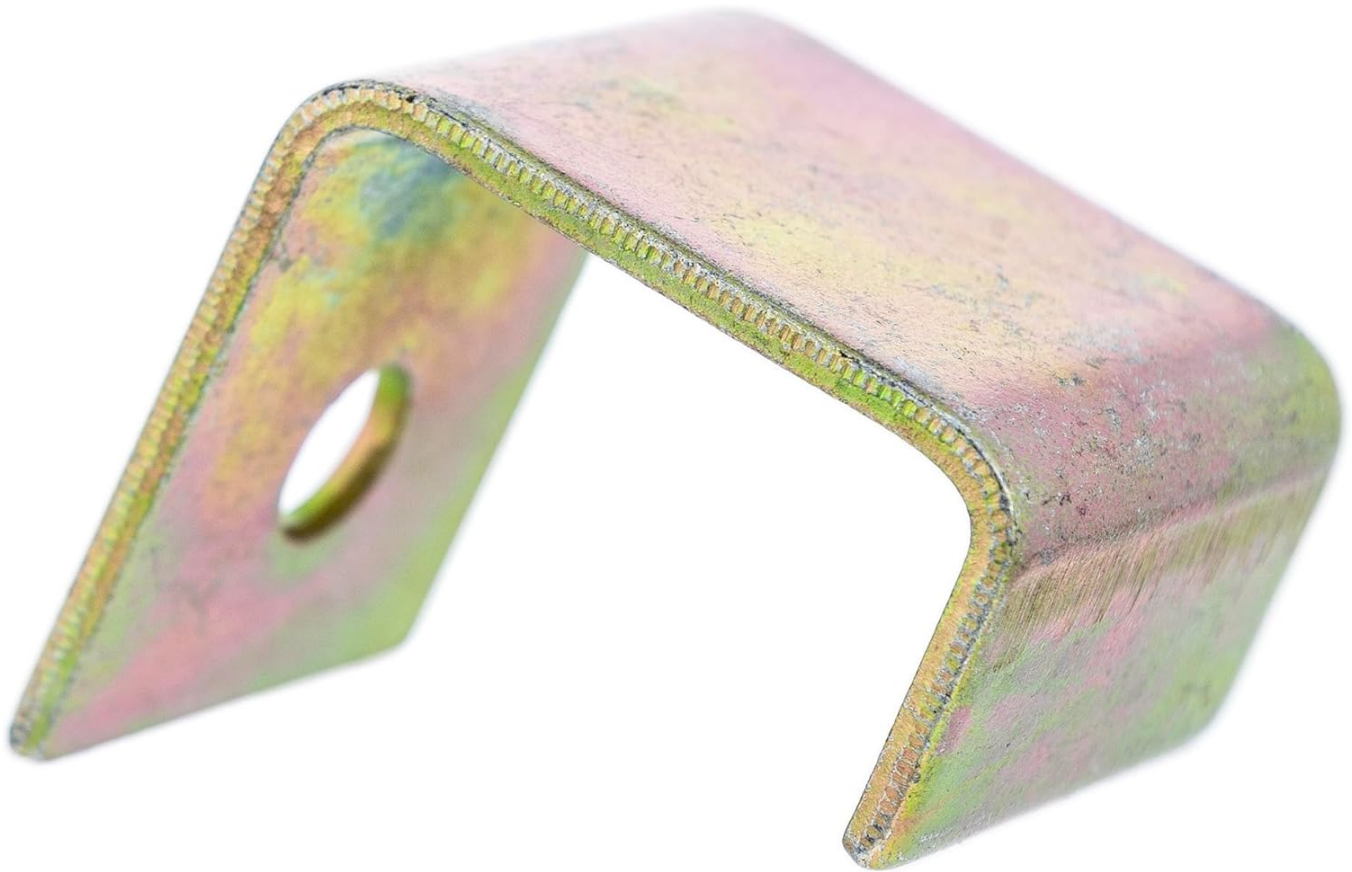
Angled view of the bracket, illustrating its U-shaped design for secure rod placement.

The Rod Stop Bracket (Part Number 01004109) is a metal component designed to secure and limit the movement of rods within compatible Cub Cadet equipment. It replaces prior MPN 01004863 and is crucial for maintaining the correct operation of various mechanical linkages.