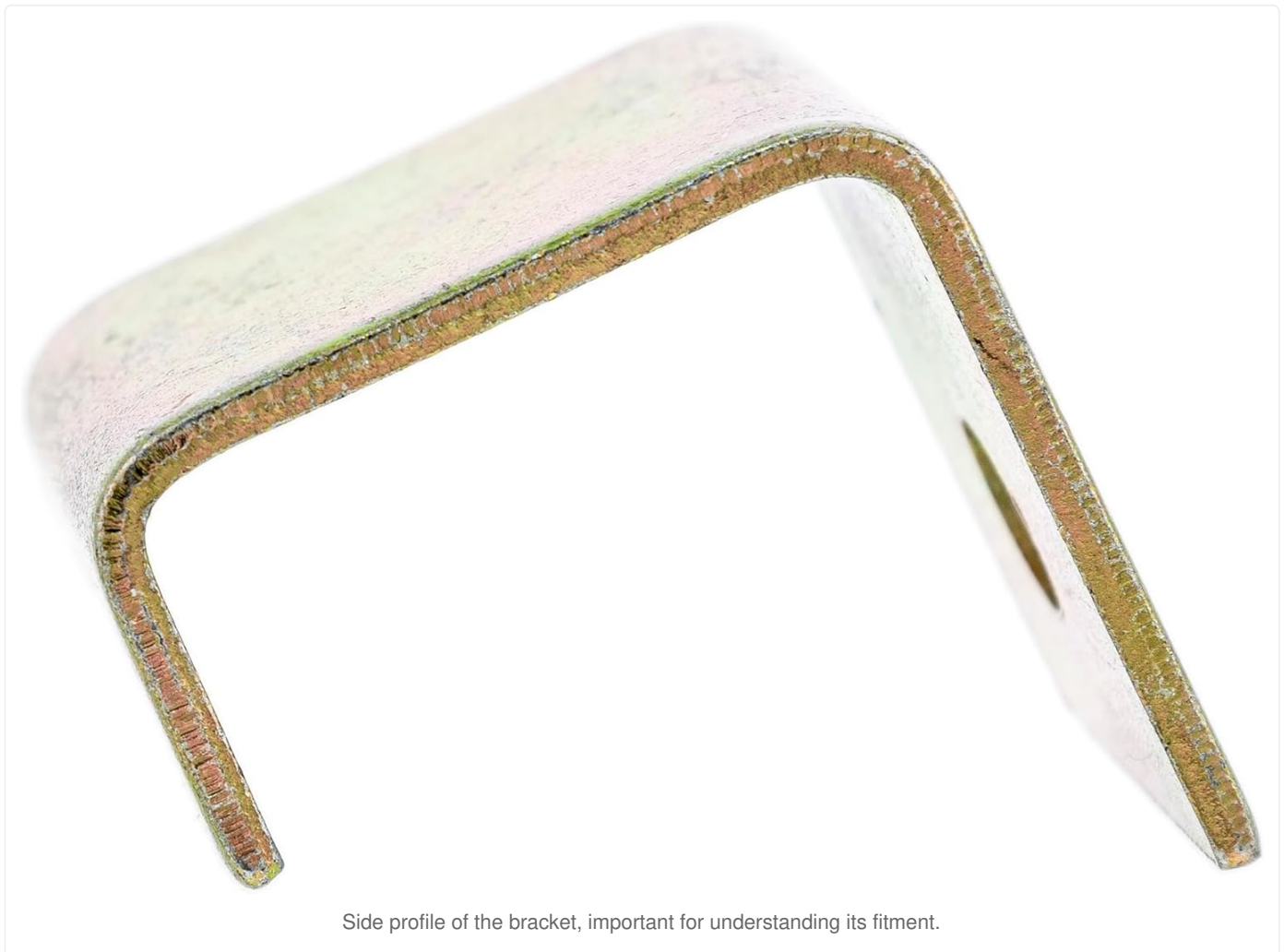
Side profile of the bracket, important for understanding its fitment.