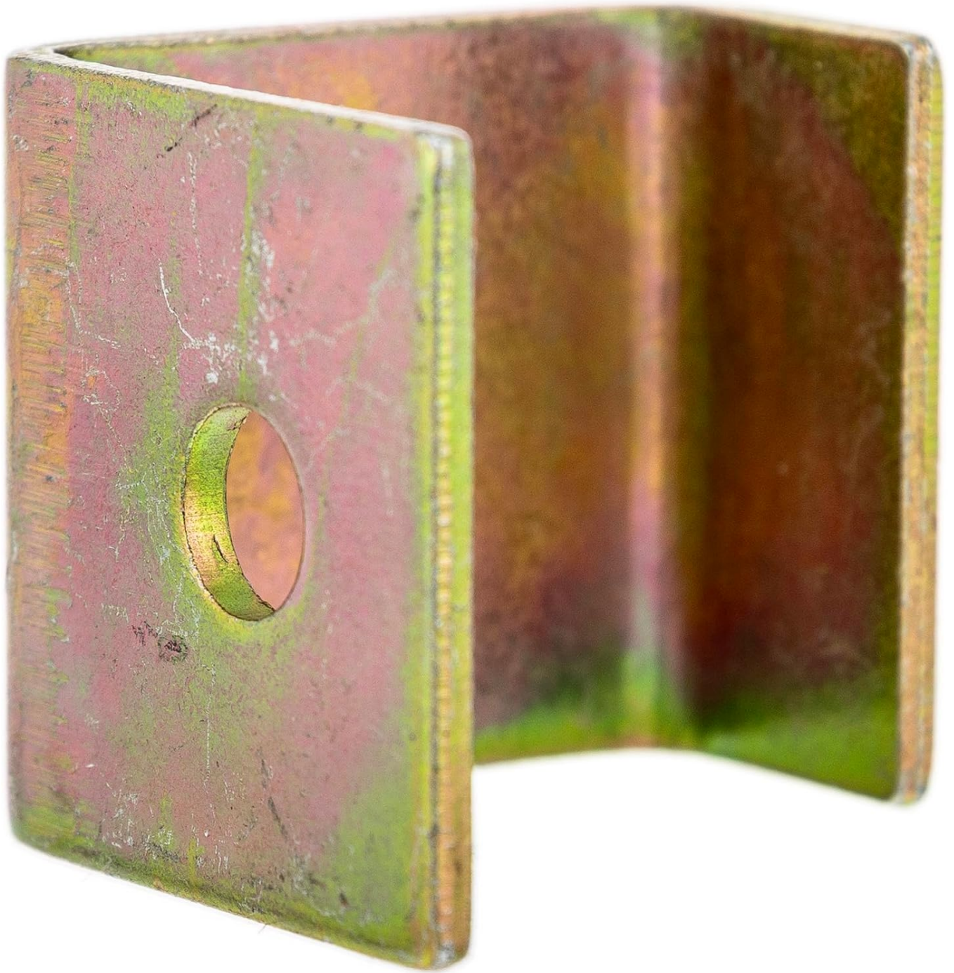
Front view of the CUB CADET OEM Rod Stop Bracket, highlighting the central mounting hole.