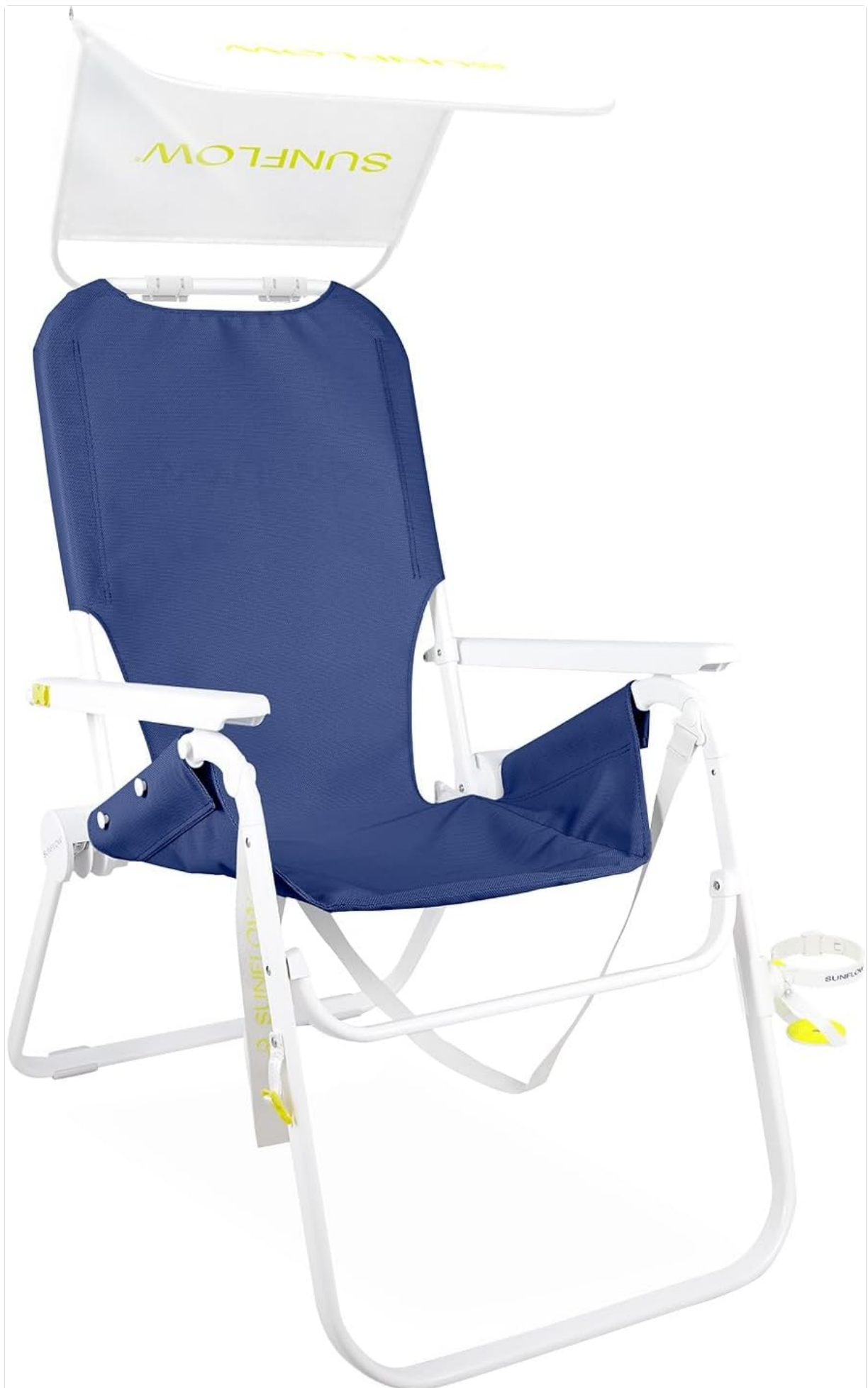
Image: The SUNFLOW Tall Sand Dune Premium Beach Chair in Ocean Navy, fully assembled and ready for use.