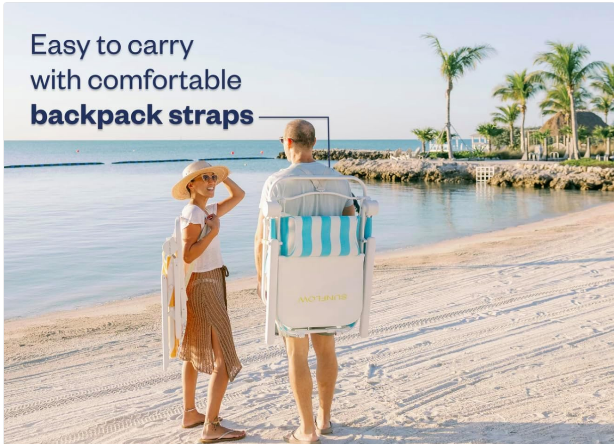
Image: The chair folded and carried using its backpack straps, demonstrating portability.

To fold the chair, remove any attached accessories (sunshade, drink holder). Lift the armrests and push the backrest forward while simultaneously pulling the front and back legs together. The chair will collapse into a compact form. Secure the chair with any integrated straps if available.