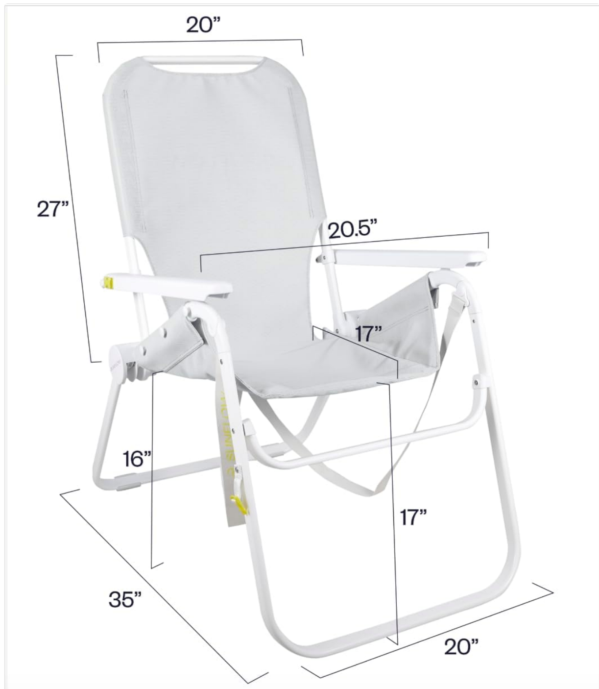
Image: Unfolded chair dimensions, illustrating the chair's open configuration.