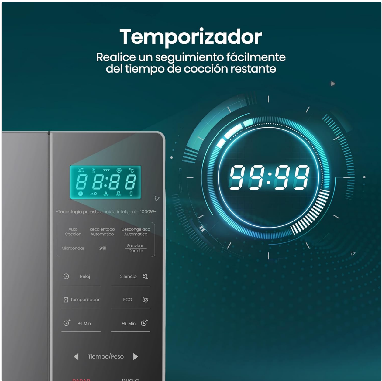
Image 5.5: The microwave display showing a countdown timer, indicating the remaining cooking time.