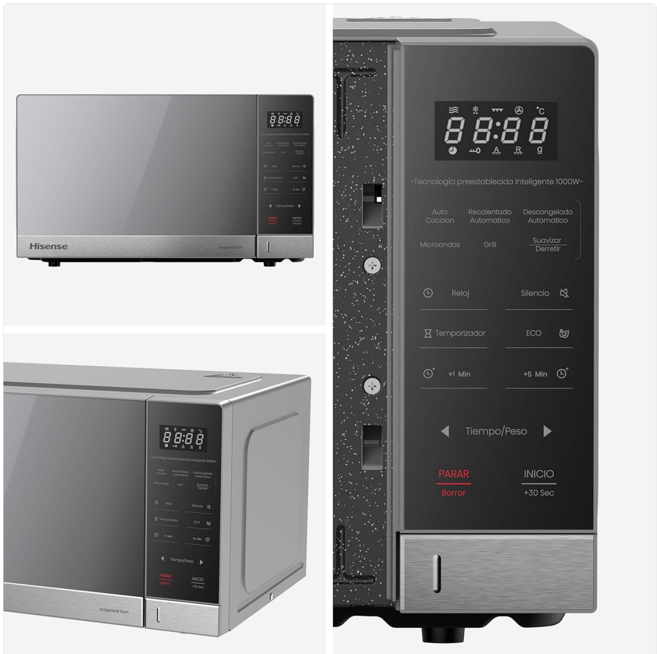
Image 3.3: Close-up view of the microwave's control panel and interior, highlighting the digital display and function buttons.