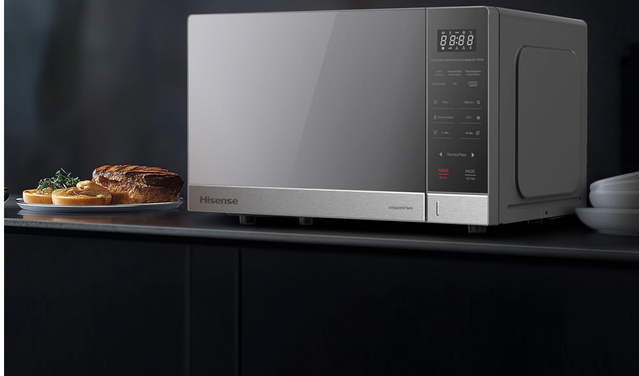
Image 5.7: The microwave oven with a shield icon overlay, representing the child lock feature, ensuring safety for families.