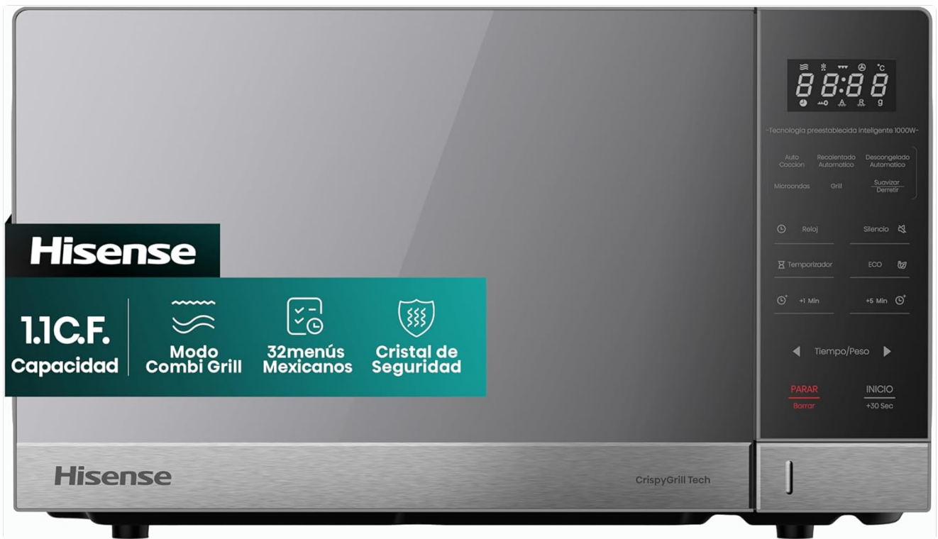
Image 3.1: Front view of the Hisense HMMG3010SMG Microwave Oven, showcasing its sleek design and control panel.