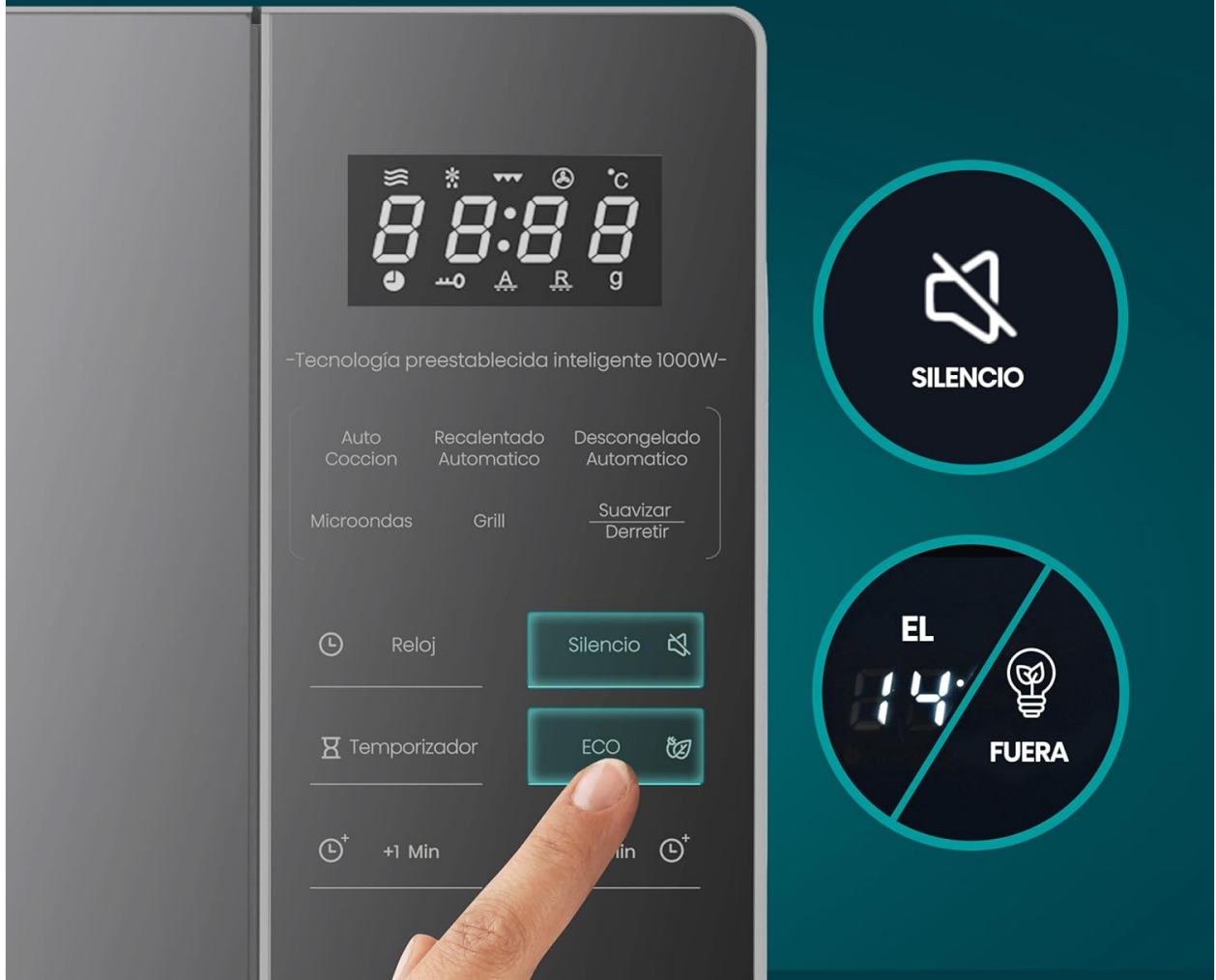
Image 5.6: The control panel highlighting the "Silence" and "ECO" buttons, with icons indicating their functions.