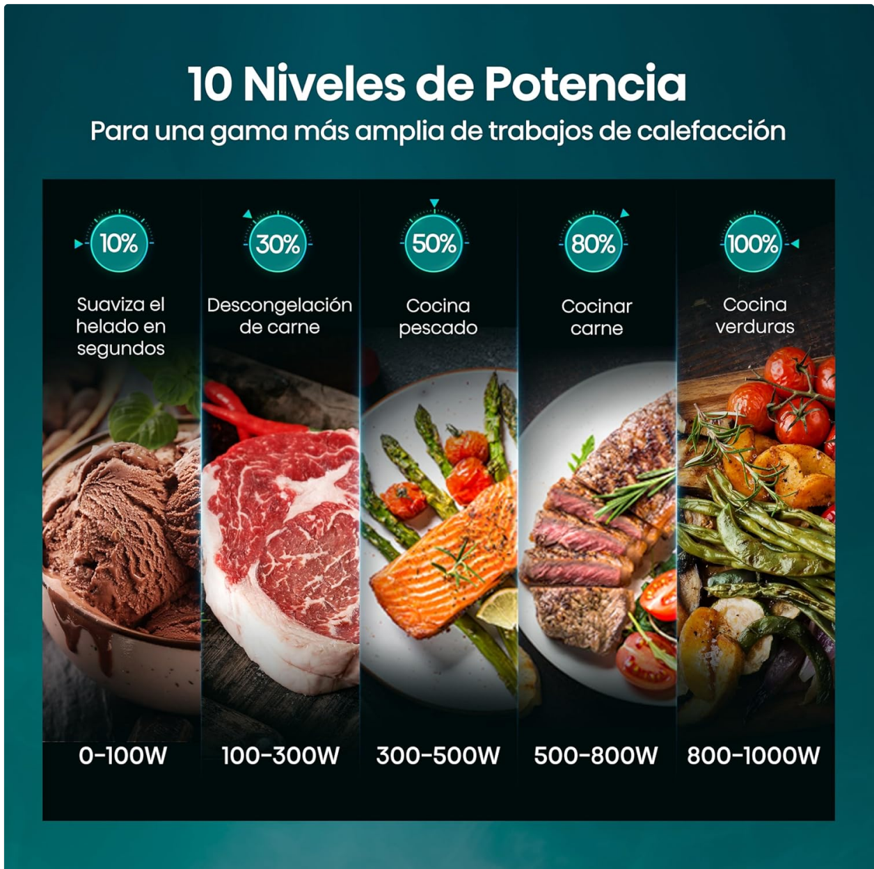
Image 5.1: Visual guide to the 10 power levels, ranging from 10% (0-100W) for softening ice cream to 100% (800-1000W) for cooking vegetables.