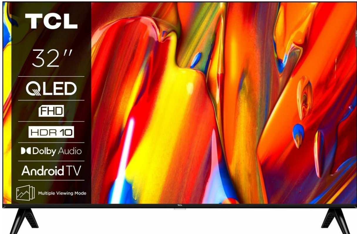
Image: Front view of the TCL 32V5C Smart QLED Full HD Android TV, showcasing its slim design and display features.