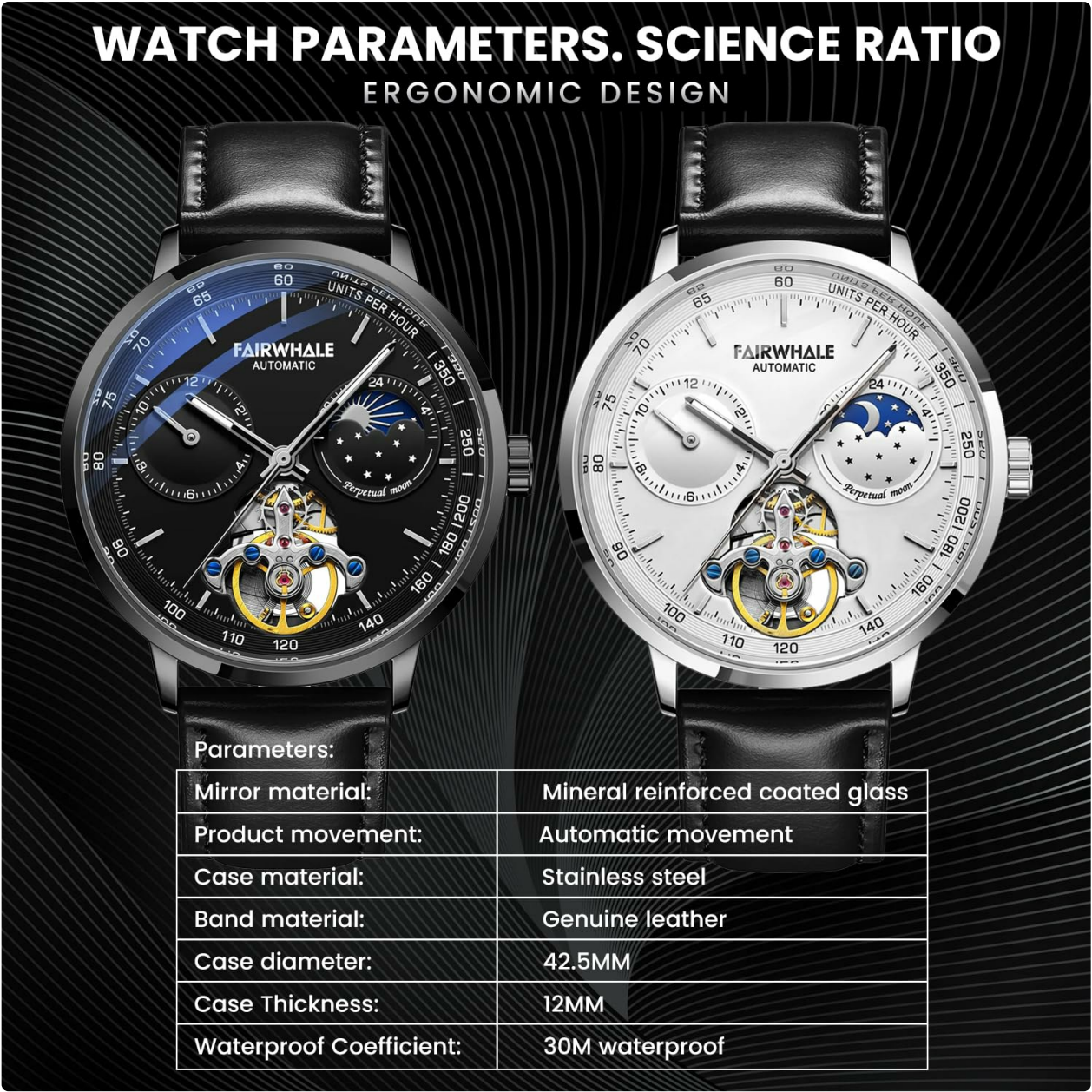
Image: Visual representation of watch parameters and specifications.