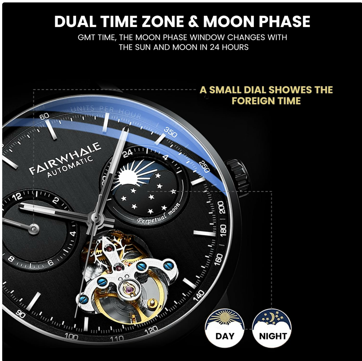
Image: Detailed view of the watch dial highlighting Dual Time Zone and Moon Phase features.