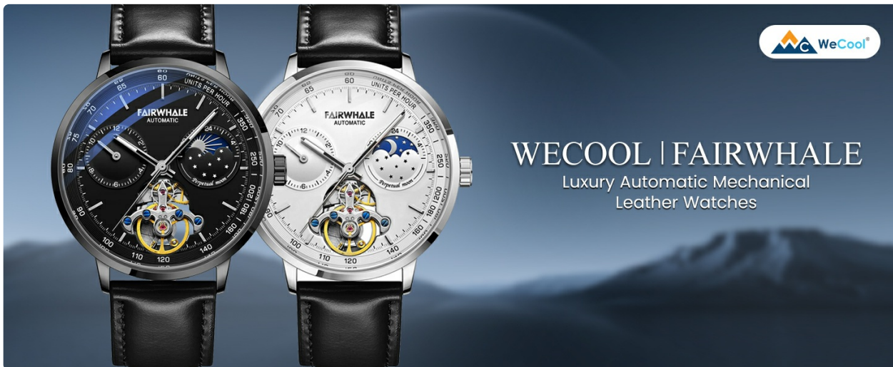
Image: WeCool Fairwhale Luxury Automatic Mechanical Leather Watches.

Thank you for choosing the WeCool Fairwhale Automatic Mechanical Watch. This timepiece combines precision engineering with elegant design, featuring a skeleton dial, automatic movement, and robust construction. This manual provides essential information for the proper setup, operation, and maintenance of your watch to ensure its longevity and accurate performance.