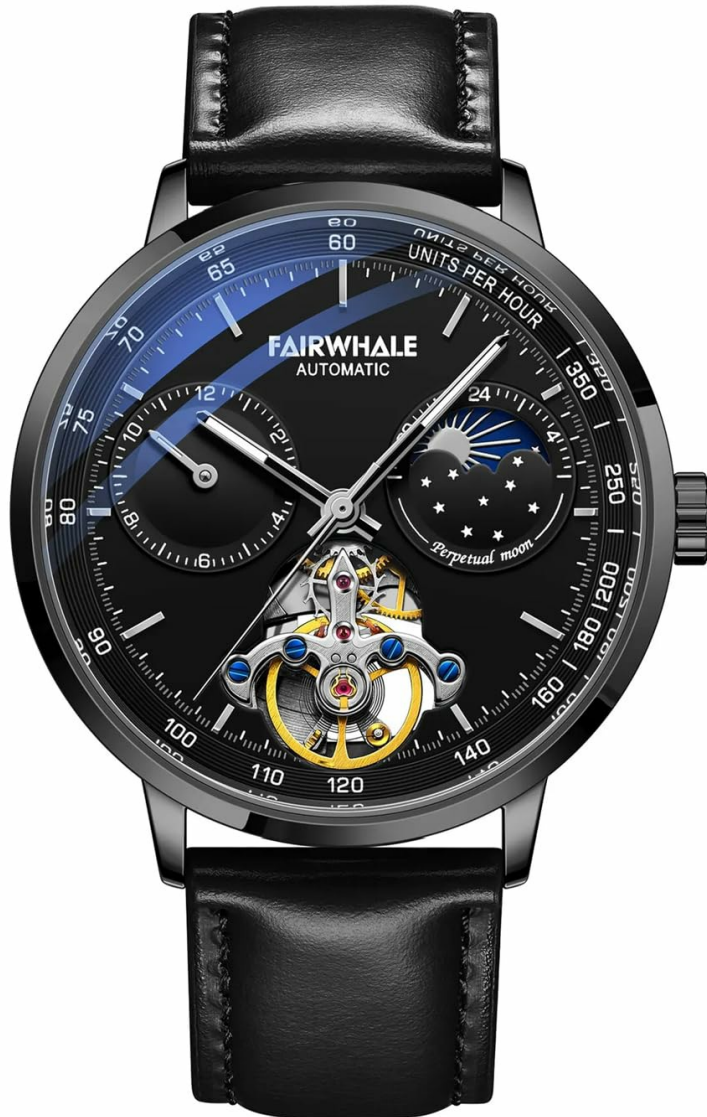
Image: Front view of the WeCool Fairwhale Automatic Mechanical Watch.