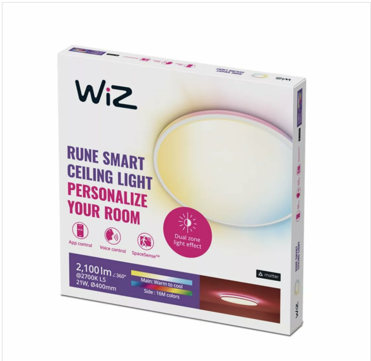
Image: The retail packaging for the WiZ Rune Smart Ceiling Light, highlighting its features like app control, voice control, SpaceSense, and dual zone light effect.