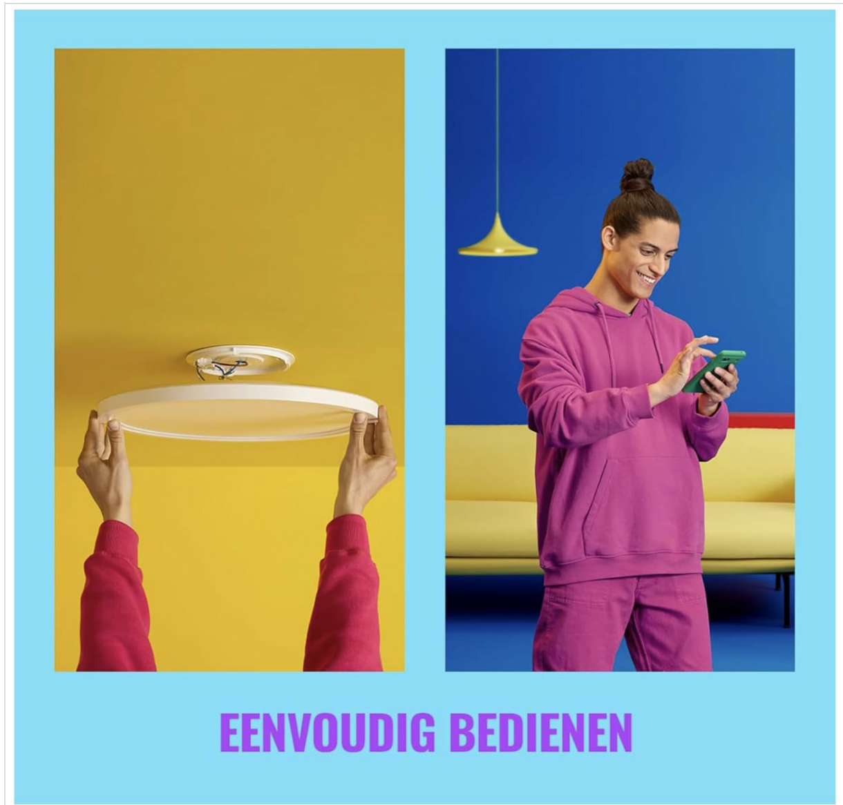
Image: A visual representation of the easy installation process and simple control methods for the WiZ Rune Ceiling Light.