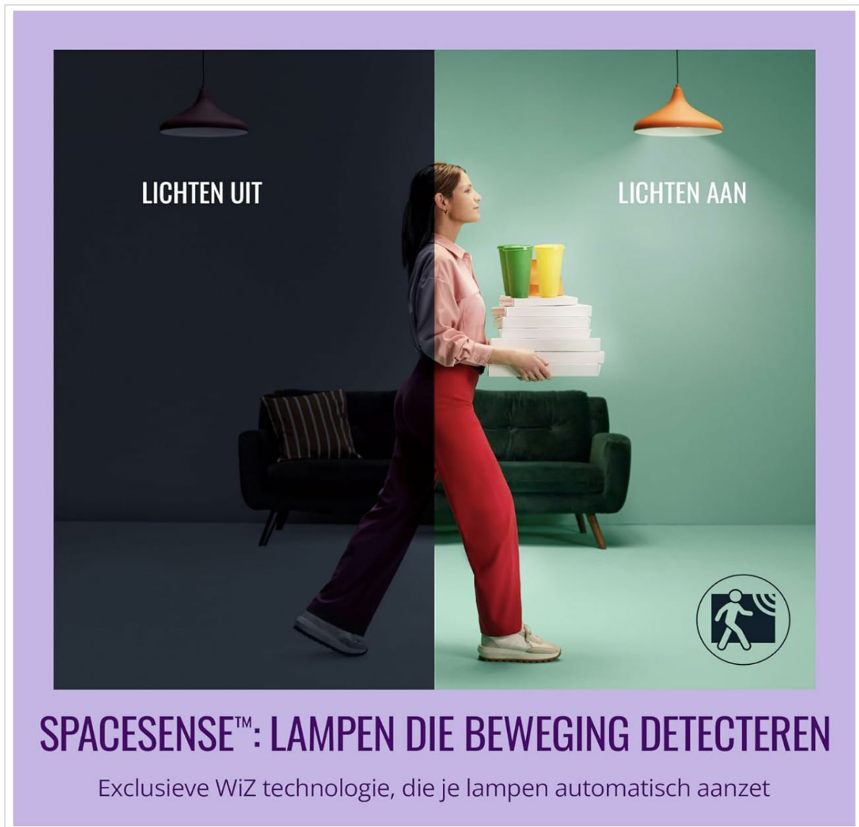
Image: Illustration of the SpaceSense™ feature, showing lights turning on when movement is detected and off when the room is empty.

The WiZ Rune Ceiling Light features SpaceSense™ technology, which uses Wi-Fi signals to detect movement in a room without the need for additional sensors. This allows the light to automatically turn on when you enter and off when you leave, enhancing convenience and energy efficiency.