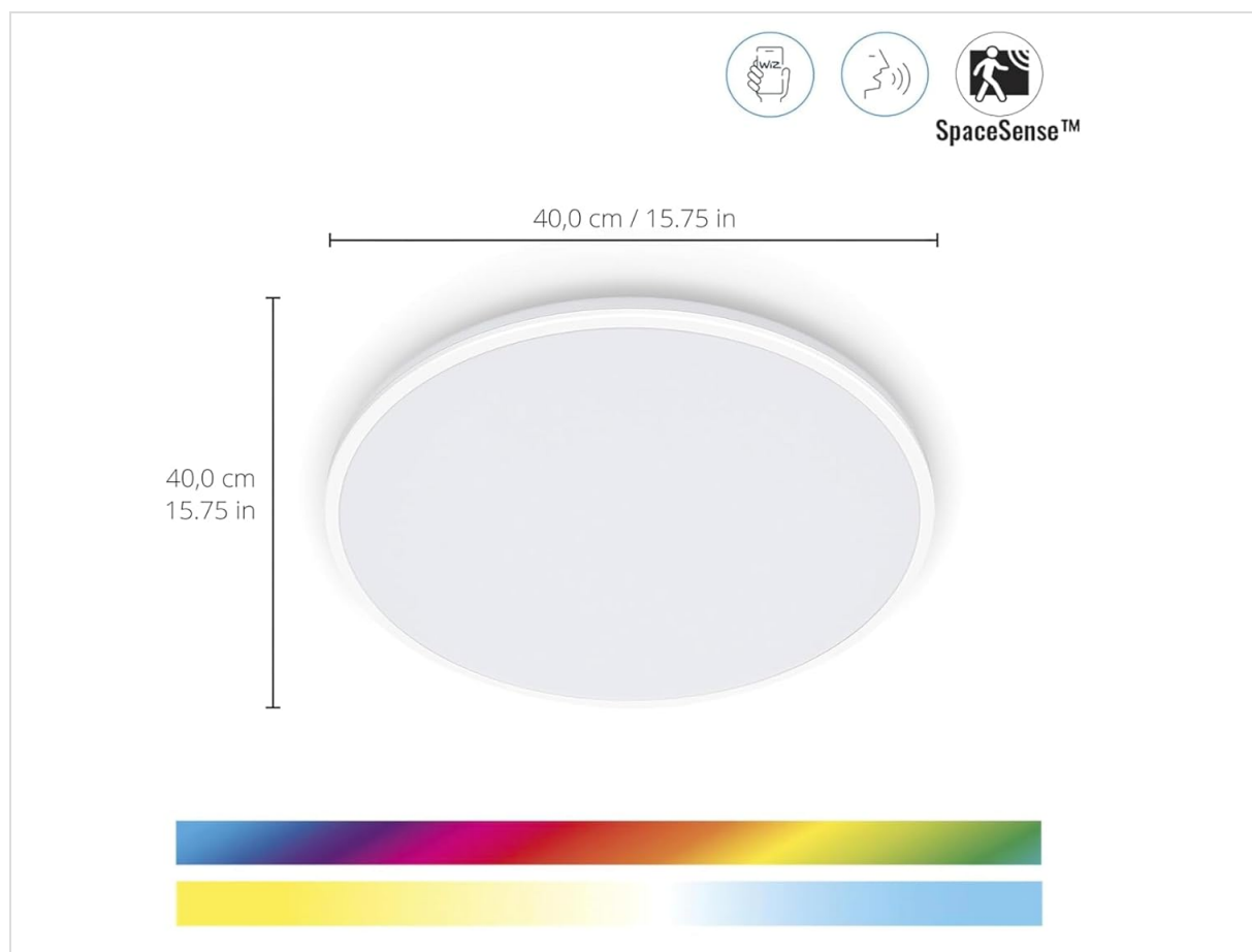
Image: Technical drawing showing the dimensions of the WiZ Rune Ceiling Light, measuring 40.0 cm (15.75 inches) in diameter.