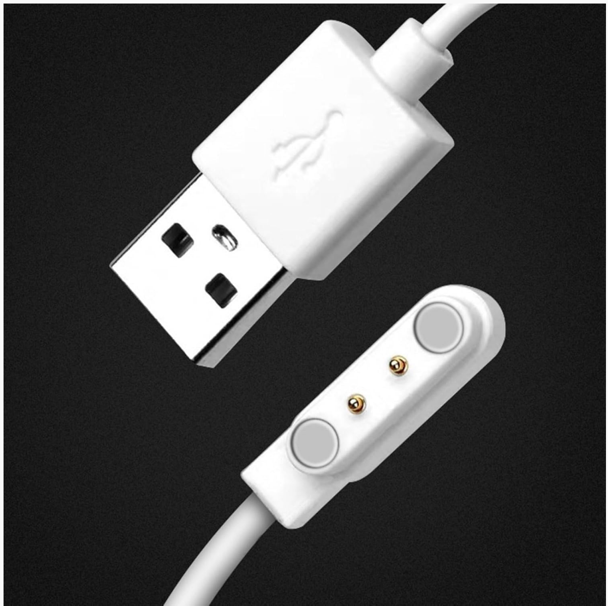
Image: The magnetic charging cable connected to a laptop's USB port, illustrating a common charging setup.