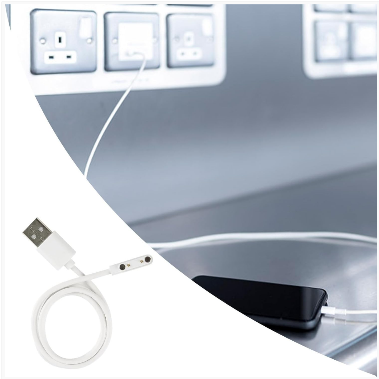
Image: The magnetic charging cable connected to a USB wall adapter, ready to charge a device.