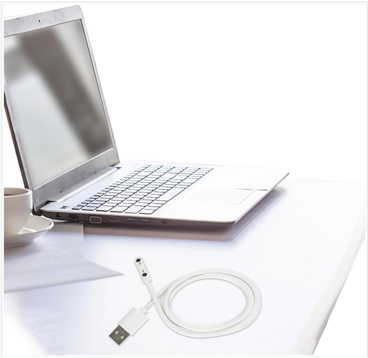
Image: The magnetic charging cable coiled, showing its compact design.