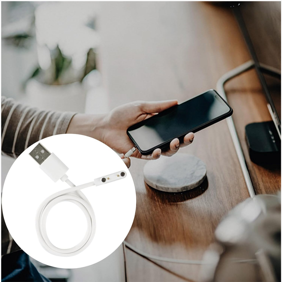
Image: A close-up view of the USB-A connector and the magnetic 2-pin charging head of the cable.