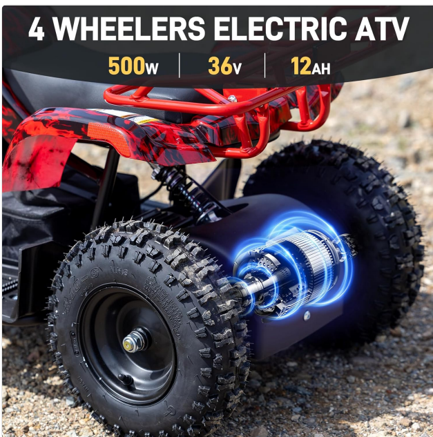
Image: Illustration of the 500W electric motor and rear wheel assembly.