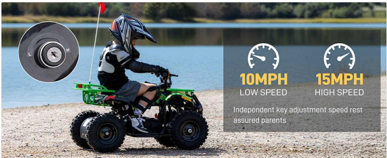
Image: Visual representation of the 10 MPH (Low Speed) and 15 MPH (High Speed) settings for parental control.

The ATV is designed for various terrains, including flat ground, grass, sand, and light mud. Avoid extremely rough terrain, steep slopes, or deep water to prevent damage and ensure rider safety.