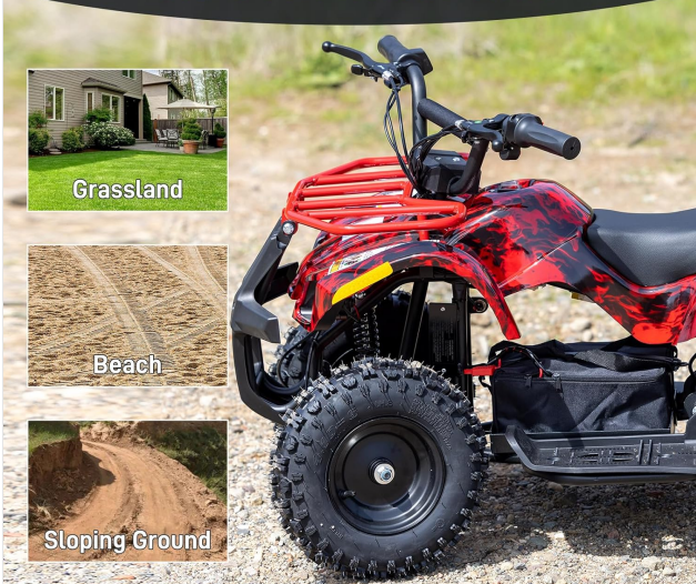
Image: The ATV's pneumatic tires are suitable for diverse terrains including grassland, sand, and sloping ground.