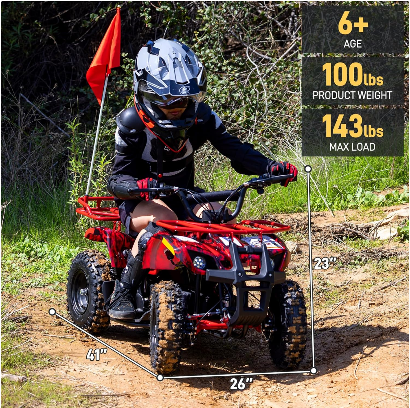
Image: Visual representation of the ATV's dimensions and weight capacities.