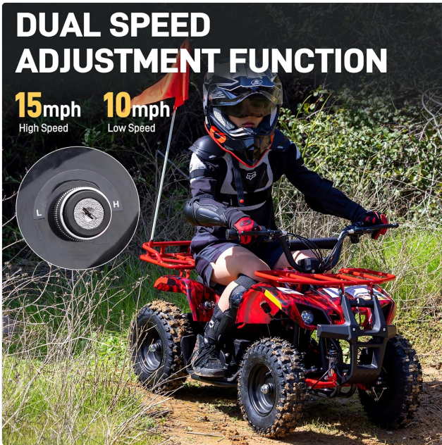
Image: Speed adjustment dial for selecting 10 MPH (Low) or 15 MPH (High) settings.