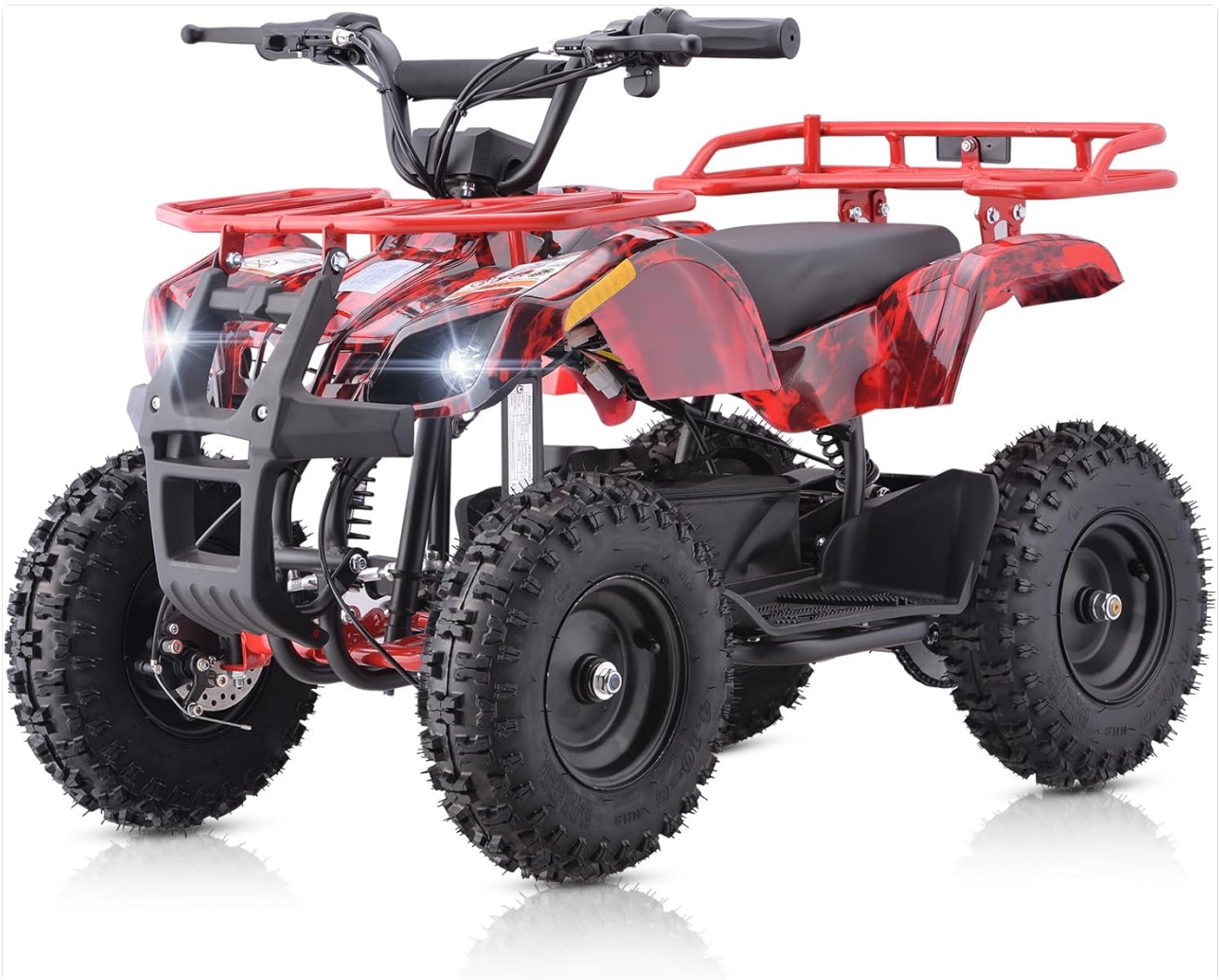
Image: The SUNDERWELL Electric ATV 4 Wheeler in Red Flame color, showcasing its design and features.