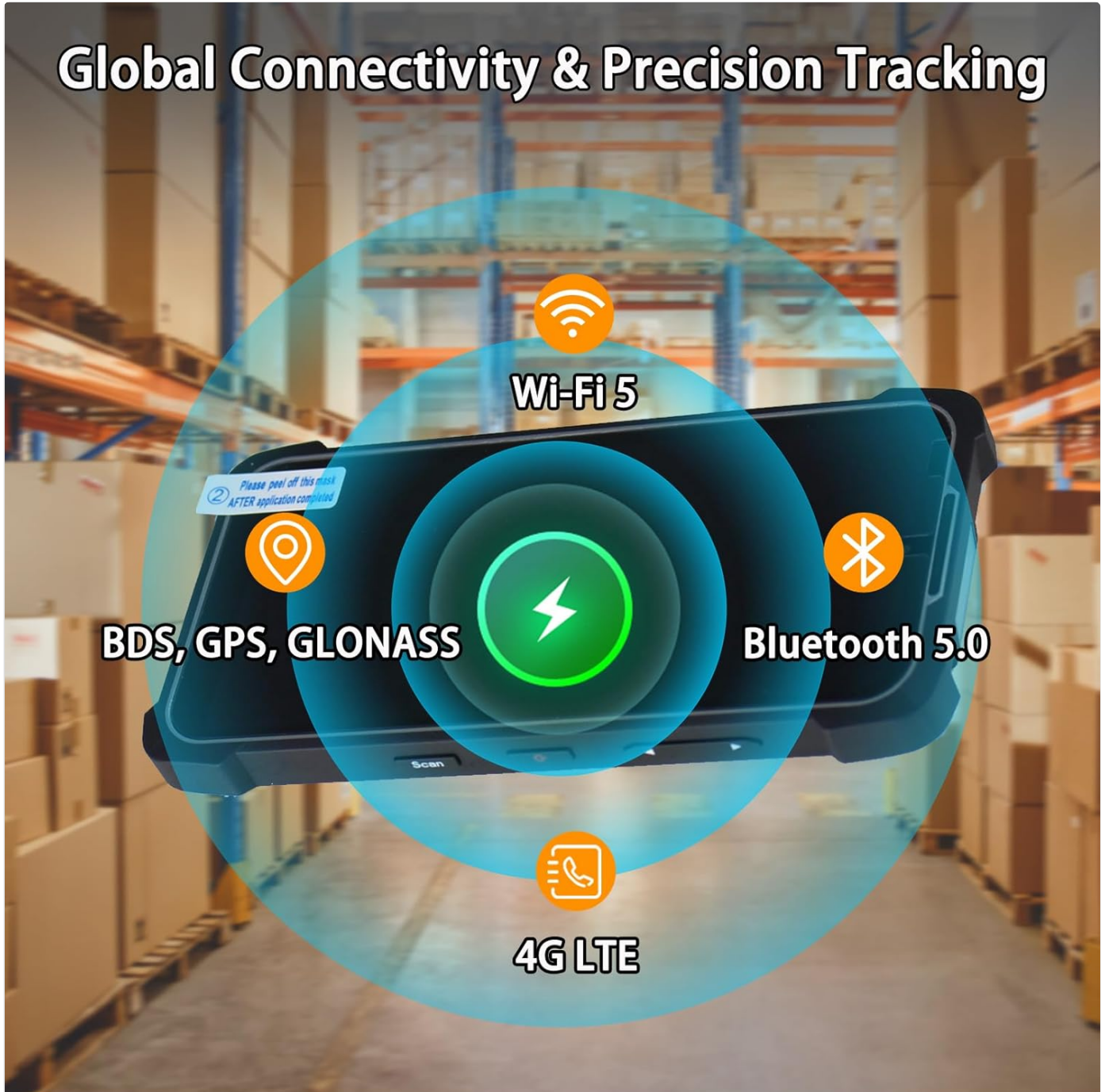
Figure 4: Visual representation of the SM5-T's global connectivity features, including Wi-Fi 5, Bluetooth 5.0, 4G LTE, and multi-system GPS (BDS, GPS, GLONASS).