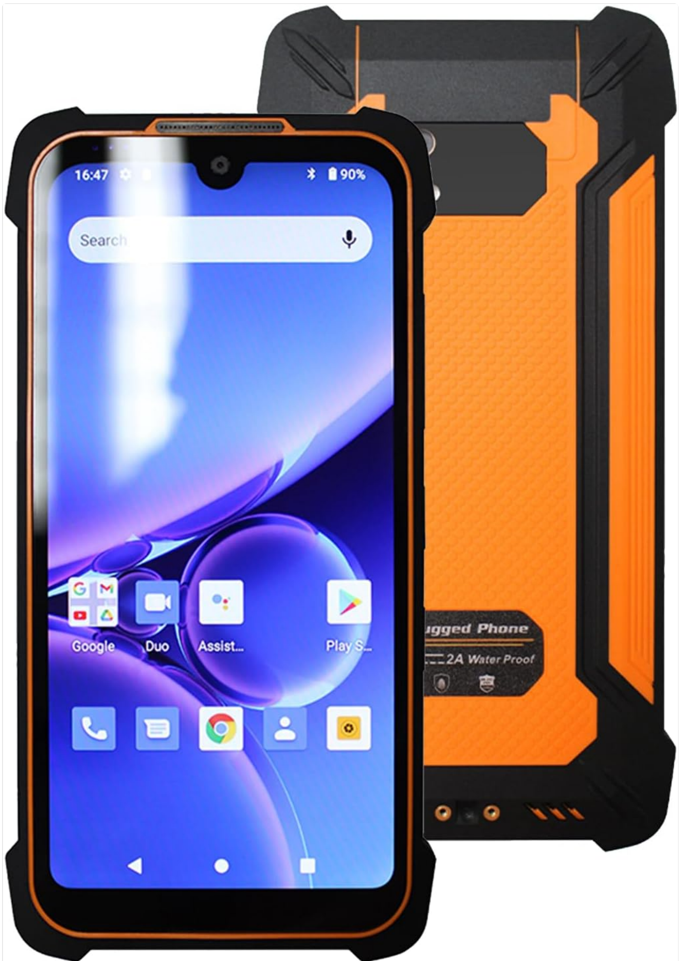
Figure 1: Front and rear view of the Breloom SM5-T Handheld Terminal, showcasing its rugged design and display.