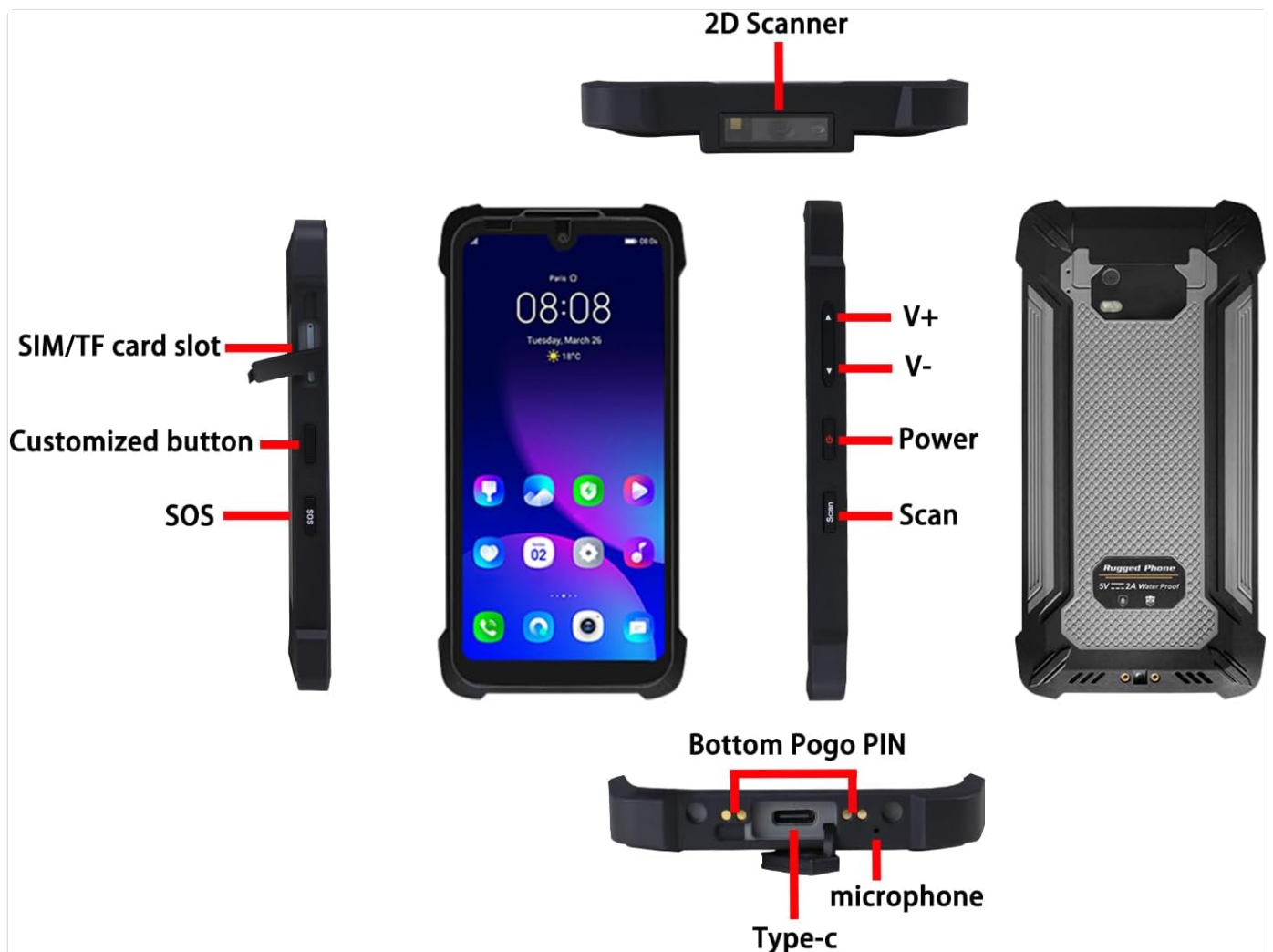
Figure 2: Diagram illustrating the various ports, buttons, and features of the SM5-T, including SIM/TF card slot, customized button, SOS button, volume controls, power button, scan button, Type-C port, microphone, and bottom Pogo PIN.

Familiarize yourself with the physical components and ports of the SM5-T terminal.