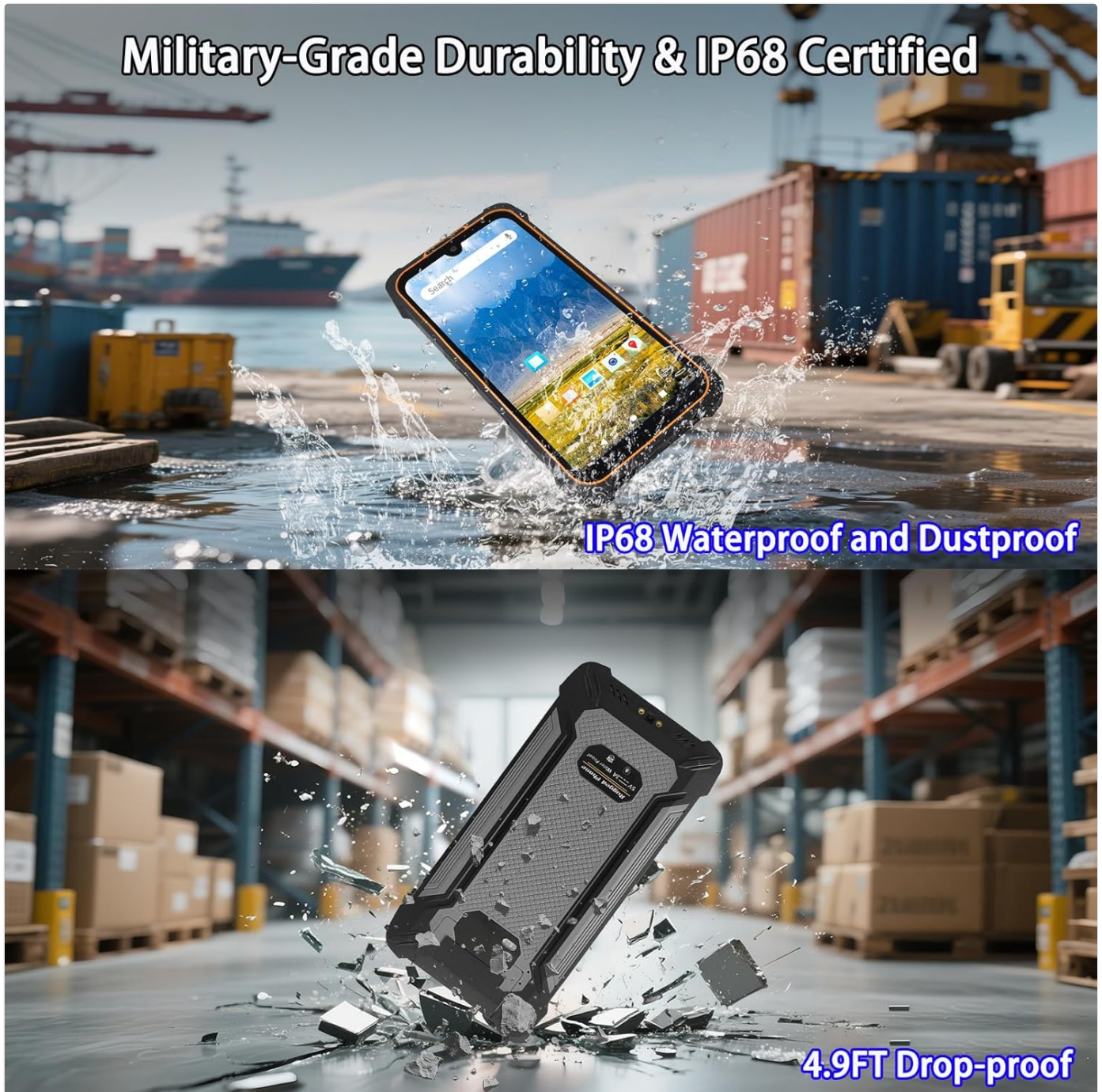
Figure 6: Visual demonstration of the SM5-T's IP68 waterproof and dustproof capabilities, and its ability to withstand 4.9ft (1.5m) drops, meeting military-grade durability standards.