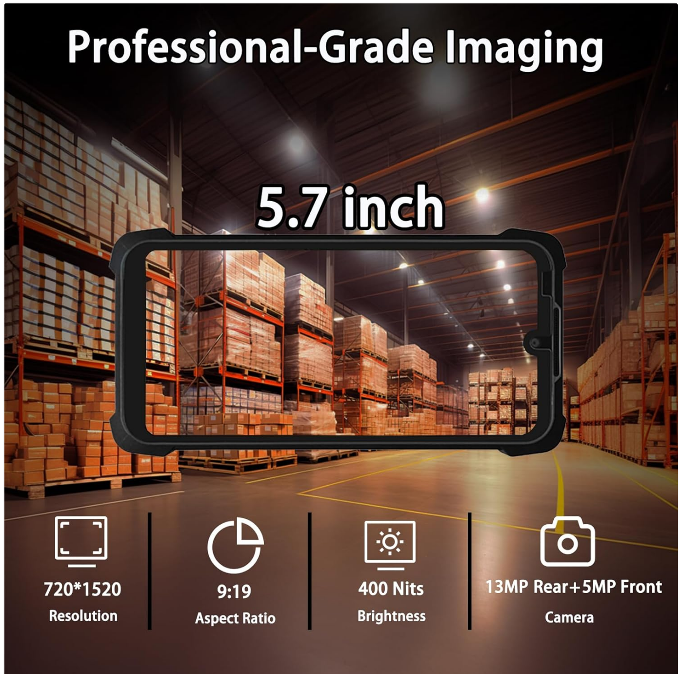
Figure 5: Details on the 5.7-inch HD display (720x1520 resolution, 400 nits brightness) and camera specifications (13MP rear + 5MP front).

screen or app drawer to capture photos and videos. The cameras are suitable for documentation, asset verification, and video calls.