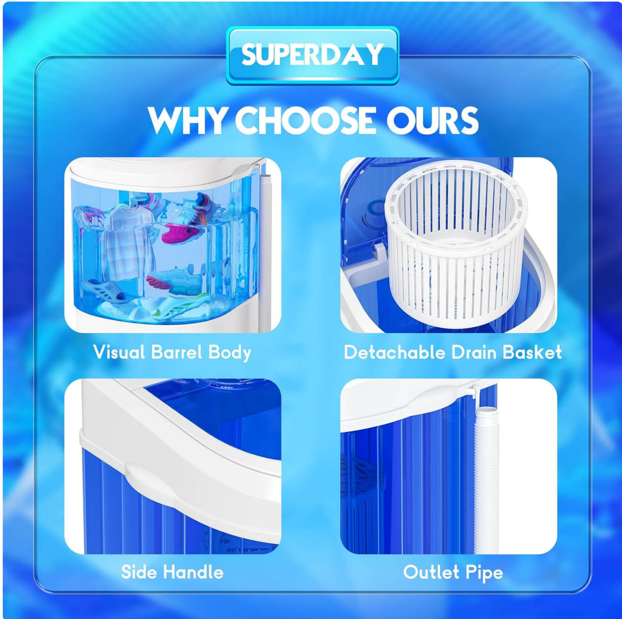
Image 3.1: Key features and components of the Superday Mini Portable Washing Machine.

Familiarize yourself with the components of your portable washing machine: