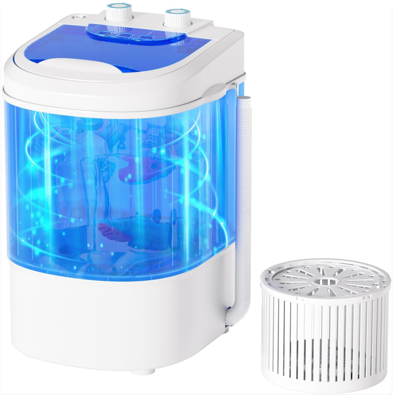
Image 1.1: Superday Mini Portable Washing Machine with its detachable spin basket.