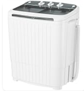
Image 5.2: Operational steps and benefits, including the detachable drainage basket.