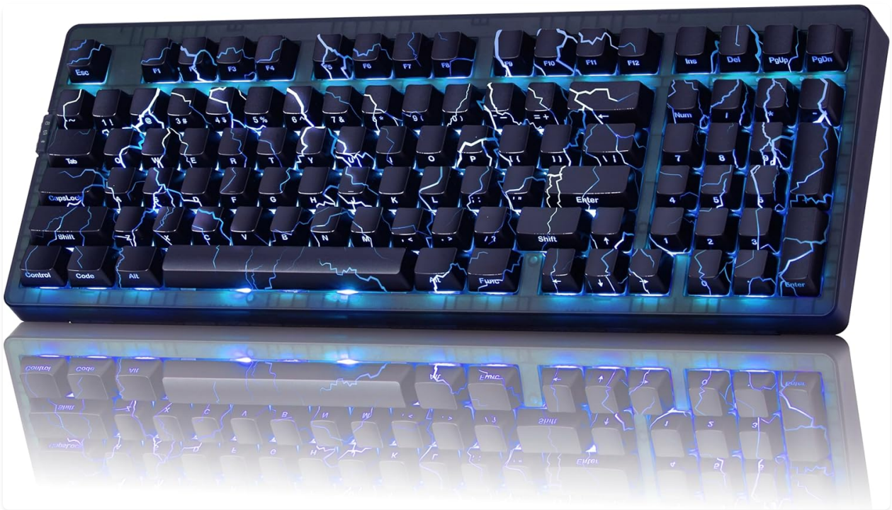
Figure 1: ZORNHER ZH980 Wireless Mechanical Keyboard

Thank you for choosing the ZORNHER ZH980 Wireless Mechanical Keyboard. This manual provides essential information for setting up, operating, and maintaining your new keyboard. Please read it thoroughly to ensure optimal performance and longevity of your device.