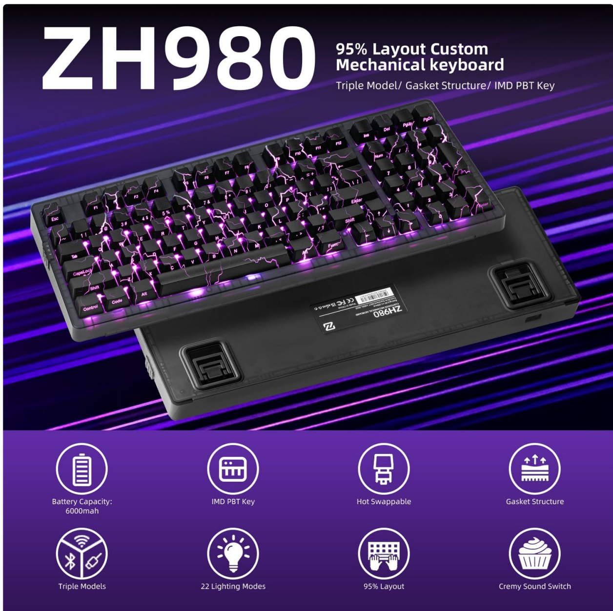
Figure 2: Overview of ZH980 features including 95% layout and gasket structure.