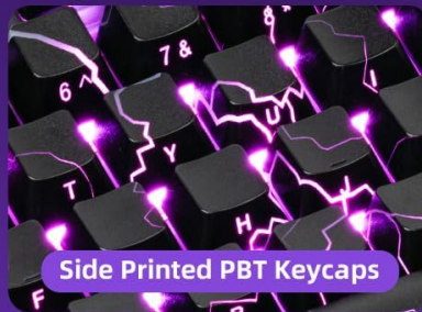
Side Printed PBT Keycaps