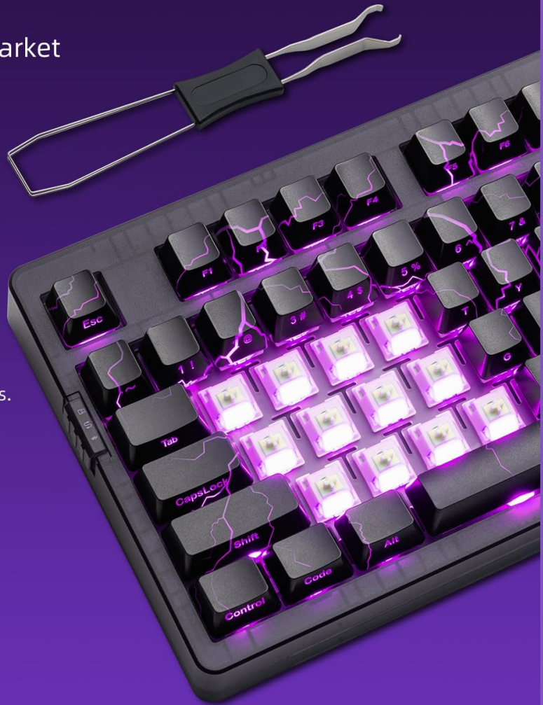
Figure 4: Triple-mode connection options for the ZH980 keyboard.