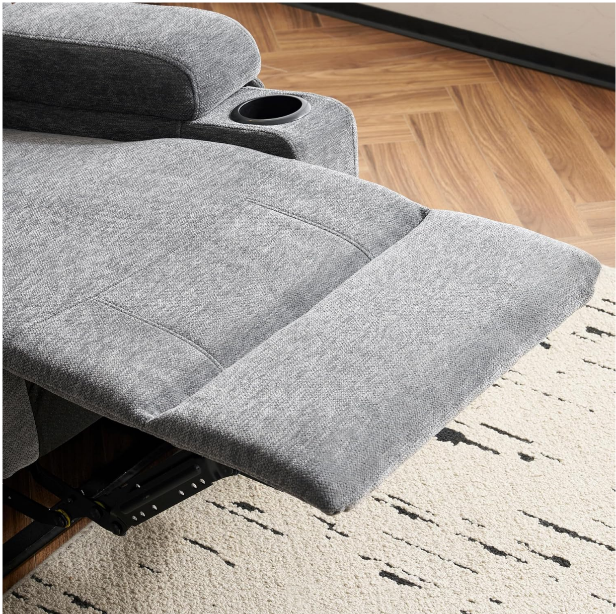
Image: The LURVIA 75-inch Manual Reclining Sofa with both end seats in a reclined position, demonstrating the extended footrests and tilted backrests. The central seat is fixed and features a closed storage drawer.