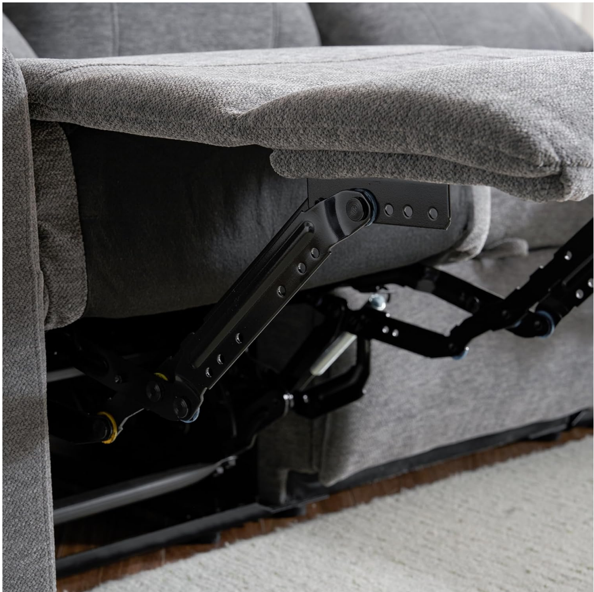
Image: A detailed view of the extended footrest on the LURVIA 75-inch Manual Reclining Sofa, highlighting the texture of the chenille fabric and the quality of the stitching.