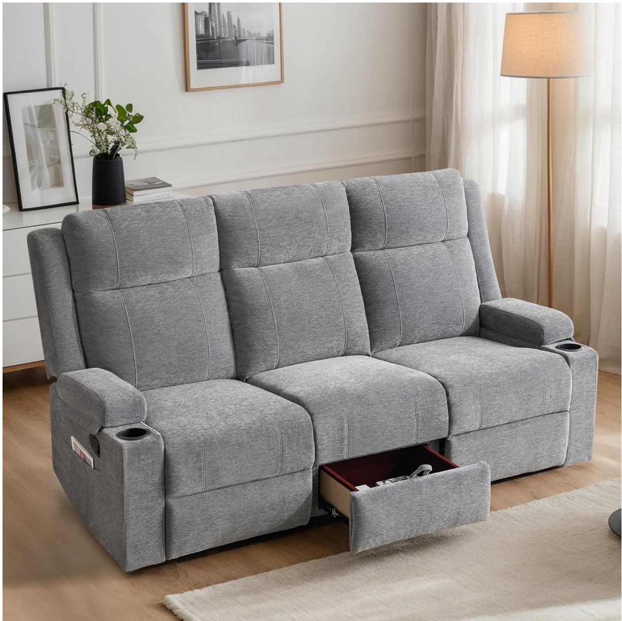
Image: The LURVIA 75-inch Manual Reclining Sofa, showcasing its three seats, cup holders, side pockets, and an open storage drawer in the center seat. The sofa is upholstered in grey chenille fabric.