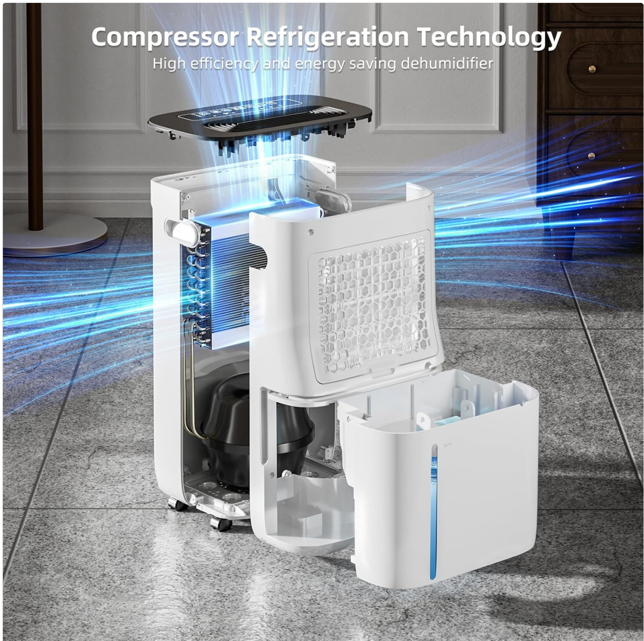
Figure 2: Internal components of the Fierscial Dehumidifier, highlighting the compressor refrigeration technology.

Your browser does not support the video tag.