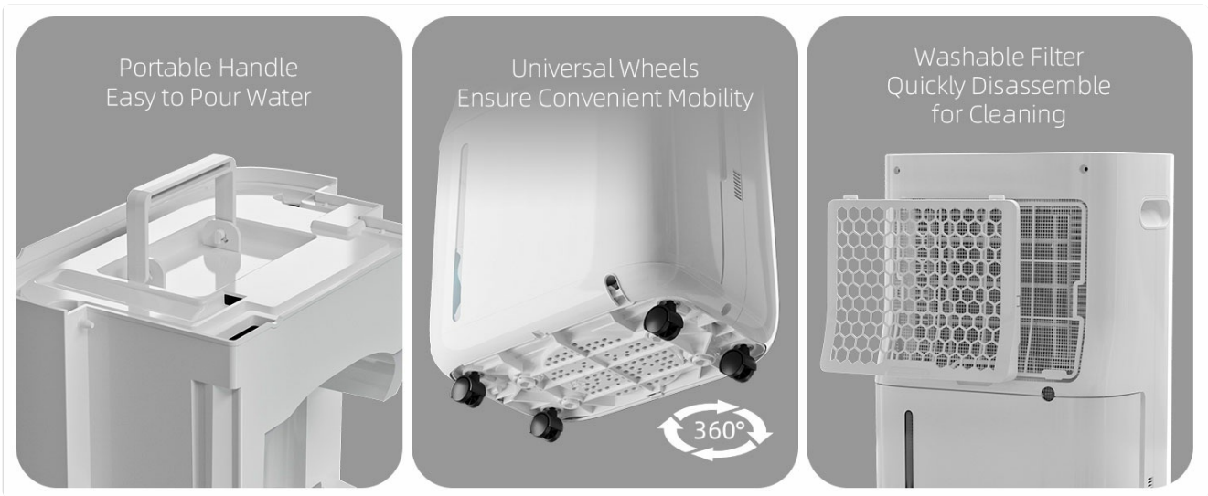
Figure 6: Features for portability and maintenance, including the washable filter.

The dehumidifier is equipped with a reusable filter. For optimal performance and air quality, regularly clean the filter. The filter can be quickly disassembled for washing.