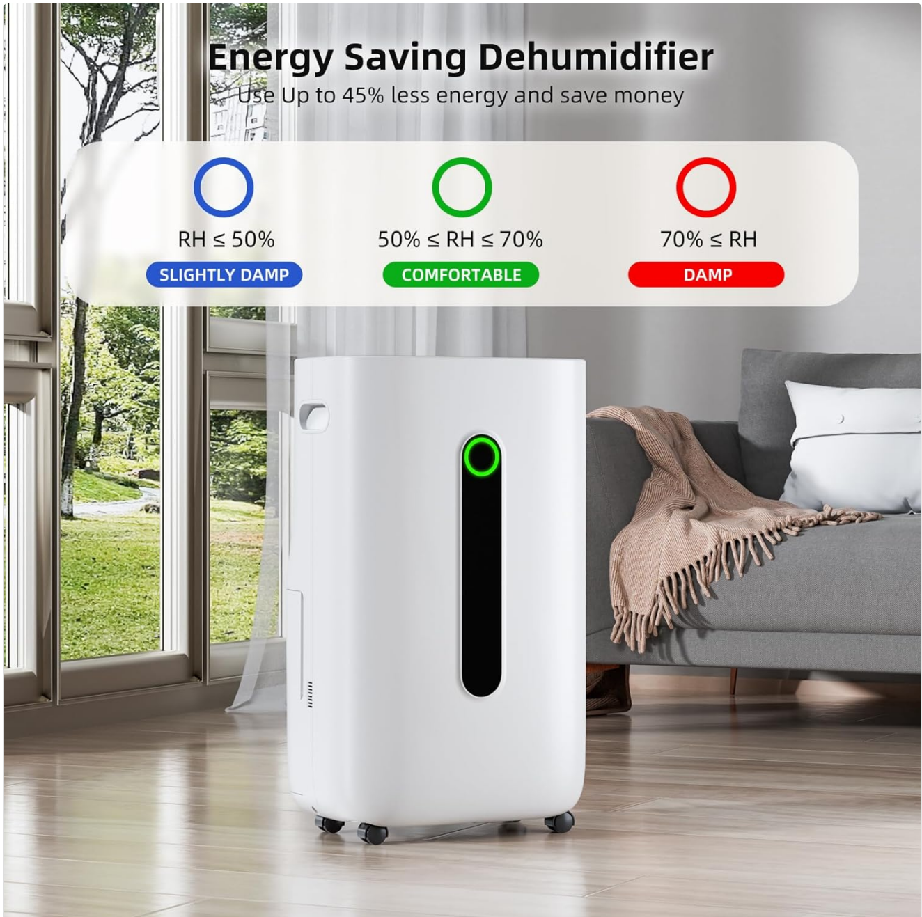
Figure 5: Humidity indicator light colors.