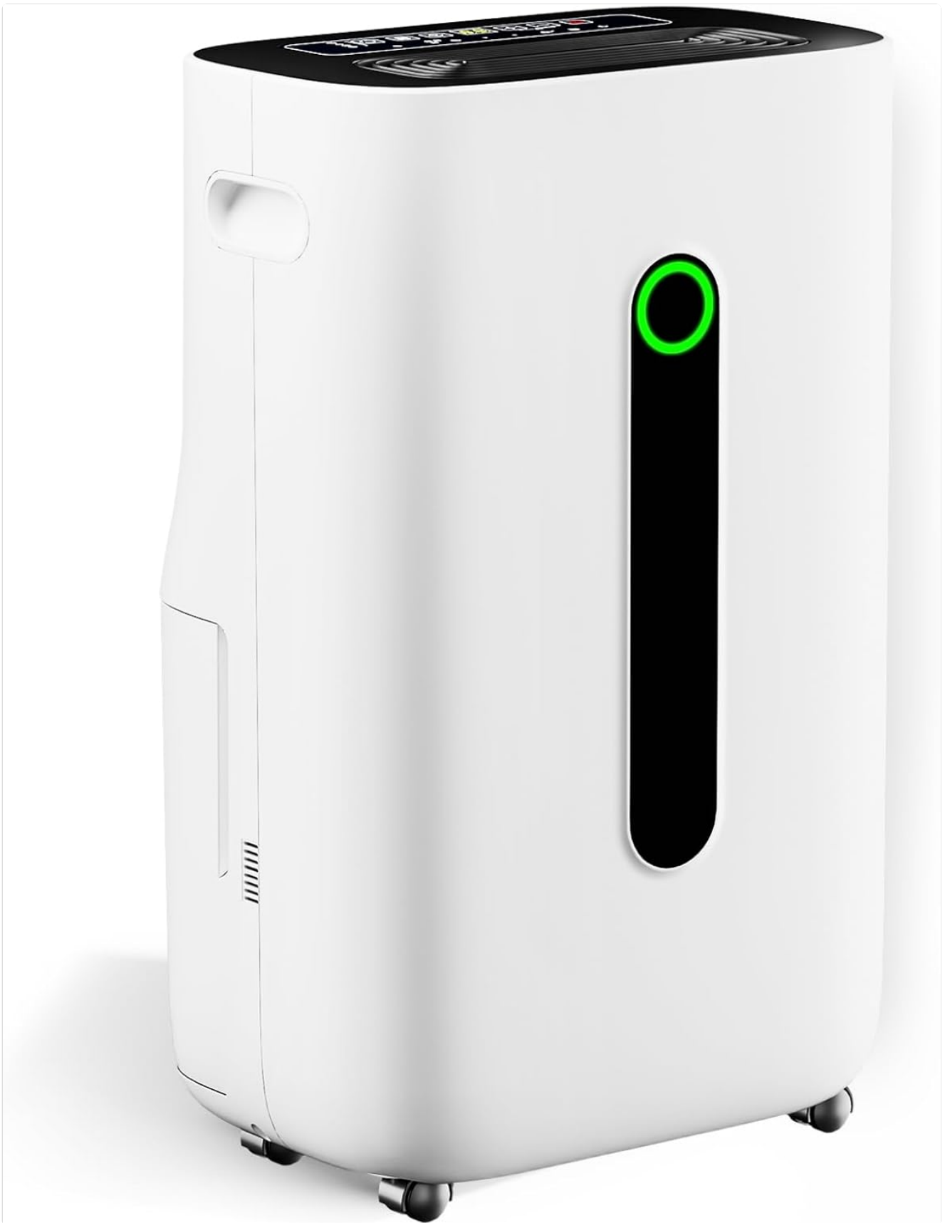
Figure 1: Fierscial 80 Pint Dehumidifier, front view.