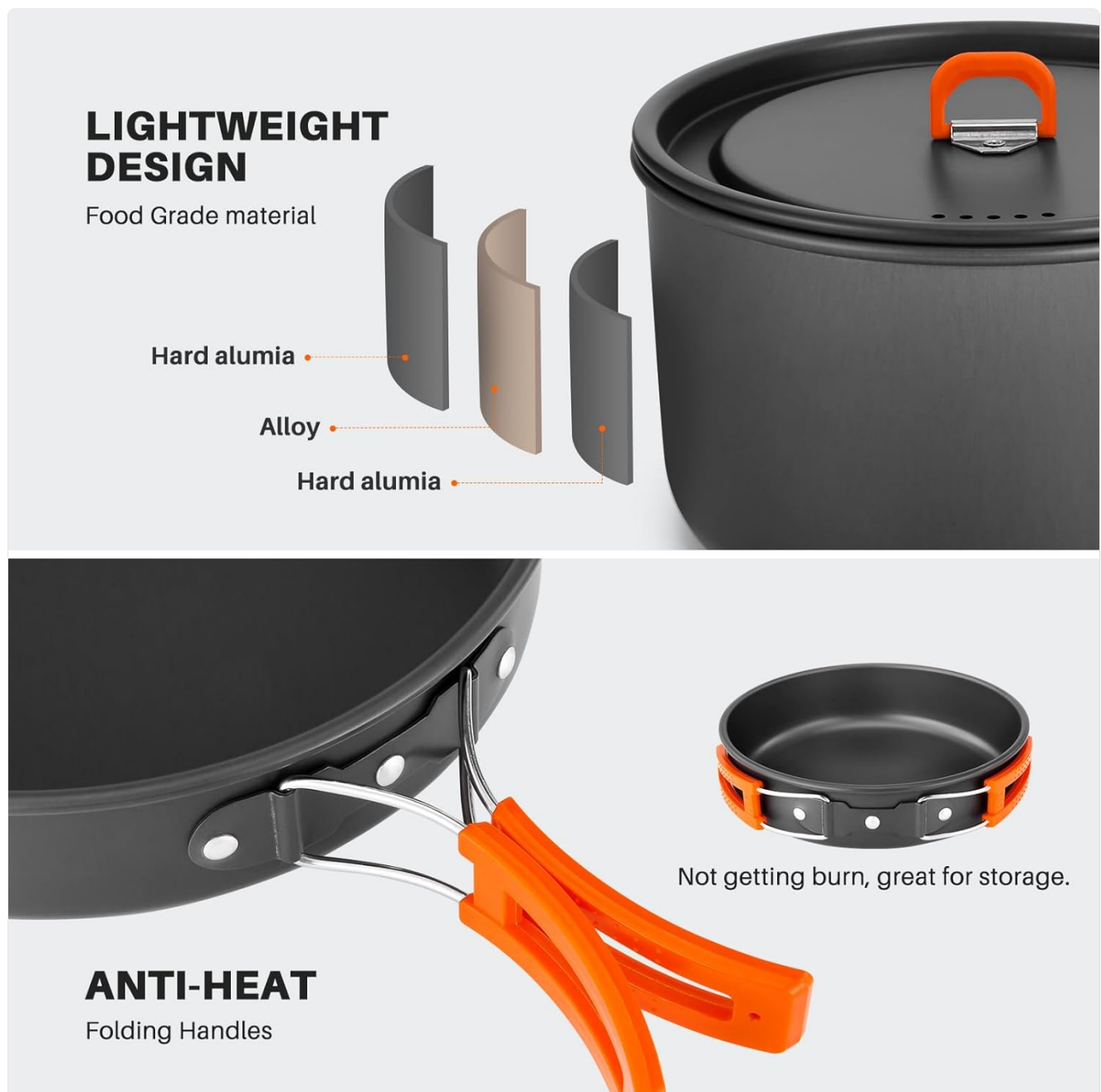
Image: Illustration highlighting the lightweight design of the cookware and the anti-heat folding handles for safe handling and compact storage.