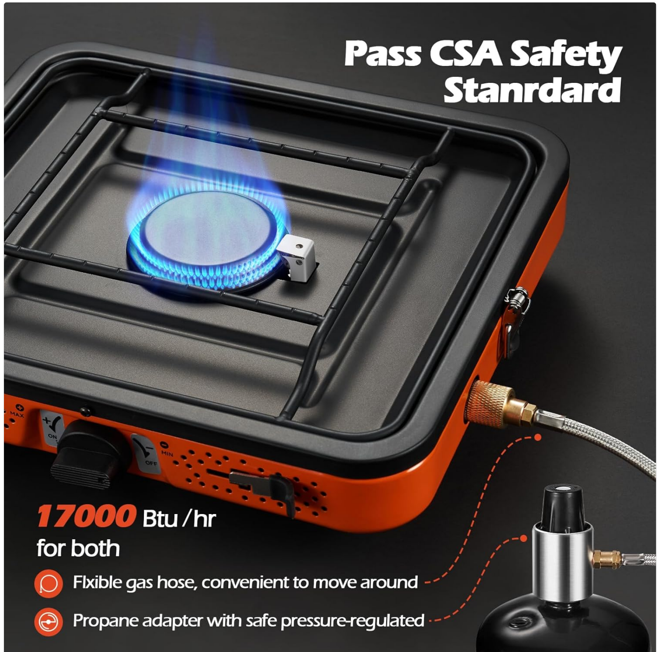
Image: The Odoland camping stove in operation, showing a lit burner and indicating its 17000 BTU/hr total power output.