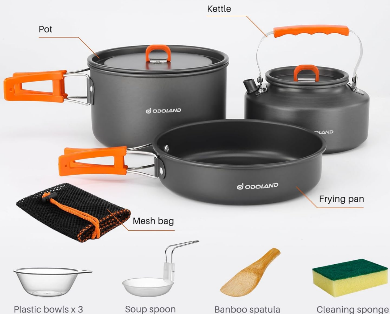
Image: A detailed view of the 10-piece camping cookware set, with each component clearly labeled for identification.