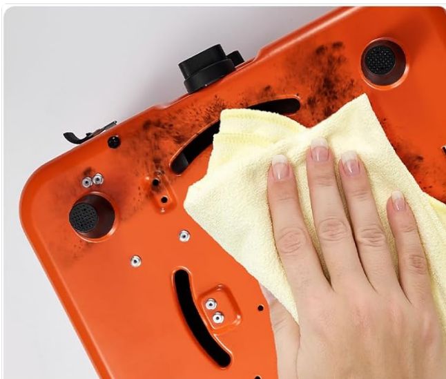
Cleans easy with a sponge and soap