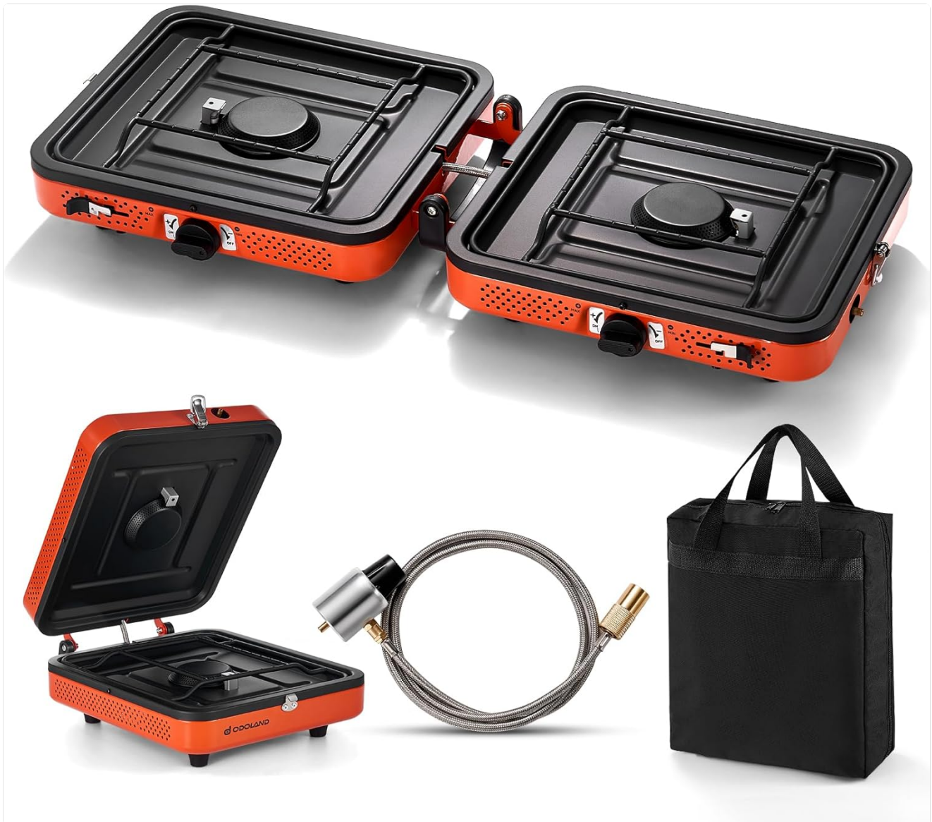
Image: The portable 2-burner camping stove in its unfolded state, alongside its flexible gas hose and carry bag.