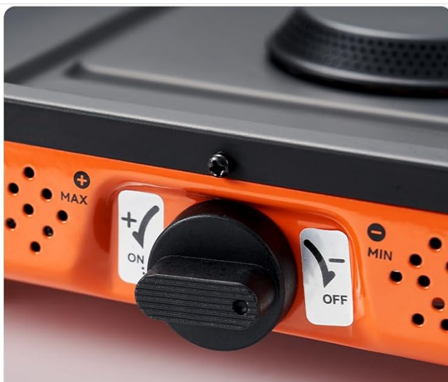
Separate control knobs with stepless heat control