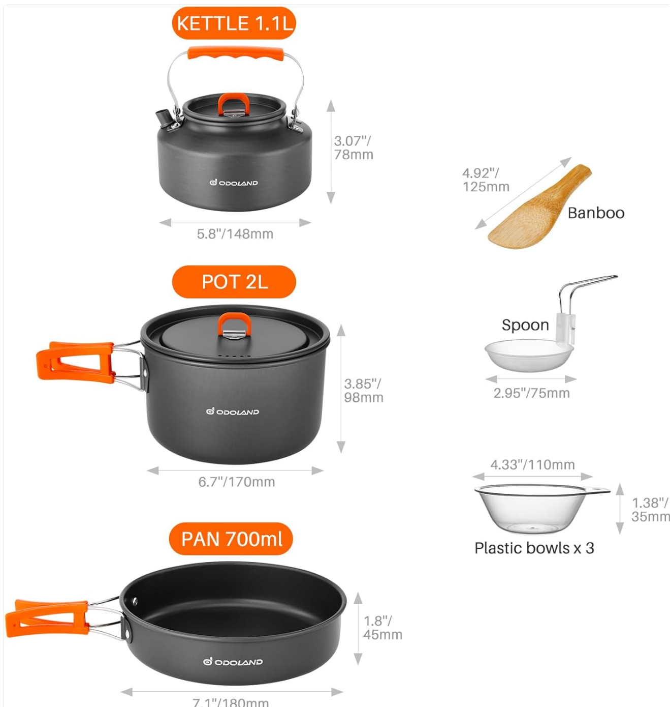
Image: Detailed dimensions for the kettle, pot, pan, plastic bowls, spoon, and bamboo spatula included in the cookware set.