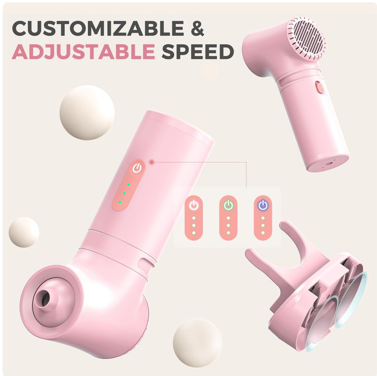
Image: Close-up of the control panel and adjustable nozzle, highlighting customizable speed settings.

Your browser does not support the video tag.