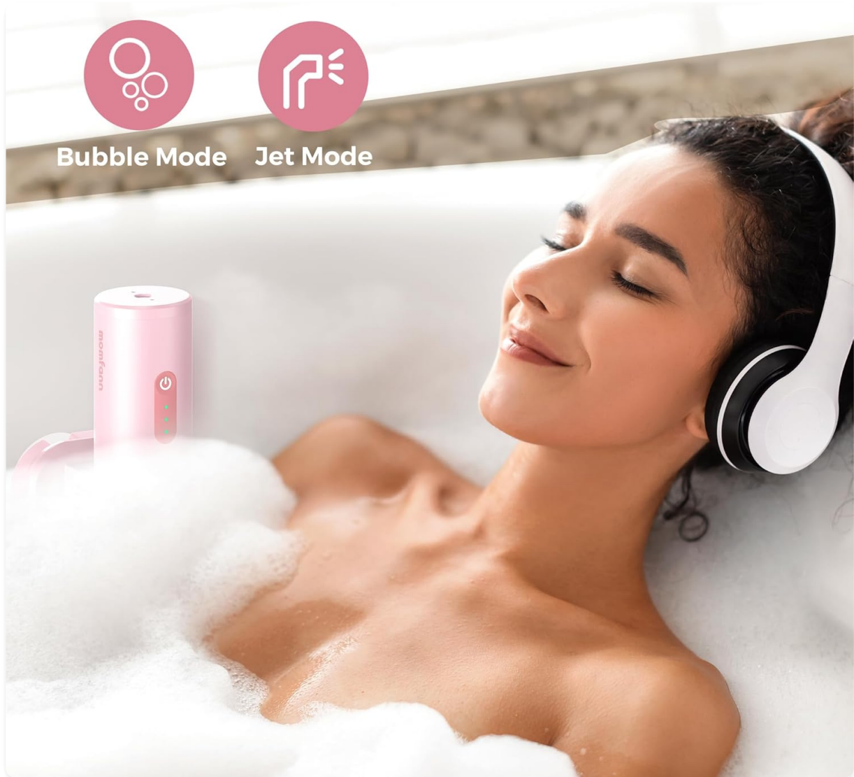
Image: Illustrates the two primary operating modes: Bubble Mode and Jet Mode.