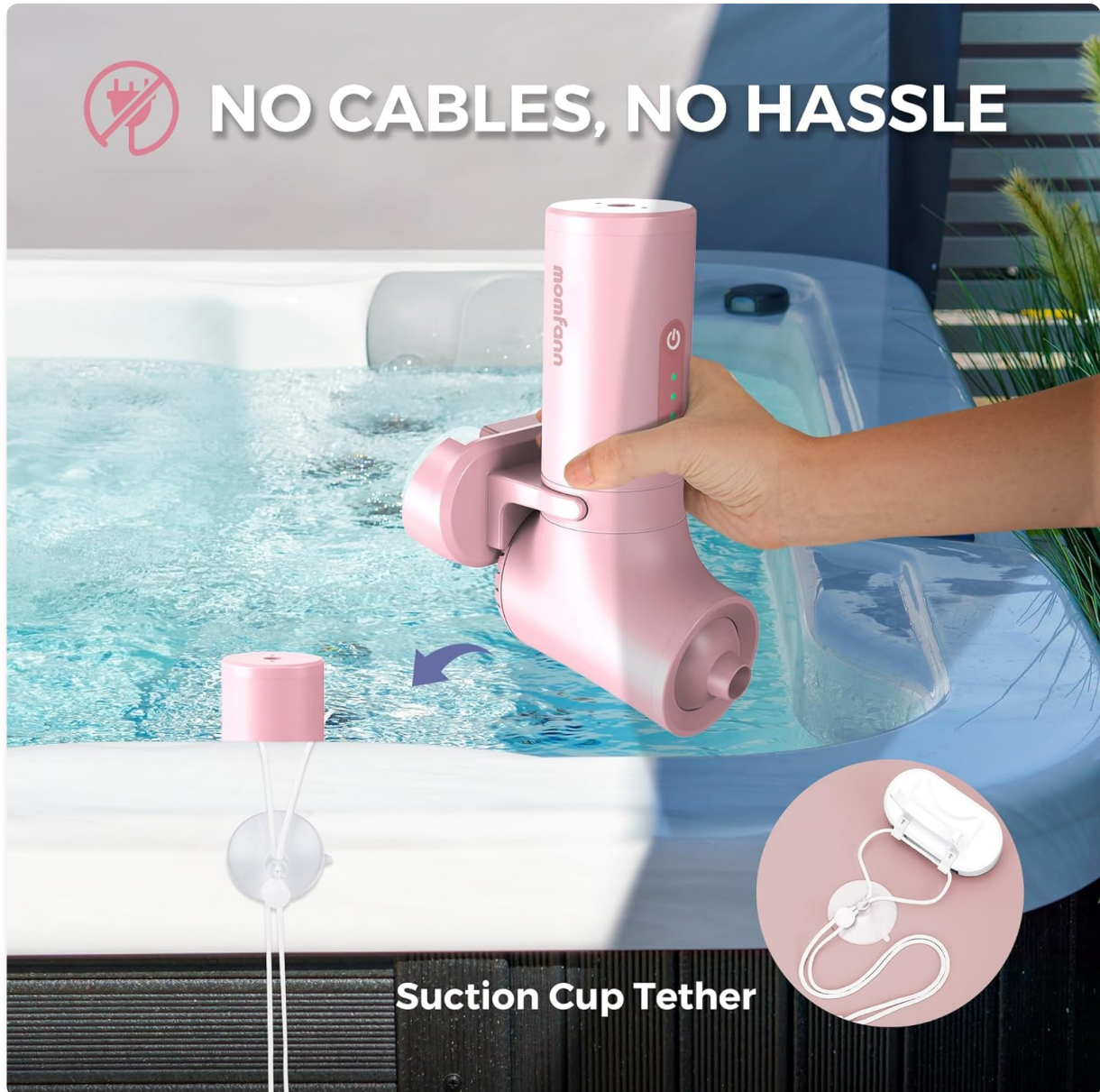
Image: Illustrates the cordless design and secure suction cup tether for tub attachment.

Video: Demonstrates the easy installation process of the MOMFANN Bath Jet Spa in a bathtub.