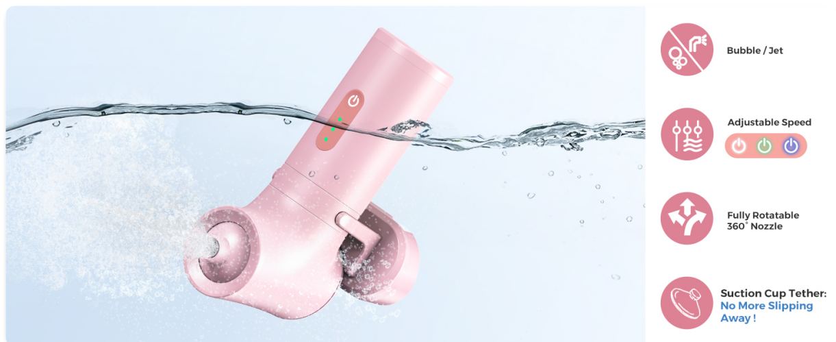
Image: Visual representation of key features including dual modes, adjustable speed, and nozzle rotation.