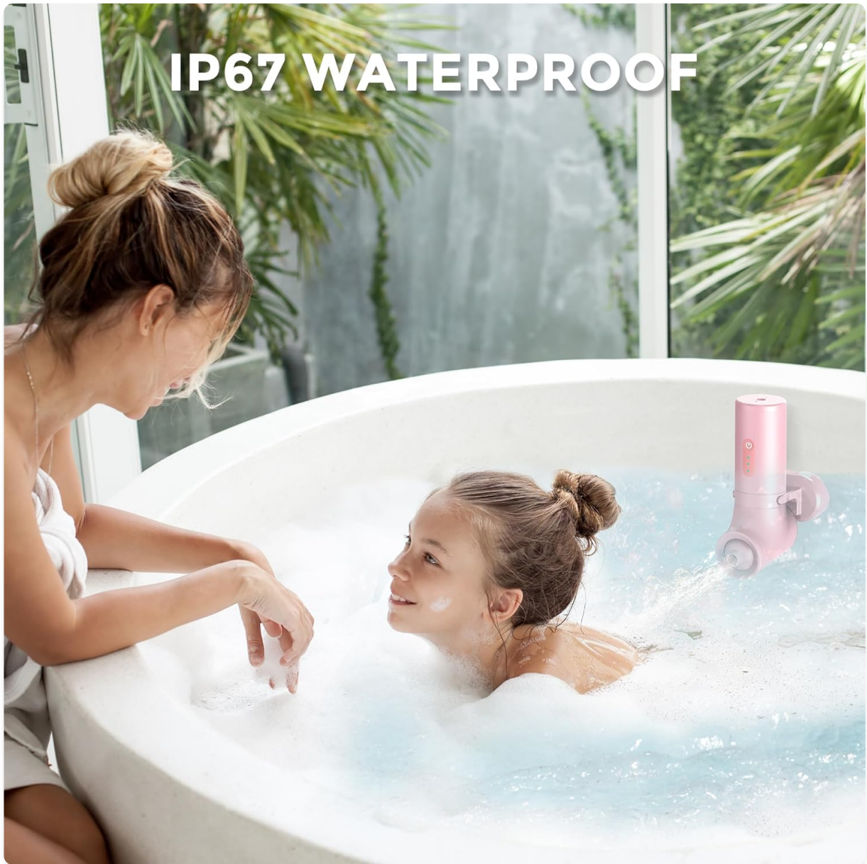
Image: MOMFANN Bath Jet Spa demonstrating its IP67 waterproof feature in a family bath setting.